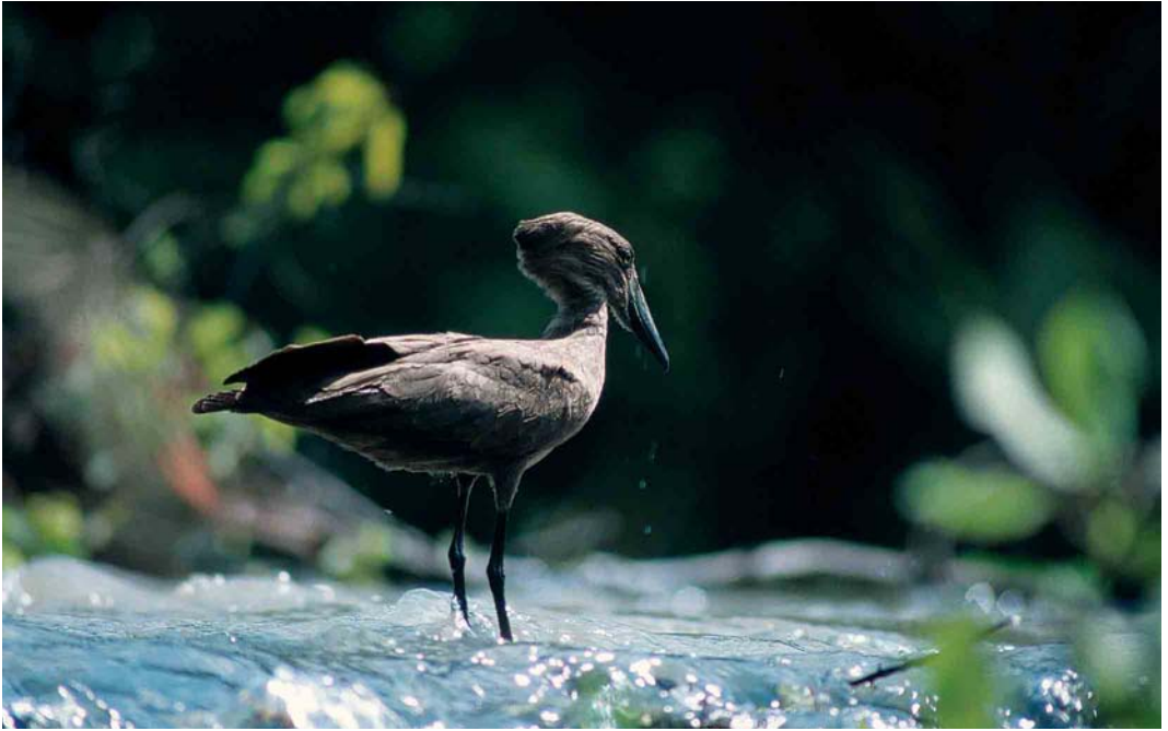
110 Hamerkop / Hamerkop Scopus umbretta, Nazinga Game Ranch, Burkina Faso, 20 November 1999 111 White-backed Night Heron / Witrugkwak Gorsachius leuconotus, juvenile, Nazinga Game Ranch, Burkina Faso, 27 May 2000. One of the potential highlights. This very elusive and nocturnal species was recently discovered in Burkina Faso