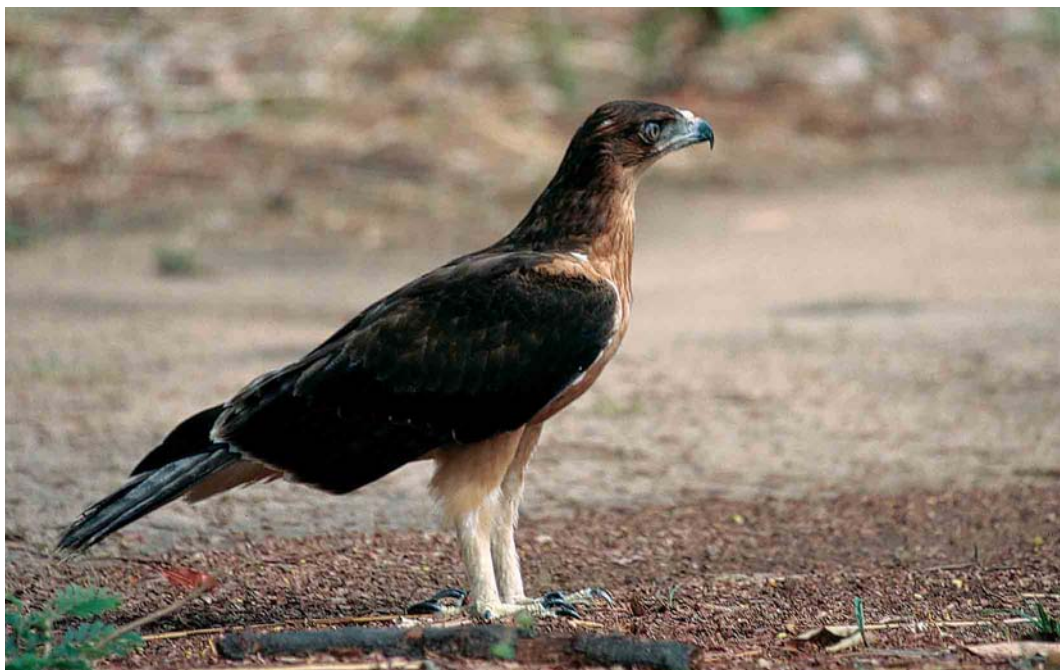
113 African Hawk Eagle / Afrikaanse Havikarend Hieraaetus spilogaster , juvenile, Nazinga Game Ranch, Burkina Faso, 14 May 2000 (Bruno Portier)