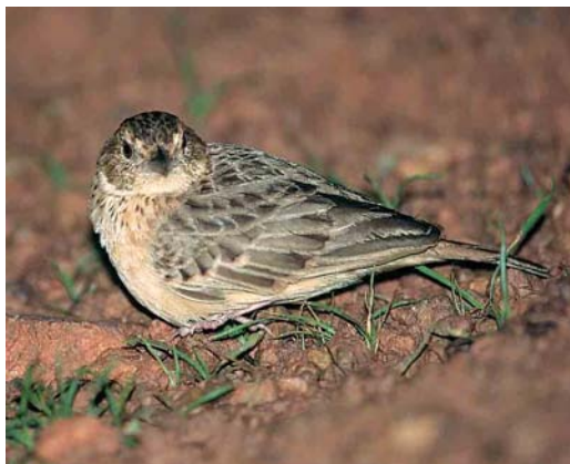
127 Flappet Lark / Ratelleuwerik Mirafrá rufocinnamomea buckleyi , Nazinga Game Ranch, Burkina Faso, 27 May 2000 ( Bruno Portier ). When the rainy season begins, this species is often located by its particular wing beats