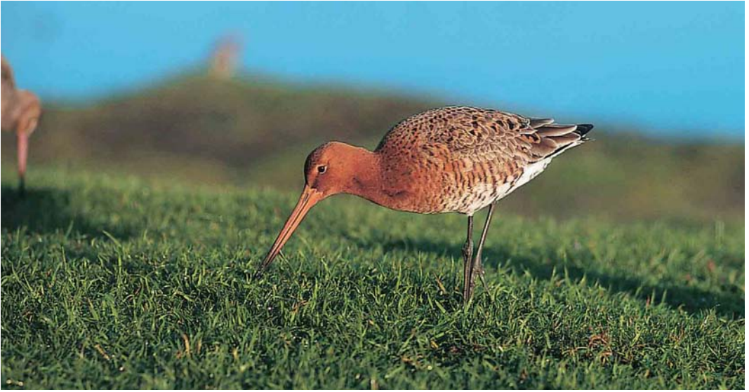
146 'Eureka!' the visitor said, matching the Black-tailed Godwit to an illustration in the book. 'Brick-red throat and chest, heavily patterned upperparts and a yellow bill base. Have a look dear – it's a Red-throated Pipit.' (Anthony McGeehan)

the household now wish to see the star bird himself, but he also wants to show it to his four kids, one of whom is sucking a dummy and has been clattering into tripod legs since arriving.