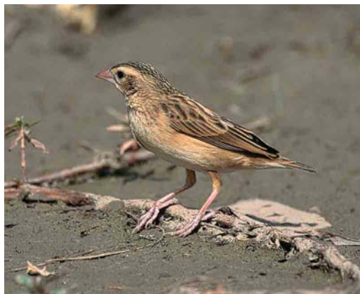
128 Black-winged Bishop / Roodvoorhoofdwever Euplectes hordeaceus , female or immature, Nazinga Game Ranch, Burkina Faso, 6 December 2000 ( Bruno Portier )

ciated islands. Priority sites for Conservation, Birdlife Conservation Series 11, pp 117-125.