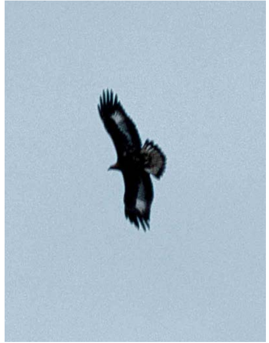
159 Alpengierzwaluw / Alpine Swift Apus melba , Lauwersmeer, Groningen, 1 april 2002 (Eric Koops) 160 Steenarend / Golden Eagle Aquila chrysaetos , tweede-kalenderjaar, Amen, Drenthe, 6 maart 2002 (Roef Mulder) 161 Grote Zilverreigers / Great Egrets Casmerodius albus , Veenhuizerstukken, Groningen, 13 maart 2002 (Eric Koops)