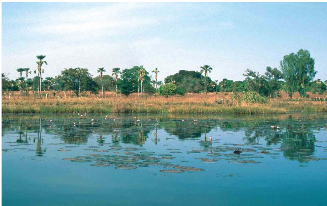
119 Tengrela Marshes, Tengrela, Burkina Faso, 25 February 2001