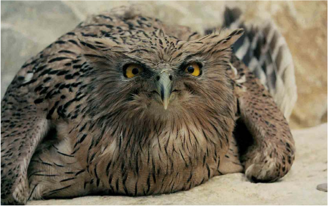
143-144 Brown Fish Owl / Bruine Visuil Ketupa zeylonensis , Adana region, Turkey, late April 1990 (Haşim Kılıç/DHKD)