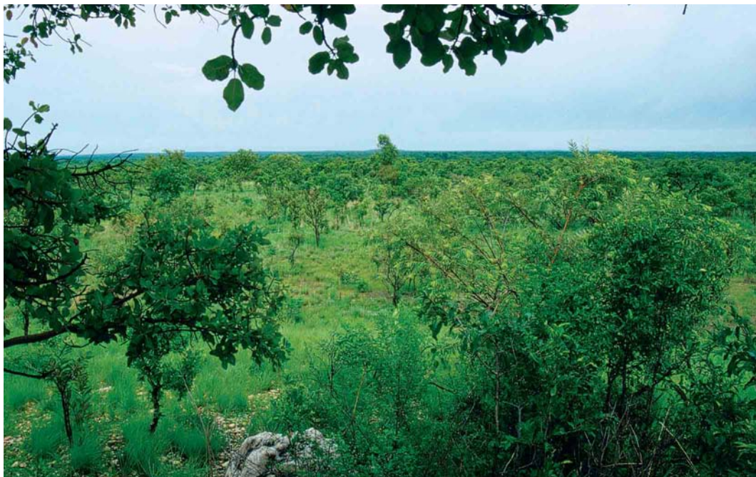
118 Typical view of tree savanna in mid-July, Nazinga Game Ranch, Burkina Faso, 12 July 1999