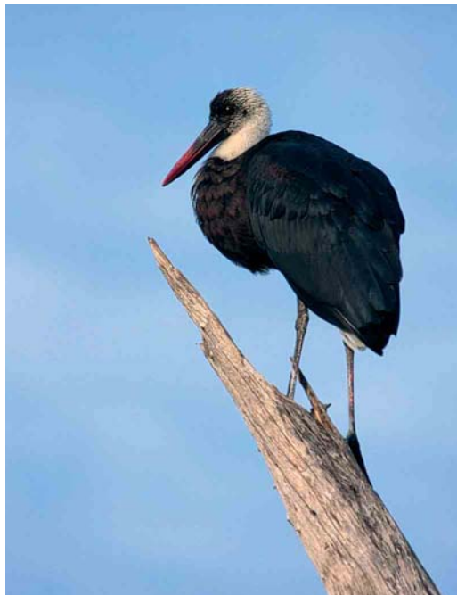
123 Woolly-necked Stork / Bisschopsooievaar Ciconia episcopus, Nazinga Game Ranch, Burkina Faso, 29 May 2000

plain that provides food for a Hippo herd which occupies the lake, sometimes sharing the shores with African Elephants from the nearby Maro Reserve.