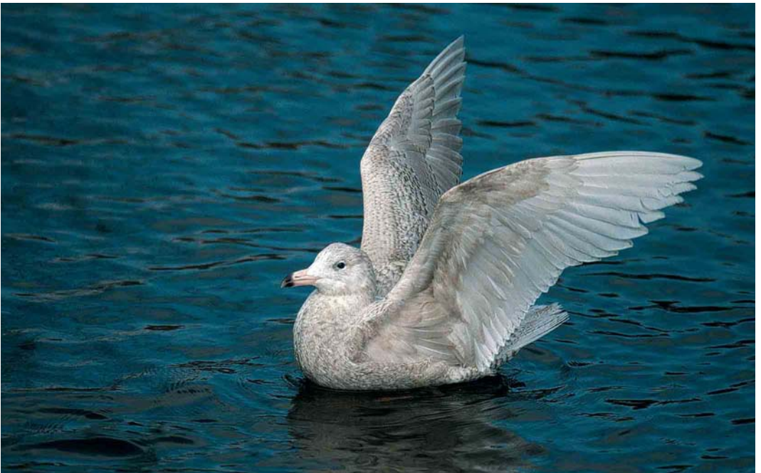
163 Grote Burgemeester / Glaucous Gull Larus hyperboreus , eerste-winter, Schiedam, Zuid-Holland, 23 maart 2002 ( Jan van Holten )