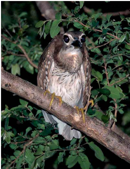
122 White-backed Night Heron / Witrugkwak Gorsachius leuconotus , juvenile, Nazinga Game Ranch, Burkina Faso, 27 May 2000 (Bruno Portier)