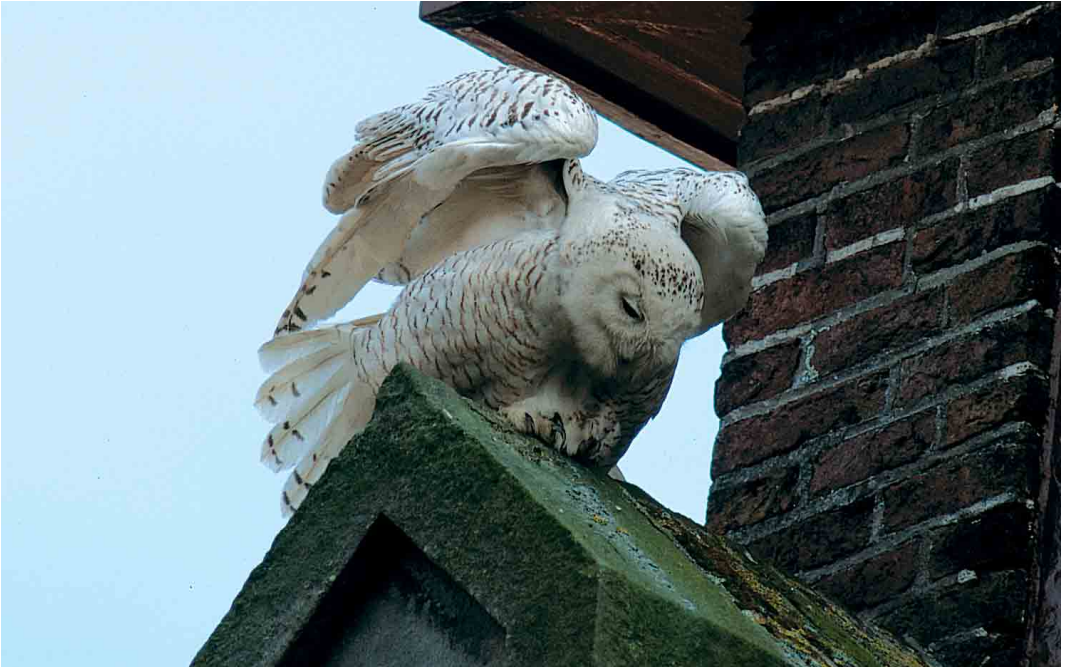
162 Sneeuwuil / Snowy Owl Nyctea scandiaca , eerste-winter mannetje, Hippolytushoef, Noord-Holland, 19 april 2002 ( Harm Niesen )