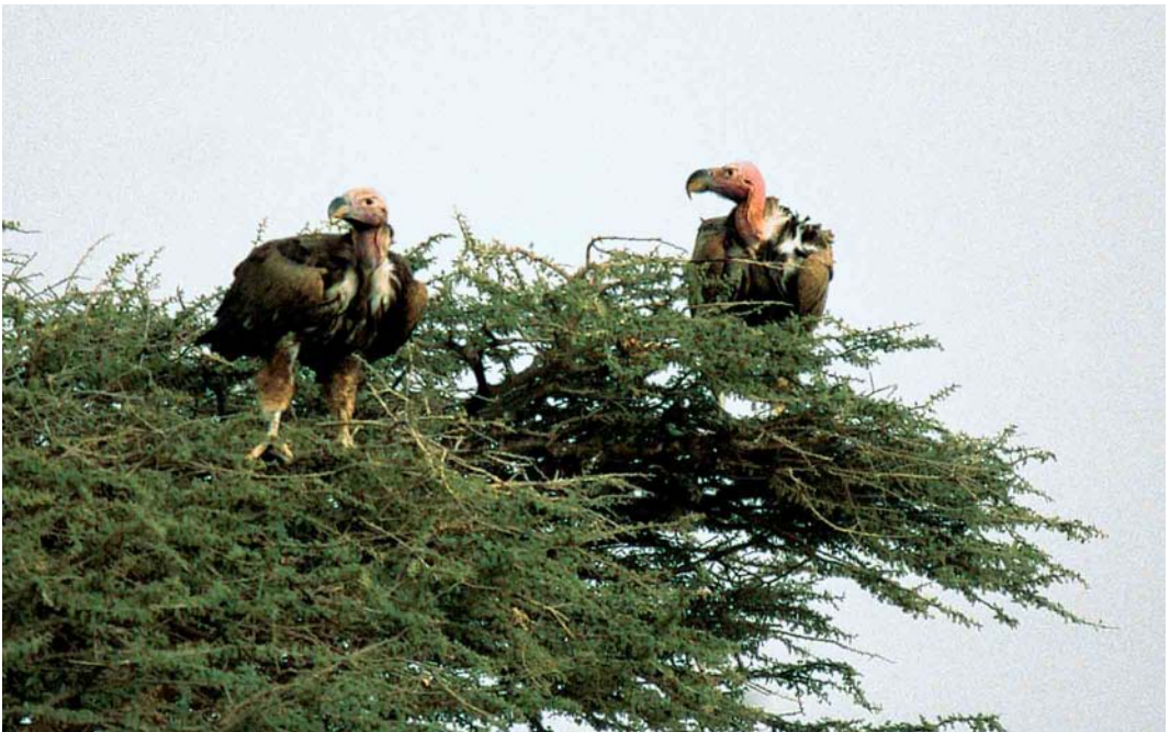
149 Lappet-faced Vultures / Oorgieren Torgos tracheliotus , Shalatein, Egypt, 19 March 2002 (Eric Didner)