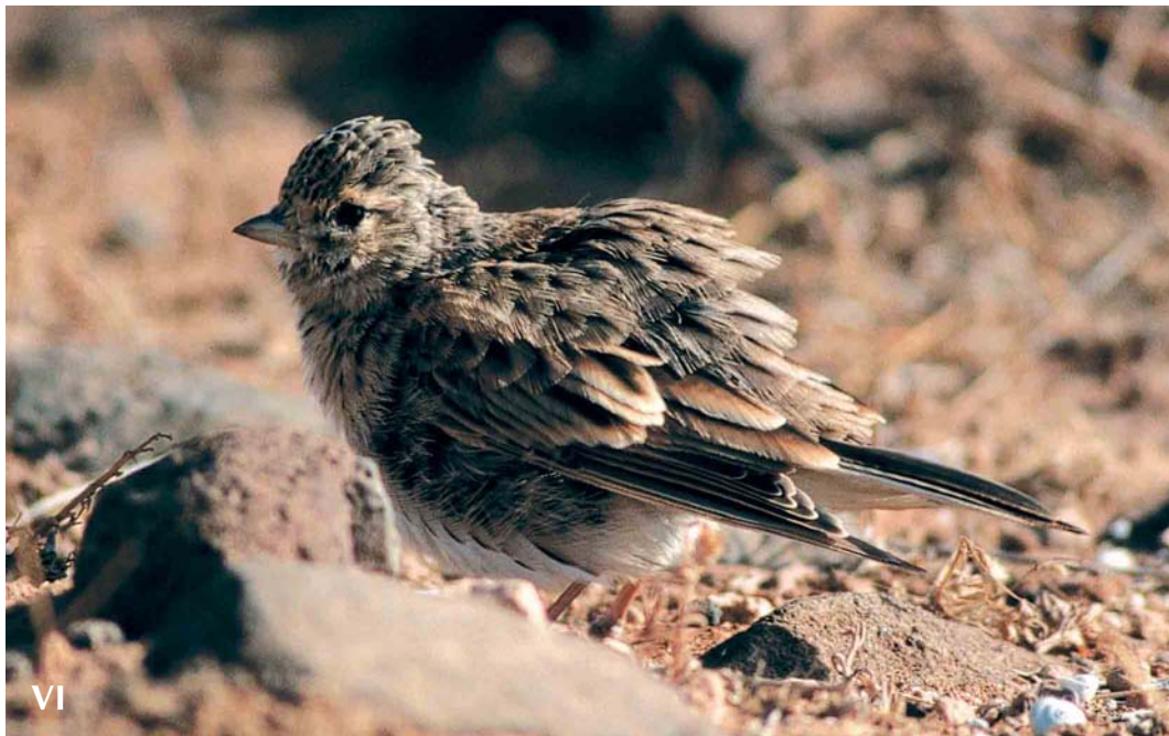
Mystery photograph VI (August)

So, now we are left with Green and Solitary Sandpiper. The easiest character to separate these two species is the dark rump of Solitary, which is white in Green. This character, however, cannot be seen on the mystery photograph because the rump is covered by the wings. Another feature of adult summer Solitary are the streaked fore flanks. In this photograph, this feature cannot be judged safely but any streaking seems to be missing. A more subtle character of Solitary Sandpiper can be found on the outermost tail-feathers, which can be seen on the mystery photograph. In Green, the two outermost tail-feathers (t5-6) are white, frequently with a small subterminal dark spot on the outer web. In Solitary, the barring on the tail reaches the outermost tail-feather with one or two dark brown lines. In addition, the tail-bars are somewhat broader in Green than in Solitary. As can be seen on the photograph, the mystery bird shows at least two dark bars on its outer tail-feather, thus fitting Solitary. Loss of its outer tail-feathers is not very likely as the bird is photographed in May and Solitary renews its tail-feathers in a complete moult after breeding, mostly in their wintering quarters. Occasionally, the central tail-feathers