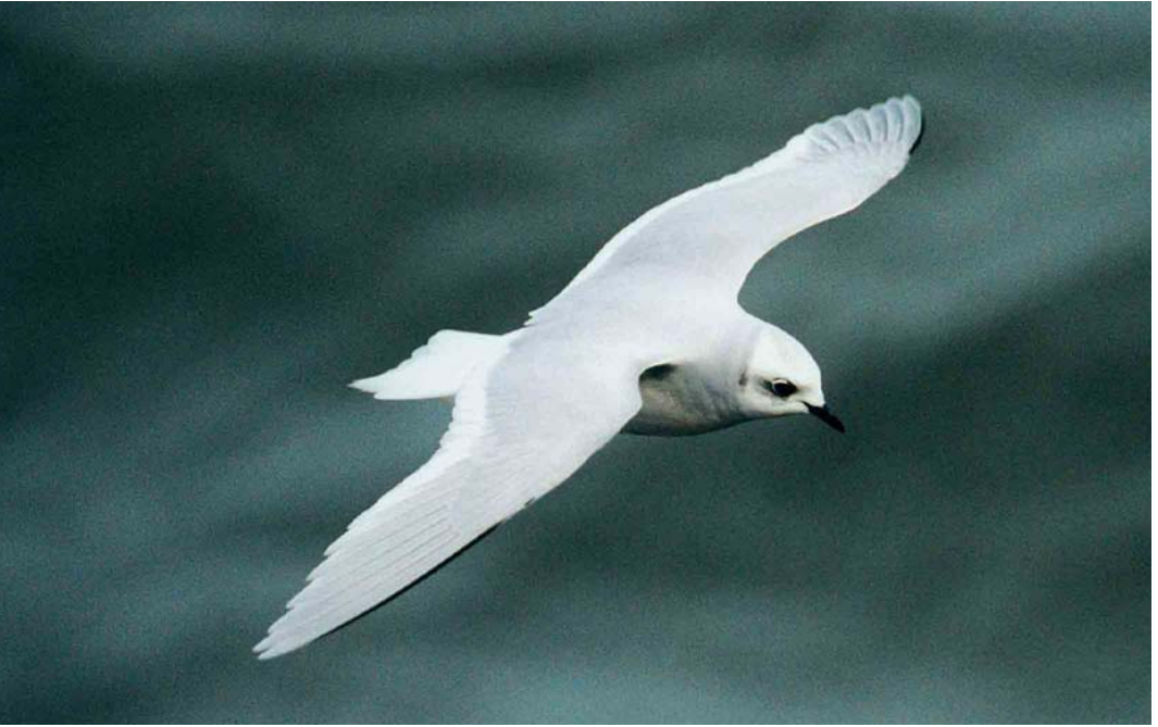
148 Ross's Gull / Ross' Meeuw Rhodostethia rosea , adult, Scarborough, North Yorkshire, England, March 2002 (Iain H Leach)

RAPTORS A Turkey Vulture Cathartes aura stayed south of Landskrona, Sweden, from 6 May (for previous sightings in Europe, see Dutch Birding 20: 45, 1998; 22: 113-114, 164, 233, 2000). A record 21 migrating Crested Honey Buzzards Pernis ptilorhynchus were counted near Eilat, Israel, on 30 April; 17 were seen at Lotan on 1 May and eight on 2 May. By 23 May, this spring's total for Israel had risen to 98. Four Cape Verde Kites ' Milvus fasciicauda ' were reported from Boavista in July-August 2001 (one being documented by photographs); moreover, two individuals and six Black Kites M. migrans with two possible hybrids were claimed from Maio in 2001. Possibly the second Yellow-billed Kite M. (m) aegyptius for Israel was reported over the Eilat mountains on 7 May. In the Netherlands, a Black-winged Kite Elanus caeruleus reportedly flew past Ventjagersplaten, Zuid-Holland, on 8 May. An adult was found at Aiguamolls, Girona, Spain, on 15 May. Presumably the first Lammergeier Gypaetus barbatus to be accepted as a wild bird in the Netherlands was an unmarked and unringed immature over Flevoland and Noord-Holland on 2 June and then on Texel, Noord-Holland, later that day and staying to 4 June. Also in the Netherlands, five sightings of Eurasian Griffon Vultures Gyps fulvus on 16-20 May concerned one flying south over the Noord-Holland dunes on 16 May, one over Breskens, Zeeland, on 17 May, two over Veendam, Groningen, on 17 May, one over Marnevaard, Lauwersmeer, on 18 May, and one over