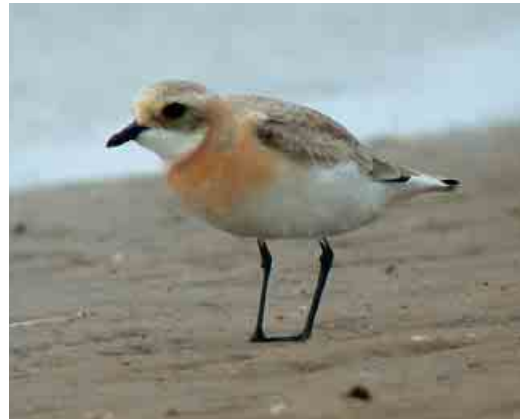
150 Pacific Golden Plover / Aziatische Goudplevier Pluvialis fulva , Harger- en Pettemerpolder, Noord-Holland, Netherlands, 14 April 2002 151 Great Snipe / Poelsnip Gallinago media , Maassluis, Zuid-Holland, Netherlands, 16 May 2002 152-153 Lesser Sand Plover / Mongoolse Plevier Charadrius mongolus , Rimac, Lincolnshire, England, May 2002

ladelphia was seen at Le Croisic, Loire-Atlantique, France, on 13 March. In England, the adult staying until 9 March at Millbrook, Cornwall, turned up at Paghham, West Sussex, on 16 March where it remained until at least 25 March. In Scotland, an adult was found on South Uist, Outer Hebrides, Scotland, on 28 April. In Spain, the first Audouin's Gull L audouinii for Cantabria was a third-summer at Somo in Santander bay from 5 May. In France, singles were seen at Lapalme, Aude, on 24 April (second-summer), at Portiraques, Hérault, on 1 May and at the Camargue on 16 May. In Sardinia, up to 4000 Slender-billed Gulls L genei were counted at Molentargius on 14 April. On 15 May, one was reported at Wollmatinger Ried, Baden-Württemberg, Germany. On Flores, Azores, not only four first-winter Ring-billed Gulls L delawarensis but also a first-winter American Herring Gull L smithsonianus was observed at Lagoa Rasa on 16 April.