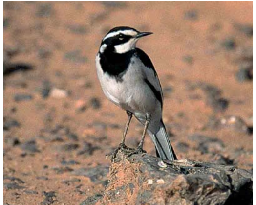
154 Subalpine Warbler / Baardgrasmus Sylvia cantillans , male, Hargen, Noord-Holland, Netherlands, 13 May 2002 ( Harm Niesen ) 155 Pied Stonechat / Zwarte Roodborsttapuit Saxicola caprata , Eilat, Israel, 29 March 2002 ( Mark Thomas ) 156 Franklin's Gull / Franklins Meeuw Larus pipixcan , adult, Banjul, Gambia, 17 January 2002 ( Oane Tol ) 157 African Pied Wagtail / Afrikaanse Bonte Kwikstaart Motacilla aguimp , Abu Simbel, Egypt, 24 March 2002 ( Eric Didner )

reported from Beilen, Drenthe, on 20 April. An adult at Oldenburg, Niedersachsen, Germany, on 11 April also wore a Finnish colour-ring. A first-winter Iceland Gull L. glaucooides was (still) at Santa Cruz das Flores, Azores, on 5 April. A second-winter or adult Ross's Gull Rhodostethia rosea stayed at Peterhead, Aberdeenshire, Scotland, on 9-11 March. In England, adults were seen in Cornwall and Devon until 5 March; at Scarborough, North Yorkshire, from 16 March to 4 April; and at Blacktoft Sands, East Yorkshire, on 31 March; and a first-winter was found in Gloucestershire on 16 April. In the Netherlands, an immature was reported from Grote Vlak, Texel, Noord-Holland, on 23 April. In Shetland, Scotland, a first-winter was present at Mainland from 10 May onwards. An adult was seen in Hrutafjörður, Iceland, on 22 May. Seven Lesser Crested Terns Sterna bengalensis at Tarifa