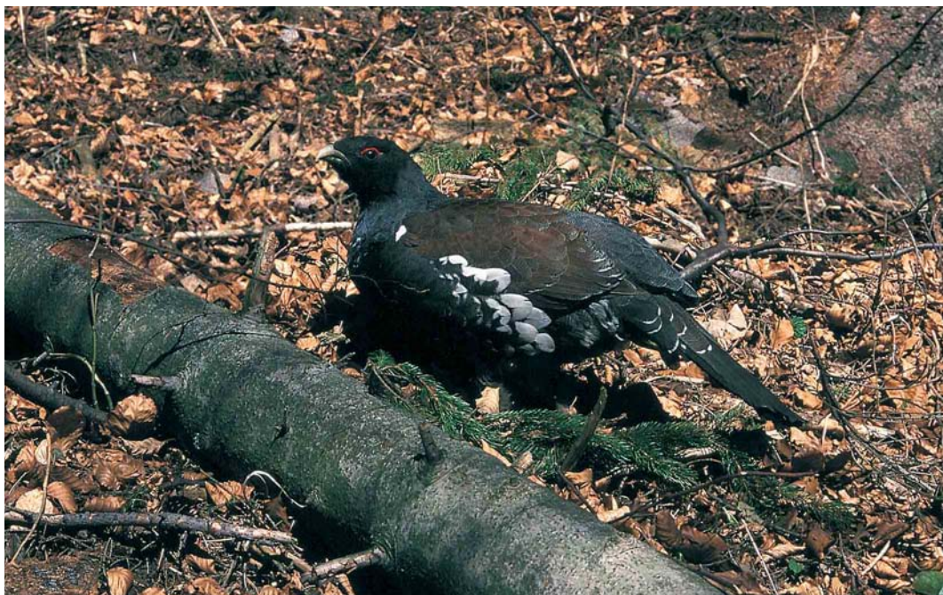
9 Western Capercaillie / Auerhoen Tetrao urogallus , male after morning display on the ground, Vel'ká Fatra mountains, Slovakia, 20 April 1996