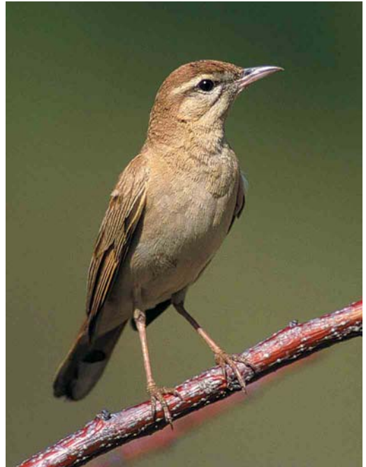
19 Western Rufous-tailed Scrub Robin / Westelijke Rosse Waaierstaart Cercotrichas galactotes galactotes , Algarve, Portugal, 3 June 1998. Note rufous to creamy suffusion of underparts unlike weak greyish suffusion of eastern subspecies group

C g familiaris (east from eastern Turkey) (Cramp, S (editor) 1988, The birds of the Western Palearctic 5, Oxford).