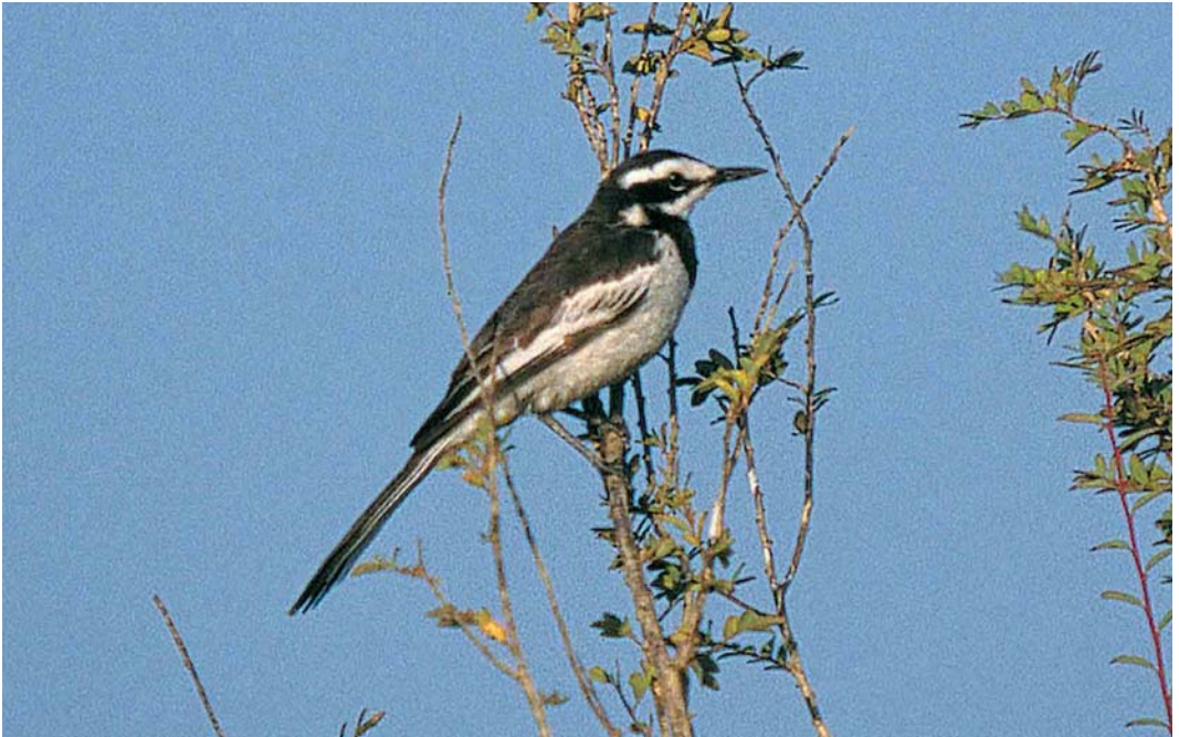
56 Mekong Wagtail / Mekongkwikstaart Motacilla samveasnae , male, Stung Treng Province, Cambodia, February 2001 (Pete Davidson)

The species occurs along the Mekong river and its tributaries in Cambodia and Laos. Apart from the 1972 record, the species has not yet been recorded again in Thailand but could well occur there. Mekong Wagtail does not seem to be under direct threat and numbers are considered to be 'healthy' in Cambodia. However,