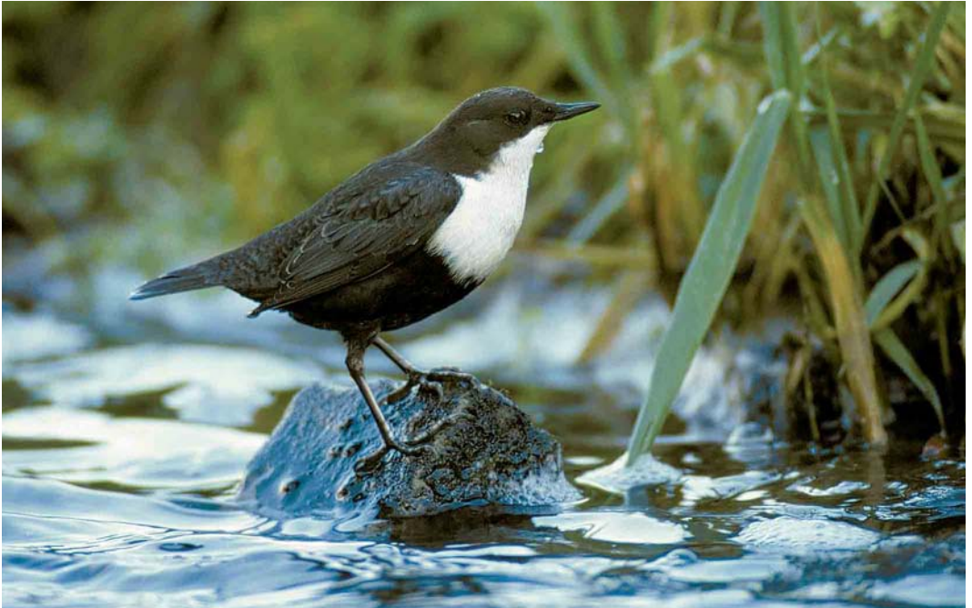
53 Zwartbuikwaterspreeuw / Black-bellied Dipper Cinclus cinclus cinclus , Amsterdamse Waterleidingduinen, Noord-Holland, 27 november 2001