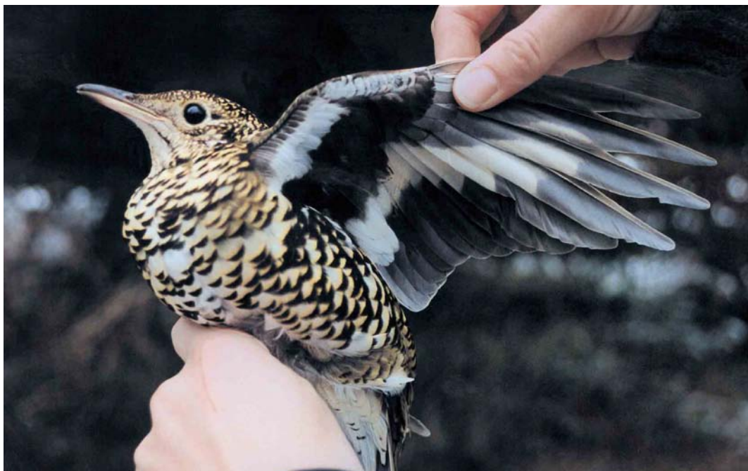
35-36 White's Thrush / Goudlijster Zosterorhina aurea , first-winter female, Salaspils, Latvia, 24 November 2001 (Agris Celmins)