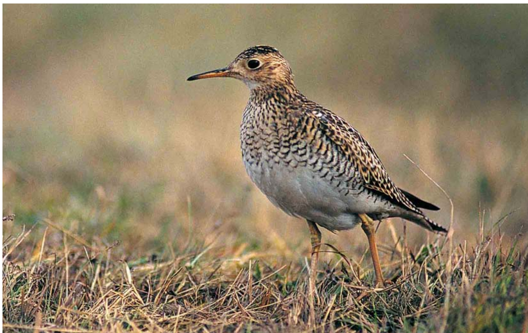
30 Upland Sandpiper / Bartrams Ruiters Bartramia longicauda , first-year, Karlsborg, Västergötland, Sweden, November 2001