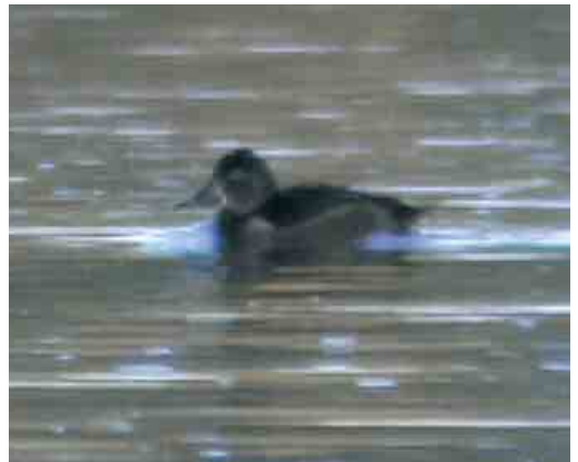
42 Hybride Witoogeed x Tafeleend / hybrid Ferruginous Duck x Common Pochard Aythya nyroca x ferina , vrouwtje, Oostvaardersdijk, Flevoland, 23 december 2001 43 Hybride Witoogeed x Tafeleend / hybrid Ferruginous Duck x Common Pochard Aythya nyroca x ferina , vrouwtje, Oostvaardersdijk, Flevoland, 23 december 2001. Tafeleendachtig snavelpatroon met brede zwarte punt en lichte subterminale band die beide langs snijranden teruglopen richting snavelbasis, lange snavel en groot formaat verschillen van zuiver vrouwtje Witoogeed en duiden op hybride met Tafeleend 44 Ringsnaveleend / Ring-necked Duck Aythya collaris , vrouwtje, Lobith, Gelderland, 10 november 2001

november maximaal twee bij Wierum. Een vrouwtje Ringsnaveleend Aythya collaris zwom op 10 november een middagje in de Bijland bij Lobith, Gelderland. Witoogeeden A nyroca werden opgemerkt op 4 november bij Wessem, Limburg, en op 22 december ten noorden van Eindhoven, Noord-Brabant. Een tweetal kruisingen met Tafeleend A ferina verbleef eind december langs de Oostvaardersdijk, Flevoland. De Amerikaanse Smient Mareca americana van Uithoorn, Noord-Holland, bleef daar tot 3 november. Andere bevonden zich op 9 november op de Ouderkerkerplas, Noord-Holland, van 25 november tot in januari in de Kapelsche Moer, Zeeland, en op 29 december bij Vlaardingen, Zuid-Holland. Een Amerikaanse Winter-taling Anas carolinensis werd op 25 november gezien