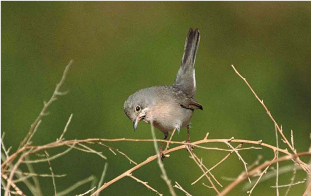
37 Ménétries's Warbler / Ménétries' Zwartkop Sylvia mystacea , Eilat, Israel, November 2001 (Killian Mullarney)