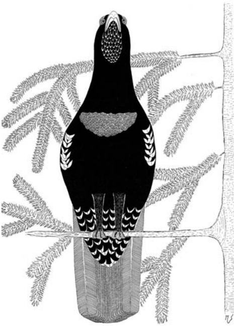
FIGURE 1 Western Capercaillie / Auerhoen Tetrao urogallus . Male displaying in strong wind and heavy rain with tail in resting position (Miroslav Saniga)