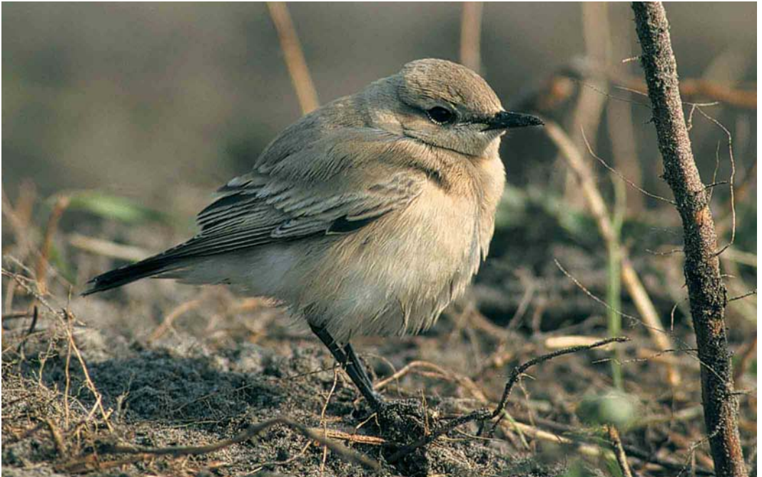
6 Izabeltapuit / Isabelline Wheatear Oenanthe isabellina , eerstejaars, Schiermonnikoog, Friesland, 16 oktober 2000

waarschuwen. Omdat het niet zo druk was met de vangsten ging AvL meteen kijken met één van de helpers, die gelukkig een telescoop bij zich had. Het licht was die middag vrij matig en de vogel kwam soms niet zo bleek over. Ook was er toen (vrijwel) geen wenkbrauwstreep te zien. Het duurde daarom even voordat de vogel de juiste kenmerken voor een Izabeltapuit liet zien, zoals de brede zwarte staartband en de lichte ondervleugel. Uiteindelijk groeide de overtuiging dat het allemaal klopte en werd de waarneming door MvdA via het semafoonsysteem bekendgemaakt.