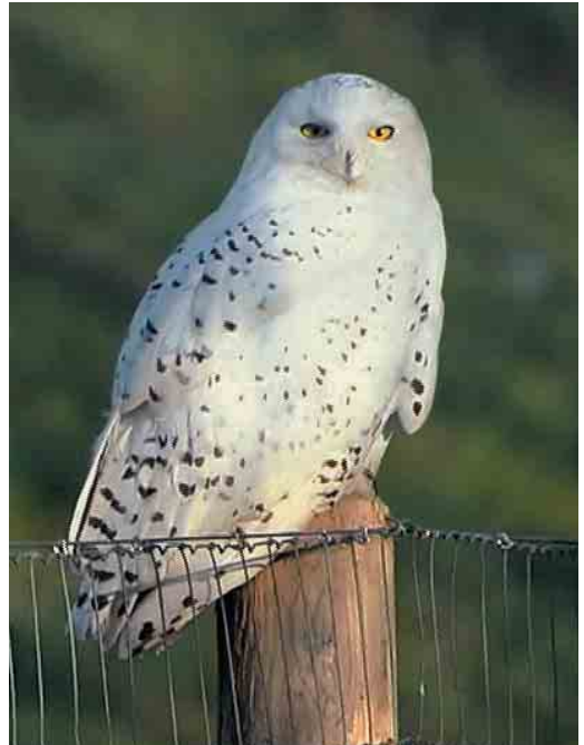
61 Sneeuwuil / Snowy Owl Nyctea scandiaca , adult mannetje, Meerssen, Limburg, 8 januari 2002

Keer op keer blijkt dat met name zeldzame roofvogels en uilen vatbaar zijn voor dit soort taferelen die gevoed worden door een mengsel van oprechte betrokkenheid van vogelaars, niet-vogelaars en opvangcentra, mogelijke belangen van voliërehouders van al dan niet legaal gehouden vogels, sensatiezucht bij de pers, onduidelijkheid of onwetendheid over wettelijke verantwoordelijkheden en 'claimgedrag' bij verschillende instanties. Voor een klein en voor leken en journalisten weinig aansprekend vogeltje als bijvoorbeeld de Pallas' Boszanger Phylloscopus proregulus van Zandvoort, Noord-Holland, meldde zich geen enkele 'beschermer' ... ENNO B EBELS & MAX BERLIJN