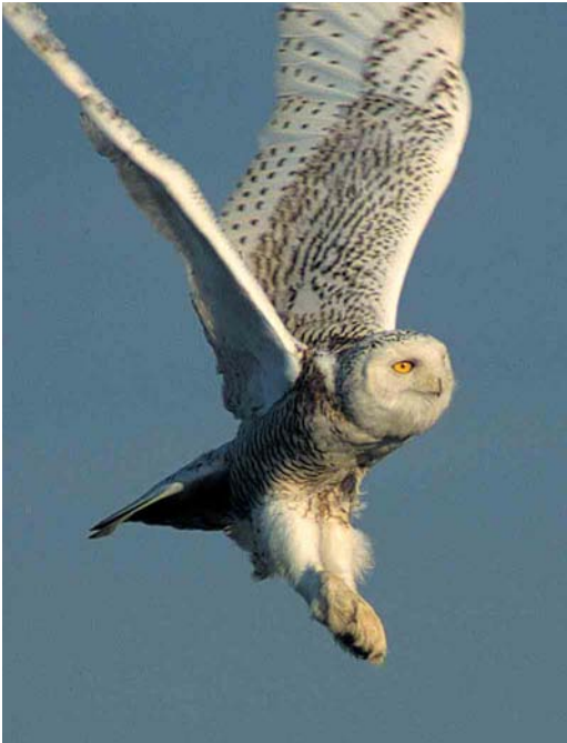
55 Sneeuwuil / Snowy Owl Nyctea scandiaca , Leffinge, West-Vlaanderen, 10 november 2001

8 november. Er volgde nog een waarneming te Oostende op 23 november.