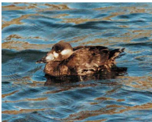
23 Red-wattled Lapwing / Indische Kievit Vanellus indicus , K19, Eilat, Israel, November 2001 ( Killian Mullarney ) 24 Great Cormorants / Aalscholvers Phalacrocorax carbo , Lagoa das Furnas, São Miguel, Azores, 2 November 2001 ( Kris De Rouck ) 25 Killdeer / Killdeerplevier Charadrius vociferus , Sete Cidades, São Miguel, Azores, 10 November 2001 ( Theo Bakker/Cursorius ) 26 Snowy Egret / Amerikaanse Zilverreiger Egretta thula , Porto Pim beach, Faial, Azores, 18 November 2001 ( Mark Bolton ) 27 American Coot / Amerikaanse Meerkoet Fulica americana , Lagoa Combes, Flores, Azores, 7 November 2001 ( Theo Bakker/Cursorius ) 28 Surf Scoter / Brilzee-eend Melanitta perspicillata , female, Porto Pim beach, Faial, Azores, 19 November 2001 ( Mark Bolton )