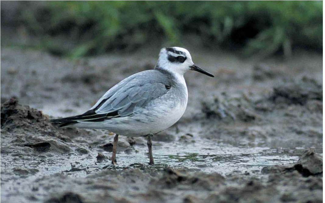
45 Rosse Franjepoot / Red Phalarope Phalaropus fulicaria , Zwaagwesteinde, Friesland, 10 november 2001