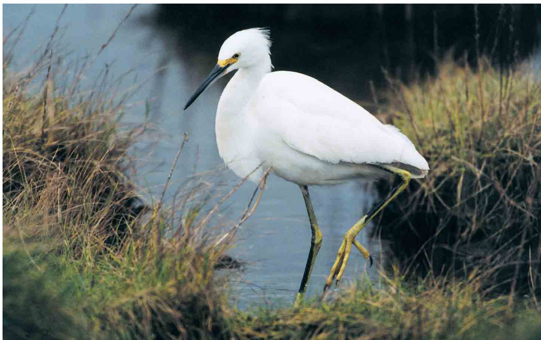
22 Snowy Egret / Amerikaanse Zilverreiger Egretta thula , juvenile, Balvicar, Seil Island, Argyll, Scotland, November 2001 (Iain H Leach)