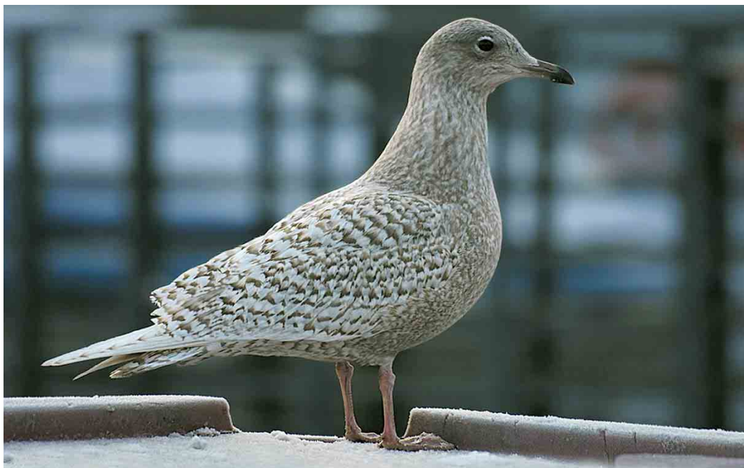
33 Iceland Gull / Kleine Burgemeester Larus glaucoides , first-winter, Huizen, Noord-Holland, Netherlands, 10 January 2001 (Phil Koken)