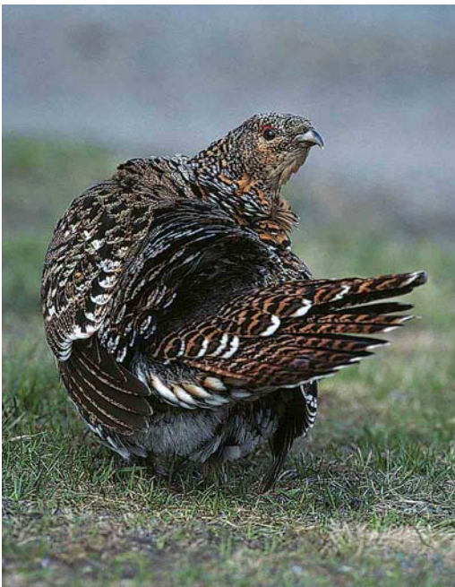
12 Western Capercaillie / Auerhoen Tetrao urogallus , female, Turo, Finland, April 1999

When the first females appear on the display ground, either in groups or solitary, the behaviour of the adjacent males changes to a directed display. The posture in this situation differs very little from a perfect Thin-necked Upright posture. The primaries of both wings, however, are spread and their tips touch the ground. The tail is almost completely fanned and cocked, and is usually tilted and turned towards the female (figure 7). Females on the ground are encircled by the male