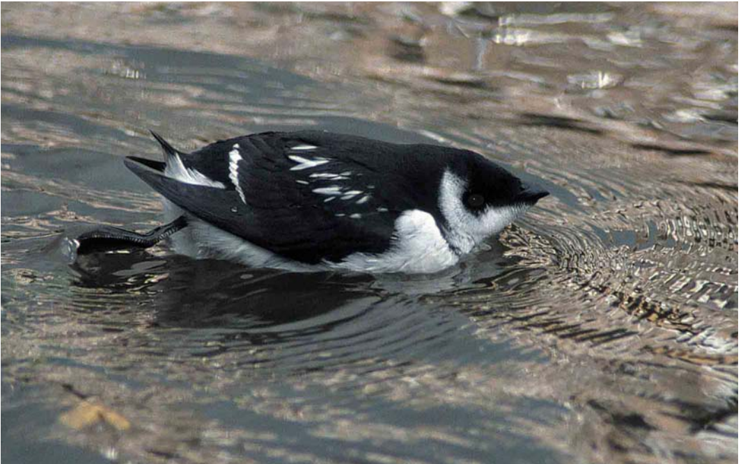
46 Kleine Alk / Little Auk Alle alle , Delft, Zuid-Holland, 8 november 2001 (Chris van Rijswijk)