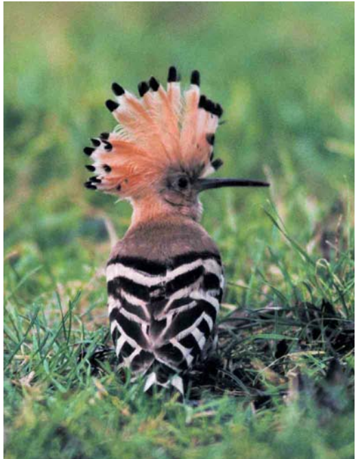
50 Pestvogel / Bohemian Waxwing Bombycilla garrulus , Julianadorp, Noord-Holland, 9 november 2001 51 Hop / Eurasian Hoopoe Upupa epops , Zwarte Haan, Friesland, 19 december 2001 52 Hop / Eurasian Hoopoe Upupa epops , Zwarte Haan, Friesland, 3 januari 2002