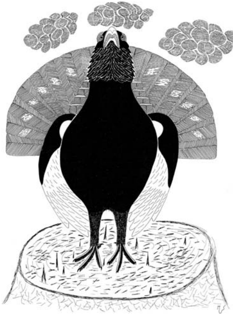
FIGURE 8 Western Capercaillie / Auerhoen Tetrao urogallus . Male during wide-necked postures against intruders in territory (Miroslav Saniga)

Towards the height of the season, and in response to certain stimuli (presence of females, activity of nearby males, weather conditions), after the initial pre-dawn period of arboreal singing, each male descends or flies into the display territory to continue Song-display on the ground. This usually occurs around the onset of the civil twilight (sun lower than 6^\circ below horizon) (Saniga 1998). Before performance on the ground, some males fly noisily from tree to tree,