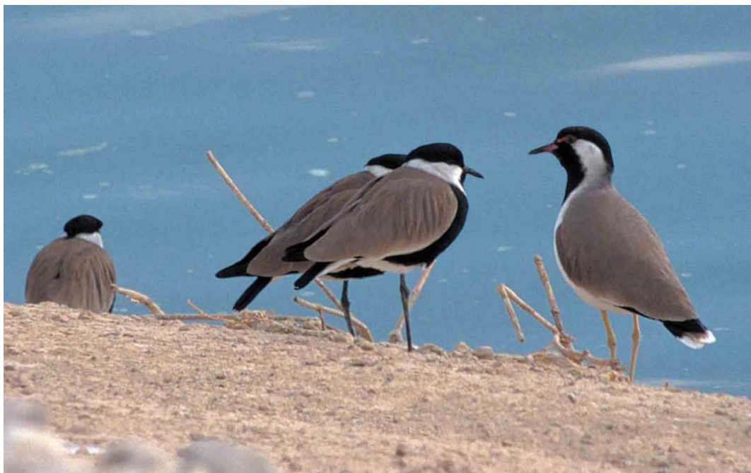
29 Red-wattled Lapwing / Indische Kievit Vanellus indicus with Spur-winged Lapwings V spinosus , K19, Eilat, Israel, November 2001 (Killian Mullarney)