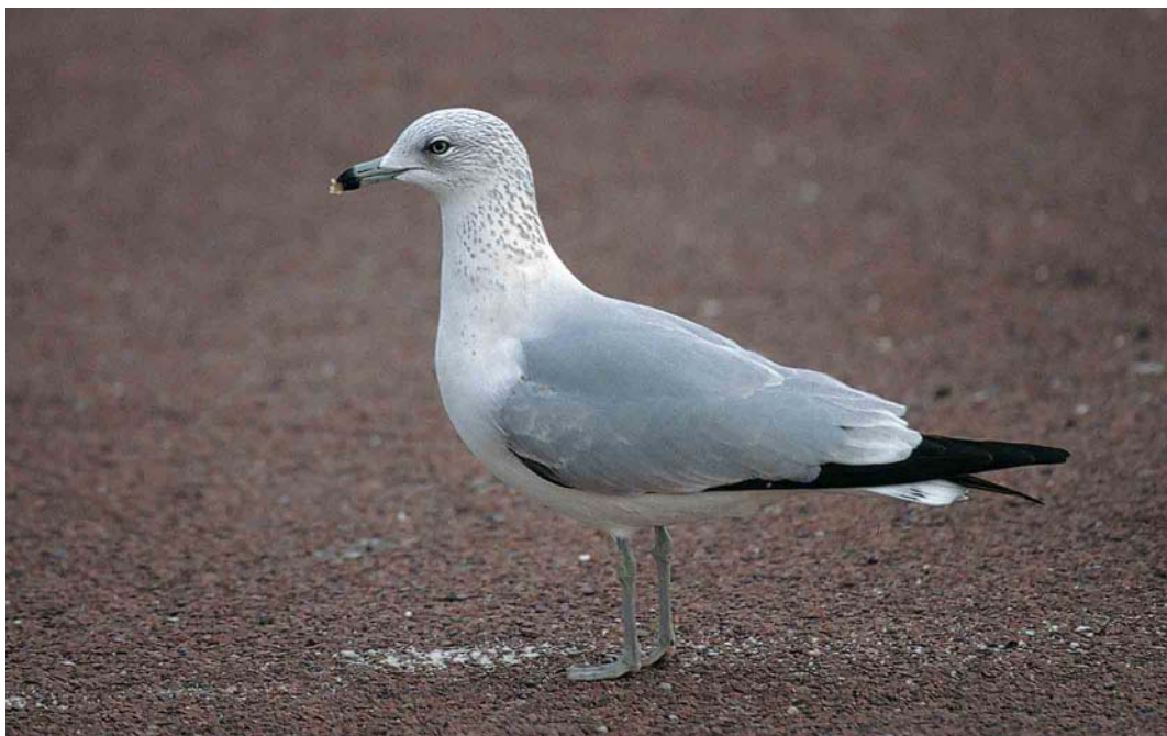
34 Ring-billed Gull / Ringsnavelmeeuw Larus delawarensis , second-winter, Arcachon, Gironde, France, 28 December 2001 (Frédéric Jiguet)