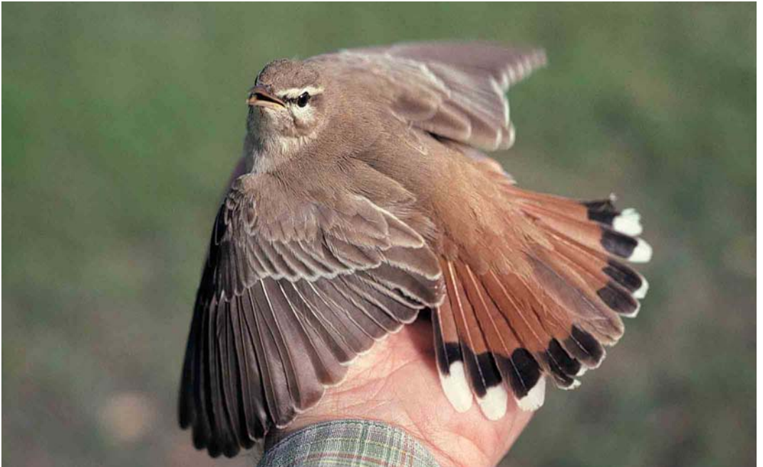
21 Eastern Rufous-tailed Scrub Robin / Oostelijke Rosse Waaierstaart Cercotrichas galactotes familiaris , Jubail, Gulf, Saudi Arabia, 19 April 1991 (Arnoud B van den Berg). Note pale grey-brown upperparts, broad black subterminal tail-band and contrastingly darker central pair of tail-feathers