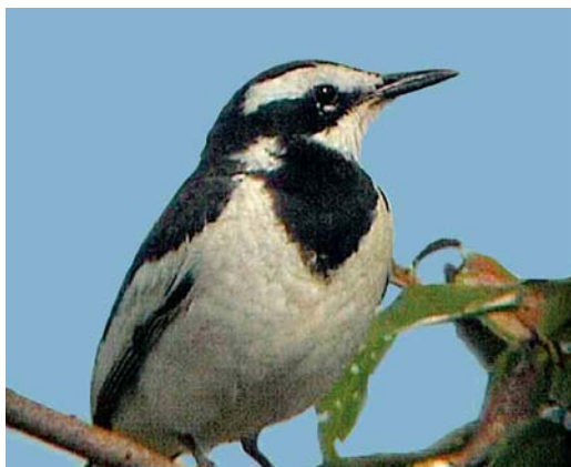
57 Mekong Wagtail / Mekongkwikstaart Motacilla samveasnae , male, Stung Treng Province, Cambodia, February 2001 (Per Alström)