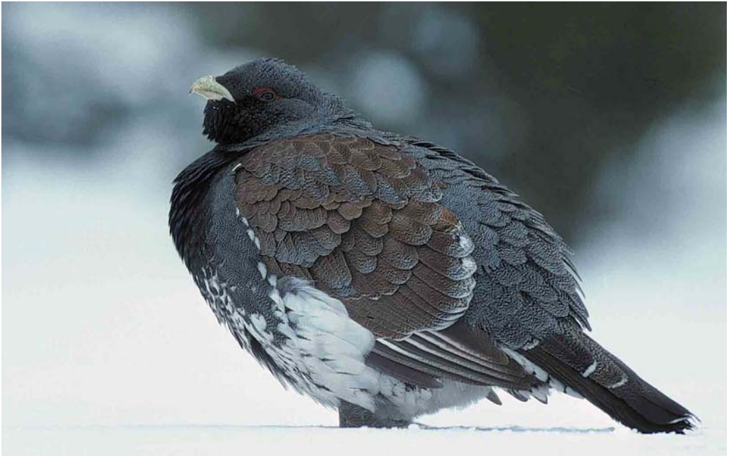
11 Western Capercaillie / Auerhoen Tetrao urogallus , male, Turo, Finland, March 1996 (Henry Letho)