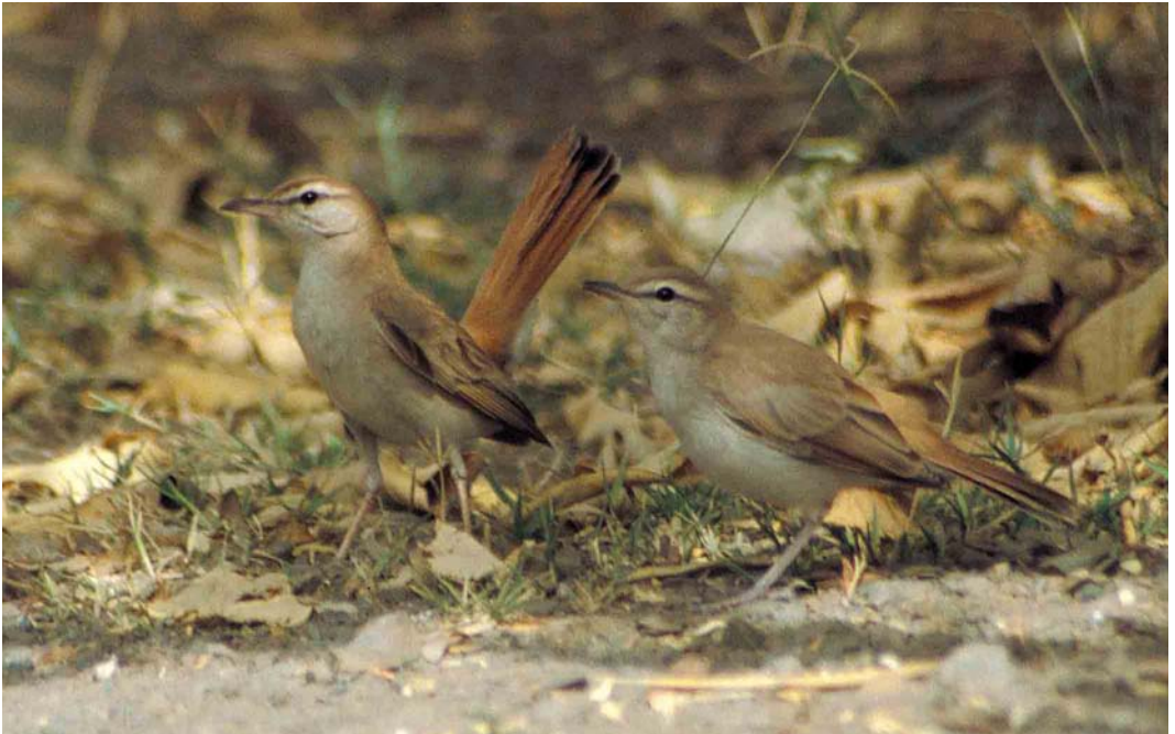
14 Western Rufous-tailed Scrub Robins / Westelijke Rosse Waaiertaarten Cercotrichas galactotes galactotes , juvenile (right) and adult, Marrakech, Morocco, July 2001 (Martijn Verdoes)

XII This year's last mystery photograph depicts a small songbird. The bird looks rather featureless, thereby offering little clue for identification. The head pattern is rather diffuse yet shows a long