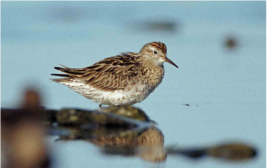
31 Sharp-tailed Sandpiper / Siberische Strandloper Calidris acuminata , adult summer moulting to winter plumage, Saaremaa Tammunaneem, Estonia, 31 August 2001