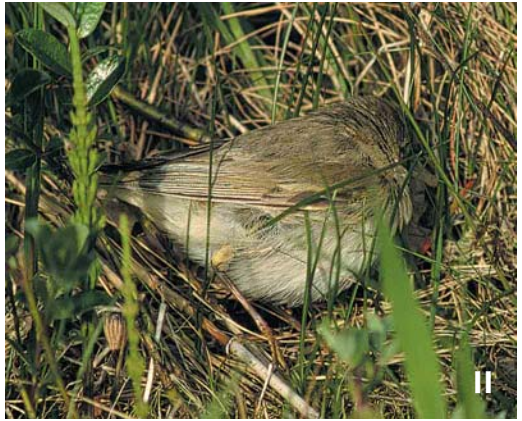
Mystery photograph II (May)