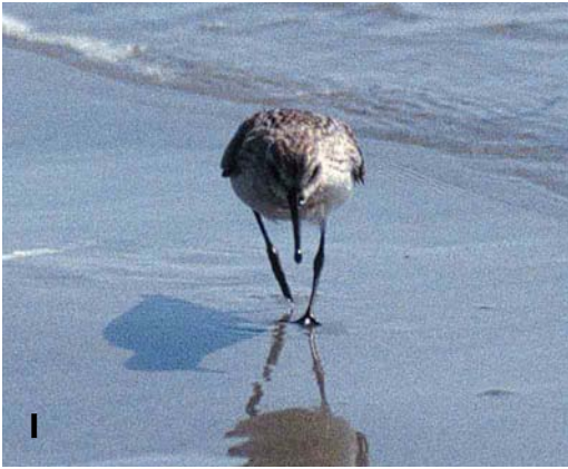
Mystery photograph I (August)