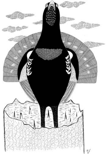
FIGURE 6 Western Capercaillie / Auerhoen Tetrao urogallus . Male during performance of Whetting phase of song (frontal view) (Miroslav Saniga)