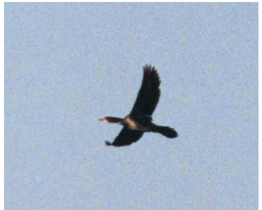
1-2 Pygmy Cormorant / Dwergaalscholver Microcarbo pygmeus , Warneton, Hainaut, 30 December 2000 (Han Remaut) 3-4 Pygmy Cormorant / Dwergaalscholver Microcarbo pygmeus , Warneton, Hainaut, 28 December 2000 (Christophe Capelle)

on outer web than on inner web. Secondaries brownish. Upperwing-coverts and underwing-coverts more blackish and darker than flight-feathers.