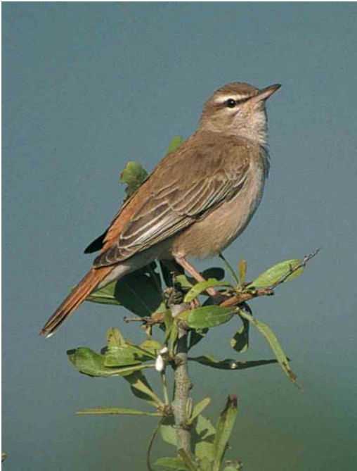
18 Eastern Rufous-tailed Scrub Robin / Oostelijke Rosse Waaierstaart Cercotrichas galactotes syriacus , Lesbos, Greece, 8 May 2001. Same bird as on this issue's cover. More difficult bird with (in this photograph) relatively dark upperparts with weak rufous tinge. Note, however, tail pattern with broad dark subterminal markings en darker central tail-feathers