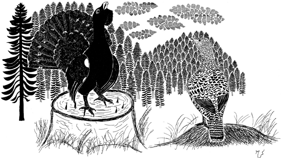
FIGURE 9 Western Capercaillie / Auerhoen Tetrao urogallus . Male courting hen on ground (Miroslav Saniga)