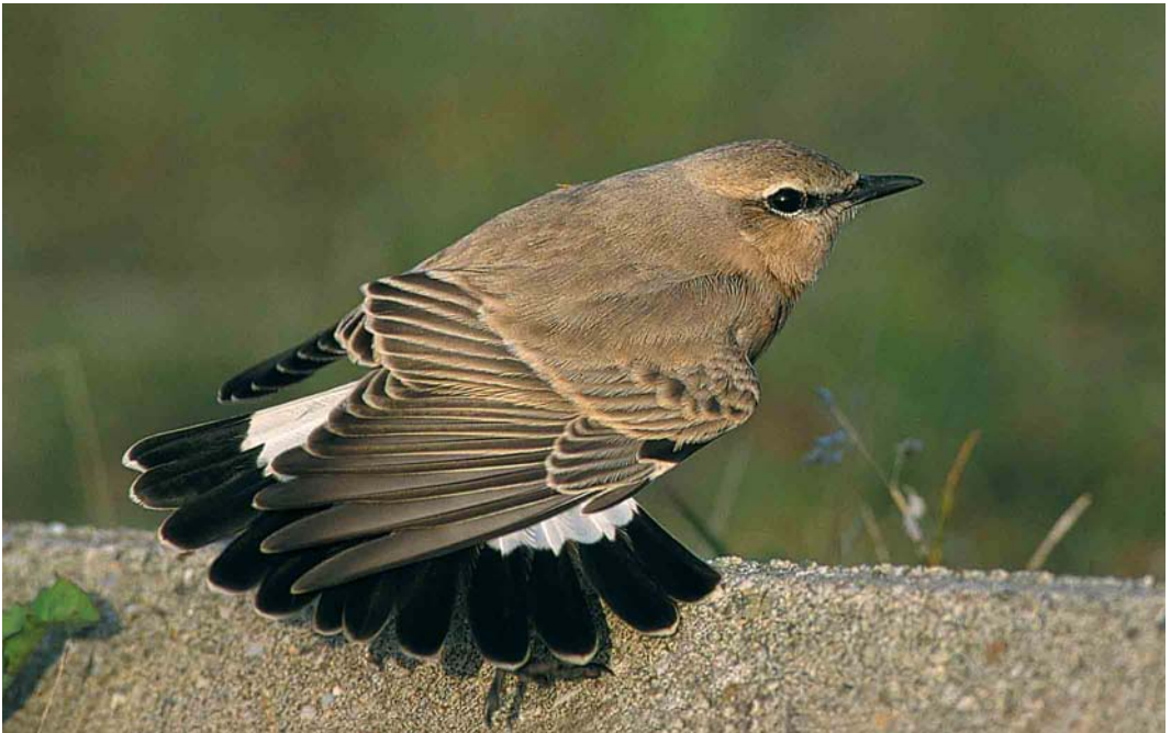
5 Izabeltapuit / Isabelline Wheater Oenanthe isabellina , IJmuiden, Noord-Holland, 23 september 2000

GEDRAG Beide dagen verblijvend op schaars begroeide parkeerplaats met veel paaltjes en stenen. Foeragerend op grond, daarbij soms grote afstanden rennend. Regelmatig op platte steen van 10 cm hoog zittend en dan rondkijkend. Ook vaak op 1 m hoge paal zittend. Dan soms tot 5 m hoog opvliegend om insect te vangen. Niet schuw, waarnemers regelmatig tot 3 m afstand benaderend. Solitair. Joeg Tapuiten weg.