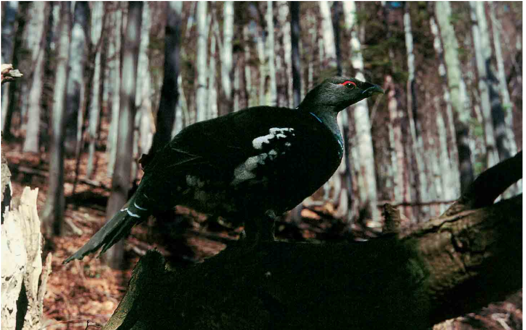
8 Western Capercaillie / Auerhoen Tetrao urogallus , male after morning display on broken tree, Vel'ká Fatra mountains, Slovakia, 20 April 1996 (Miroslav Saniga)