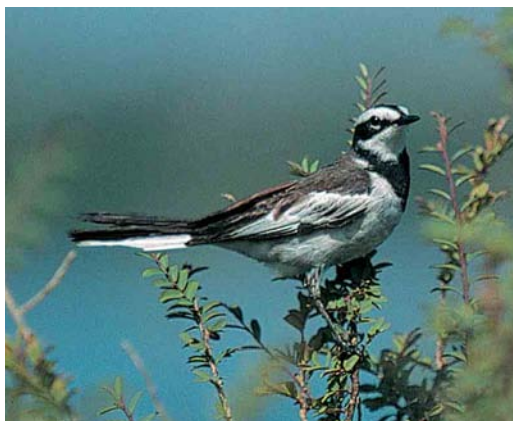
58 Mekong Wagtail / Mekongkwikstaart Motacilla samveasnae , female, Stung Treng Province, Cambodia, February 2001

the many proposed projects for the construction of dams in the lower Mekong area could conceivably quickly alter the fate for existing populations. Moreover, since the area of its known world range is extremely small (and, within this range, it is confined to river banks), the species may best be considered 'near-threatened' following the IUCN (1994) red list criteria for threatened species. This status could change to 'vulnerable' if a dam project in a key stretch of river within the breeding range is developed. ENNO B EBELS