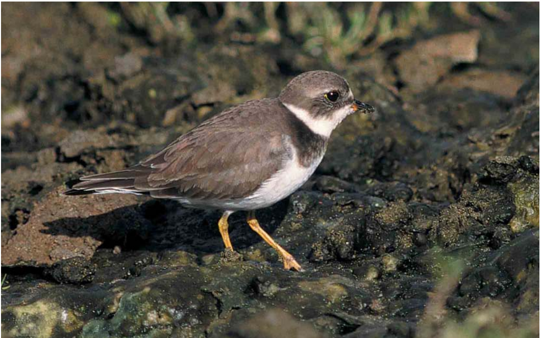
32 Semipalmated Plover / Amerikaanse Bontbekplevier Charadrius semipalmatus , Cabo da Praia, Terceira, Azores, 14 November 2001