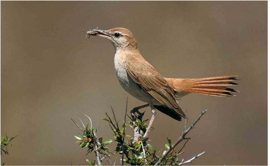
20 Western Rufous-tailed Scrub Robin / Westelijke Rosse Waaierstaart Cercotrichas galactotes galactotes , Fortes, Algarve, Portugal, 1 August 1999. Worn bird, more similar to eastern subspecies group due to rather pale and less rufous-tinged upperparts and whitish underparts. Note, however, lack of darker central tail-feathers