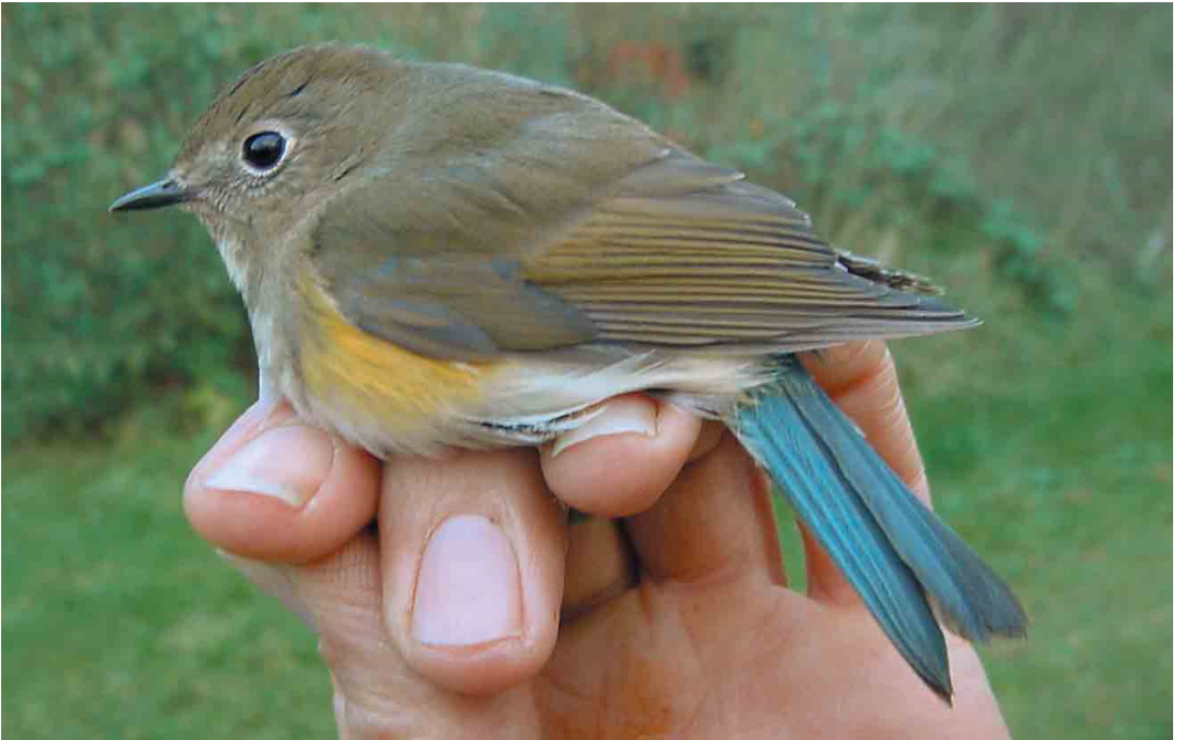
47 Blauwstaart / Red-flanked Bluetail Tarsiger cyanurus , eerste-winter, Schiermonnikoog, Friesland, 5 november 2001 ( Henri Bouwmeester ) 48 Kleine Alk / Little Auk Alle alle , IJmuiden, Noord-Holland, 2 november 2001 ( Han Zevenhuizen ) 49 Dwerggans / Lesser White-fronted Goose Anser erythropus , adult (rechts), Strijen, Zuid-Holland, 16 november 2001 ( Marten van Dijl )