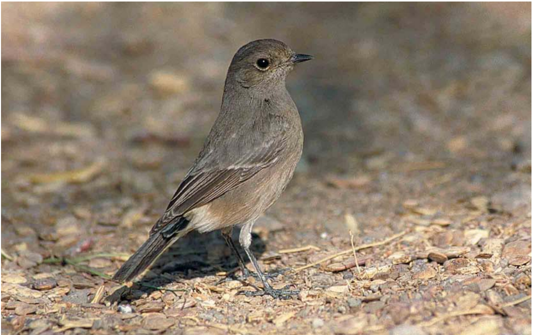
38 Pied Bushchat / Zwarte Roodborsttapuit Saxicola caprata , first-winter female, Eilat, Israel, November 2001