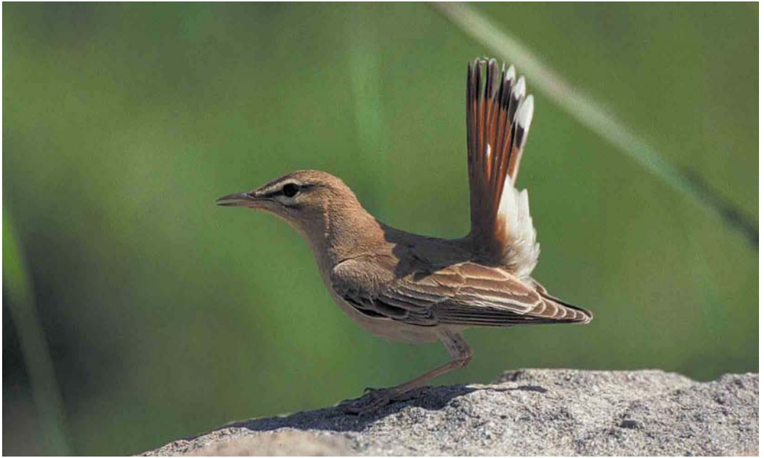
15 Eastern Rufous-tailed Scrub Robin / Oostelijke Rosse Waaiertaart Cercotrichas galactotes syriacus , Lesbos, Greece, April 1996. Note grey-brown upperpart coloration, but not as pale and greyish as birds of more eastern part of range of eastern subspecies group ( C g familiaris ) 16 Western Rufous-tailed Scrub Robin / Westelijke Rosse Waaiertaart Cercotrichas galactotes galactotes , Algarve, Portugal, 9 June 1998. Typical rufous-brown upperparts contrasting slightly with bright rufous tail. Also note tail pattern without darker central tail-feathers