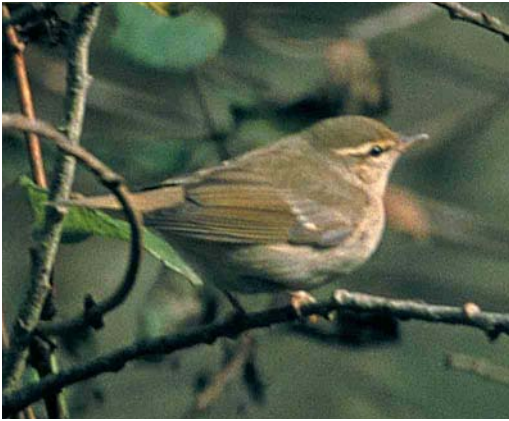
39 Arctic Warbler / Noordse Boszanger Phylloscopus borealis , Ouessant, Finistère, France, October 2001 cf Dutch Birding 23: 366, 2001

ing 900 000 were shot. A longevity record was established by a Mistle Thrush T viscivorus ringed in Switzerland on 21 September 1978 and shot in Spain on 19 December 1999, reaching an age of at least 21 years and four months (Ornithol Beob 98: 349-350, 2001).