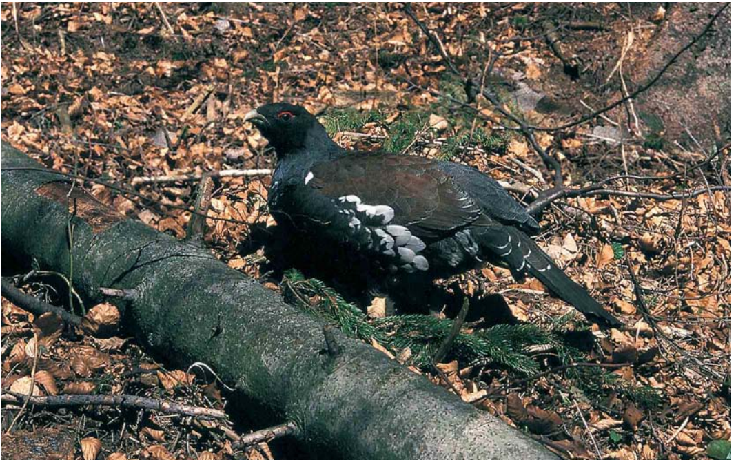
9 Western Capercaillie / Auerhoen Tetrao urogallus , male after morning display on the ground, Vel'ká Fatra mountains, Slovakia, 20 April 1996