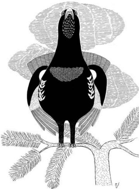
FIGURE 4 Western Capercaillie / Auerhoen Tetrao urogallus . Male during performance of Cork-pop note of song (Miroslav Saniga)