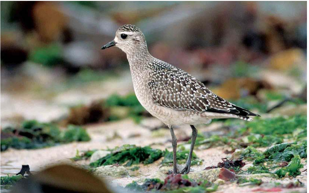
329 American Golden Plover / Amerikaanse Goudplevier Pluvialis dominica , Ouessant, Finistère, France, 9 October 2002 (Arie Ouwerkerk)