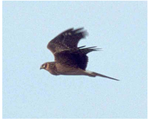
289 Greater Spotted Eagle / Bastaardarend Aquila clanga , juvenile, Alphen aan den Rijn, Zuid-Holland, 24 January 2001 290 Greater Spotted Eagle / Bastaardarend Aquila clanga , juvenile, Itteren, Limburg, 19 October 2001 291 Booted Eagle / Dwergarend Hieraaetus pennatus , Groene Pollen, Terschelling, Friesland, juvenile, pale morph, 30 September 2001 292 Pallid Harrier / Steppekiekendief Circus macrourus , juvenile, Langevelderslag, Zuid-Holland, 20 oktober 2001