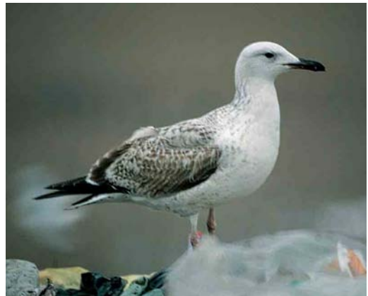
315 Pontic Gull / Pontische Meeuw Larus cachinnans cachinnans , adult, Konin, central Poland, January 2002 (Marcin Faber) 316 Pontic Gull / Pontische Meeuw Larus cachinnans cachinnans , adult, Konin, central Poland, December 2001 (Marcin Faber) 317 Pontic Gull / Pontische Meeuw Larus cachinnans cachinnans , adult, Konin, central Poland, January 2002 (Marcin Faber) 318 Pontic Gull / Pontische Meeuw Larus cachinnans cachinnans , first-winter, Toruń, Poland, February/March 2001 (Grzegorz Neubauer)

Herring and 28% in Pontic Gulls. Birds in older immature plumages (second-winter and third-winter) of both species were rarer (figure 2).