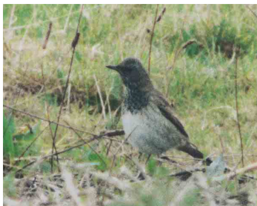
343 Daurian Shrike / Daurische Klauwier Lanius isabellinus , St Mary's, Scilly, England, October 2002 (Steve Young/Birdwatch) 344 Two-barred Crossbill / Witbandkruisbek Loxia leucoptera bifasciata , adult male, Orrevatnet, Jæren, Rogaland, Norway, 1 October 2002 (Sietze Bernardus) 345 Red-flanked Bluetail / Blauwstaart Tarsiger cyanurus , first-winter, Blériot-Plage, Pas-de-Calais, France, 23 October 2002 (Roger Tonnel) 346 Red-flanked Bluetail / Blauwstaart Tarsiger cyanurus , first-winter, Helgoland, Schleswig-Holstein, Germany, 18 September 2002 (Jochen Dierschke) 347 Eastern Crowned Warbler / Oostelijke Kroonzanger Phylloscopus coronatus , Jæren, Rogaland, Norway, 30 September 2002 (Fredrik Kræmer) 348 Black-throated Thrush / Zwartkeellijster Turdus rufo-collis atrogularis , Tresco, Scilly, England, October 2002 (Steve Young/Birdwatch)