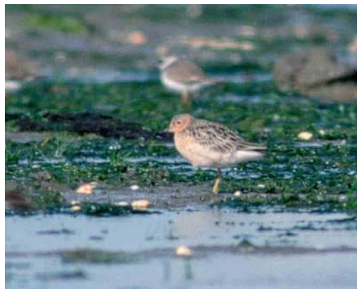
293 Greater Sand Plover / Woestijnplevier Charadrius leschenaultii , second calendar-year female, Oostvaardersdijk, Almere, Flevoland, 26 June 2001 ( Jan van Holten ) 294 Black-winged Pratincole / Steppenvorkstaartplevier Glareola nordmanni , first-winter, Den Hoorn, Texel, Noord-Holland, 19 August 2001 ( Erik Menkveld ) 295 Pacific Golden Plover / Aziatische Goudplevier Pluvialis fulva , adult summer, Oosterend, Terschelling , Friesland, 22 July 2001 ( Arie Ouwerkerk ) 296 Buff-breasted Sandpiper / Blonde Ruitr Tryngites subruficollis , adult, Eemshaven, Groningen, 10 August 2001 ( Eric Koops )