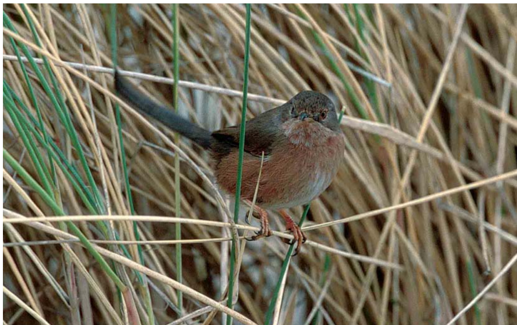
304 Dartford Warbler / Provençaaalse Grasmus Sylvia undata , first-summer, Maasvlakte, Zuid-Holland, 25 March 2001