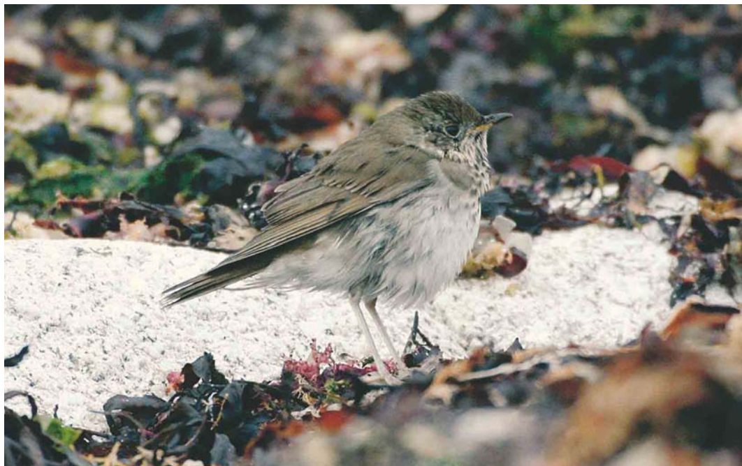
342 Grey-cheeked Thrush / Grijswangdwerglijster Catharus minimus , St Agnes, Scilly, England, 30 October 2002 (Chris Batty)