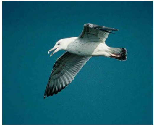
319 Herring Gull / Zilvermeeuw Larus argentatus , first-winter, Konin, central Poland, December 2001 ( Marcin Faber ) 320 Pontic Gull / Pontische Meeuw Larus cachinnans cachinnans , first-winter, Poznań, Poland, February 2001 ( Grzegorz Neubauer ). This bird was ringed in May 2000 as a pullus on the Dnjepr river, central Ukraine (see table 2) 321 Pontic Gull / Pontische Meeuw Larus cachinnans cachinnans , first-winter, Toruń, Poland, February 2001 ( Grzegorz Neubauer ). This bird (different from that in plate 320) was ringed in the same place and on the same day (see table 2) 322 Pontic Gull / Pontische Meeuw Larus cachinnans cachinnans , second-winter, Jeziorsko Reservoir, central Poland, December 2001 ( Marcin Faber )