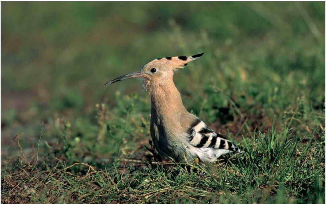
356 Hop / Eurasian Hoopoe Upupa epops , De Cocksdorp, Texel, Noord-Holland, 8 oktober 2002 (Jan van Holten)