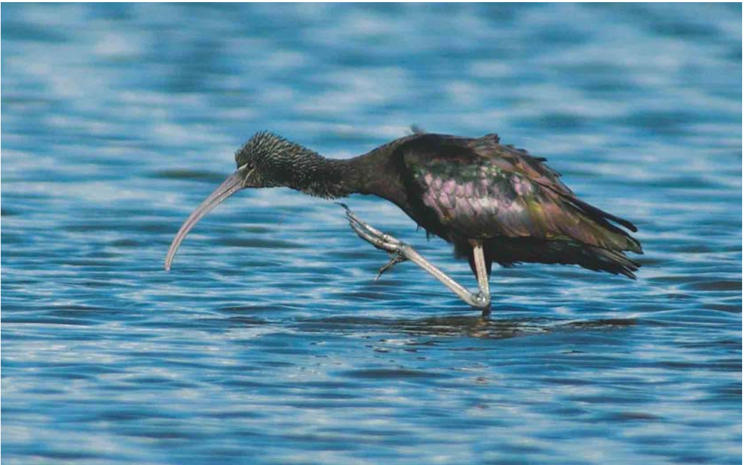
354 Zwarte Ibis / Glossy Ibis Plegadis falcinellus , adult, Julianadorp, Noord-Holland, september 2002