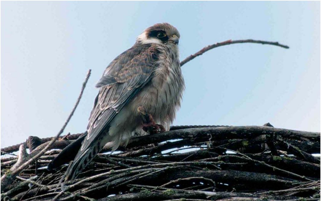
355 Roodpootvalk / Red-footed Falcon Falco vespertinus , juveniel, Lauwersmeer, Groningen, 23 september 2002 (Eric Koops)