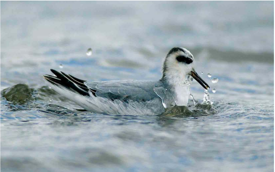
351 Rosse Franjepoot / Red Phalarope Phalaropus fulicaria , eerstejaars, Amstelmeerdijk, Noord-Holland, 23 oktober 2002