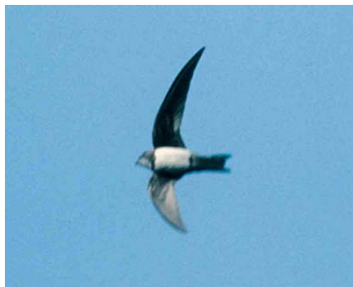
377 Alpengierzwaluw / Alpine Swift Apus melba, Wageningen, Gelderland, 12 november 2002