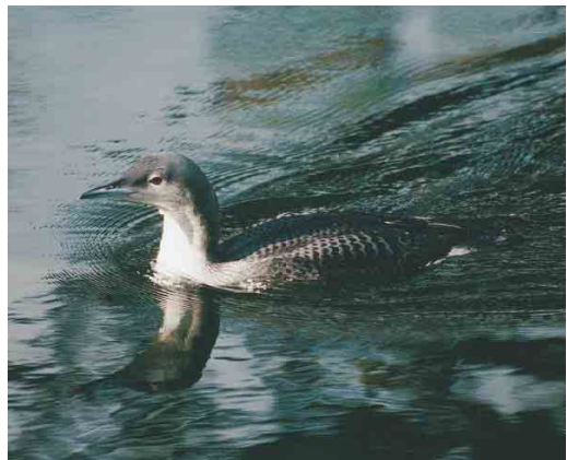
361 Bastaardarend / Greater Spotted Eagle Aquila clanga , onvolwassen, Oostvaardersplassen, Flevoland, 15 september 2002 362 Alpengierzwaluw / Alpine Swift Apus melba , Terschelling, Friesland, 20 september 2002 363 Gestreepte Strandloper / Pectoral Sandpiper Calidris melanotos , juveniel, Callantsoog, Noord-Holland, 15 september 2002 364 Grote Franjepoot / Wilson's Phalarope Phalaropus tricolor , eerstejaars, 't Zand, Noord-Holland, 15 september 2002 365 Pontische Meeuw / Pontic Gull Larus cachinnans cachinnans , eerste-winter, Noordzee nabij Schiermonnikoog, Friesland, 21 september 2002 366 Parelduiker / Black-throated Loon Gavia arctica , juveniel, Raalte, Gelderland, 24 oktober 2002