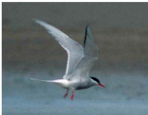
323 Arctic Tern / Noordse Stern Sterna paradisaea , adult summer, with African Skimmer / Afrikaanse Schaarbek Rynchops flavirostris and Lesser Crested Terns / Bengaalse Sterns S bengalensis , Sabaki river mouth, Kenya, 6 July 2002 (Jan Bisschop) 324 Arctic Tern / Noordse Stern Sterna paradisaea , adult summer, Sabaki river mouth, Kenya, 6 July 2002 (Jan Bisschop)

Tawila Island, Red Sea, Egypt (Shirihai 1999). Furthermore, in the north-eastern Indian Ocean region, Arctic Tern has reportedly been seen in Oman (Porter et al 1996) and there is one inland sighting from Kashmir, India (Grimmett et al 1998). The 21 records at Eilat, Israel (Shirihai 1996), may also be relevant in this context, because these birds are likely to have arrived there from the Indian Ocean. Up to now, Arctic Tern has not been reported from Tanzania, Madagascar, Seychelles or the Comoro archipelago.