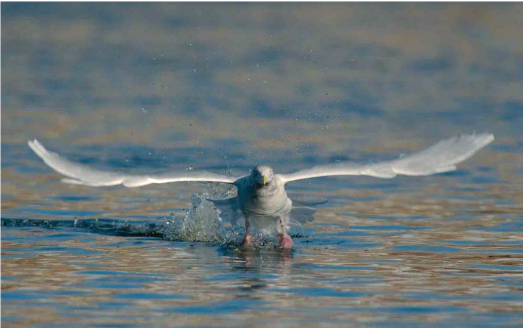
352 Grote Burgemeester / Glaucous Gull Larus hyperboreus , adult, Den Helder, Noord-Holland, 24 oktober 2002