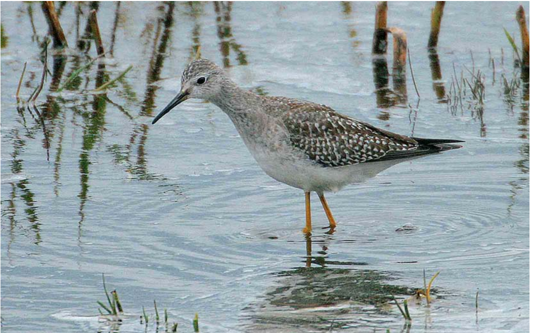
353 Kleine Geelpootruiter / Lesser Yellowlegs Tringa flavipes , juveniel, Amstelmeerdijk, Noord-Holland, 15 oktober 2002 (Jan Smit)