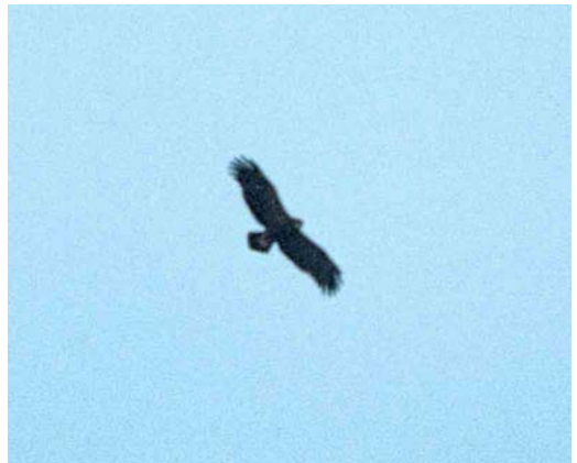
371 Schreeuwarend / Lesser Spotted Eagle Aquila pomarina , juveniel, Grimbergen, Vlaams-Brabant, 12 september 2002 (Axel Smets)

WOUWEN TOT ALKEN Een Zwarte Wouw Milvus migrans trok op 16 september over Westkapelle, West-Vlaanderen. Op 24 september trok een Rode Wouw M. milvus over Brecht en op 29 september één over Uitkerke. Op 5 en 9 oktober trok er telkens één over Knokke; op 9 oktober werden er overtrekkende Rode Wouwen gezien te Galmaarden; Genk, Kalmthout; Leuven, Vlaams-Brabant (vier); Limburg; Mechelen (zes); Oostmalle; en Sint-Denijs, Oost-Vlaanderen (twee); op 10 oktober over Muizen, Antwerpen; op 11 oktober telkens één over Brecht, Kalmthout, en Rillaar, Antwerpen; en op 12 oktober over Broechem,