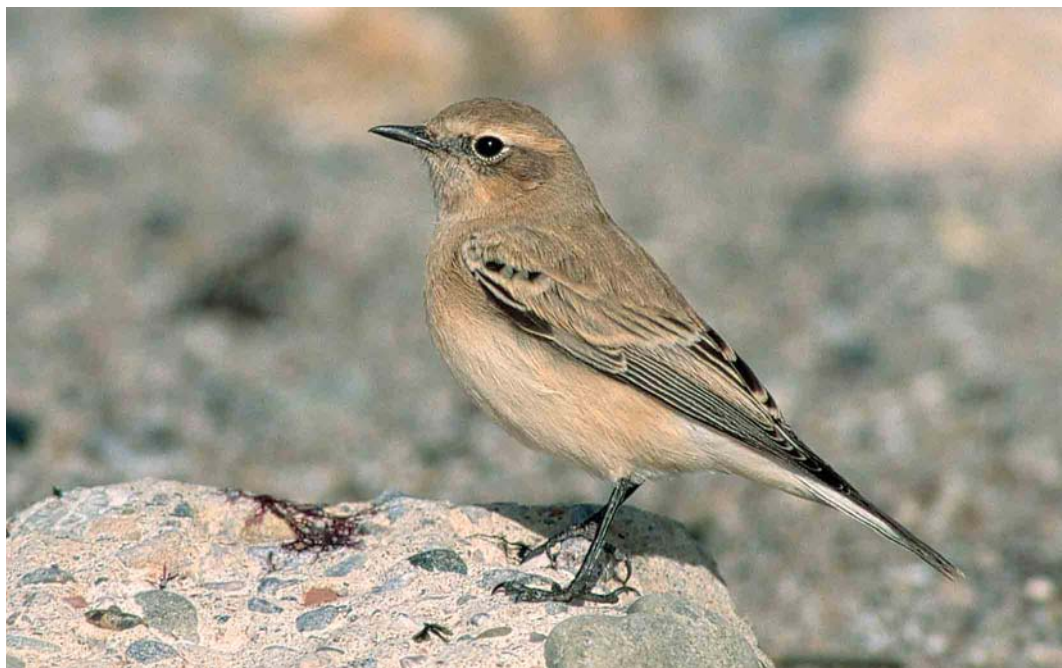
341 Black-eared wheatear / blonde tapuit Oenanthe hispanica/melanoleuca , Helgoland, Schleswig-Holstein, Germany, 6 October 2002 (Roef Mulder)