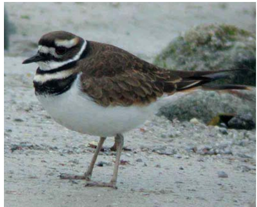
334 Hudsonian Whimbrel / Amerikaanse Regenwulp Numenius hudsonicus , Cabo da Praia, Terceira, Azores, 9 October 2002 (Leo J R Boon/Cursorius) 335 Baird's Sandpiper / Bairds Strandloper Calidris bairdii , juvenile, Cabo da Praia, Terceira, Azores, 15 October 2002 (Leo J R Boon/Cursorius) 336 Buff-breasted Sandpiper / Blonde Ruitter Tryngites subruficollis , juvenile, Lista, Norway, 26 September 2002 (Sietze Bernardus) 337 Killdeer / Killdeerplevier Charadrius vociferus , St Agnes, Scilly, November 2002 (Chris Batty)

site on 20-29 October). In Israel, a record 14 000 Red-footed Falcons Falco vespertinus were counted in the northern valleys this autumn, with a high of 7400 on 30 September. The first Barbary Falcon F. pelegrinoides for Malta since 1865 was at Buskett on 15 October.