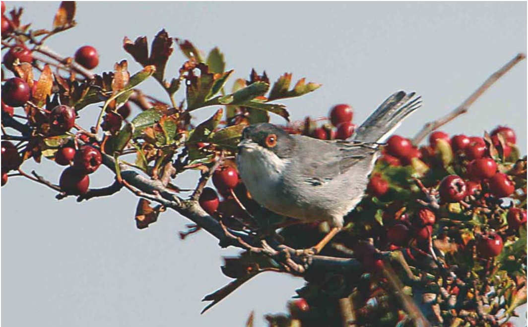
349 Sardinian Warbler / Kleine Zwartkop Sylvia melanocephala , male, Old Hunstanton, Norfolk, England, 5 October 2002