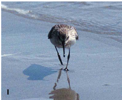
Mystery photograph I (August)