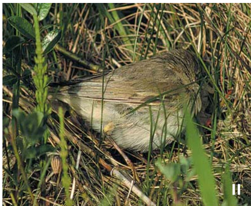
Mystery photograph II (May)