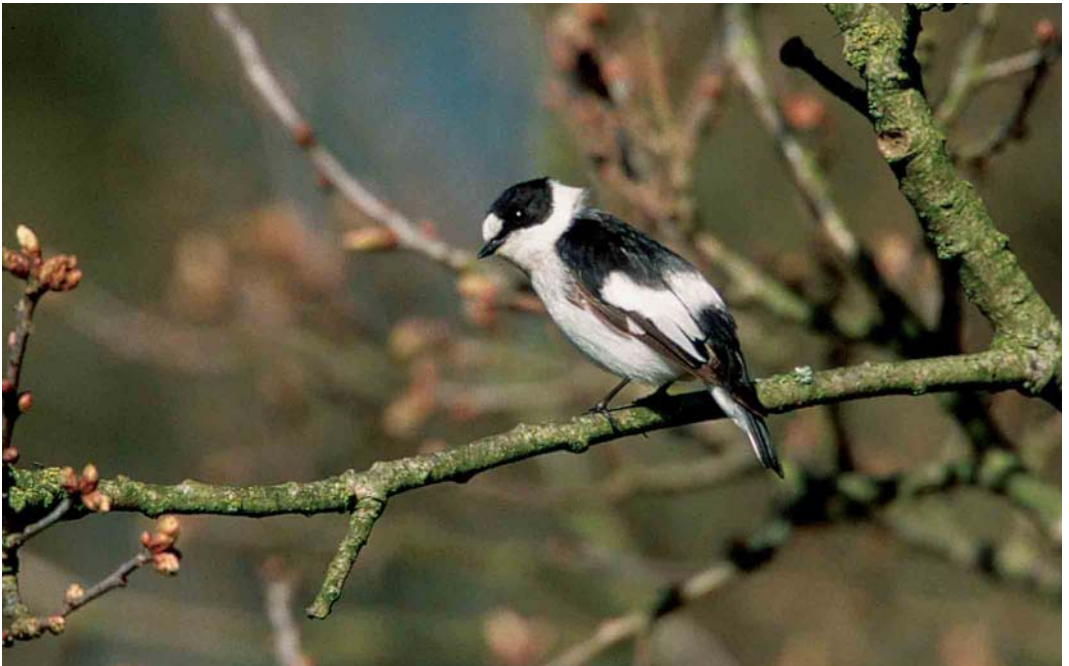
313 Collared Flycatcher / Withalsvliegenvanger Ficedula albicollis , first-summer male, Lies, Terschelling, Friesland, 7 May 2001 (Arie Ouwerkerk)