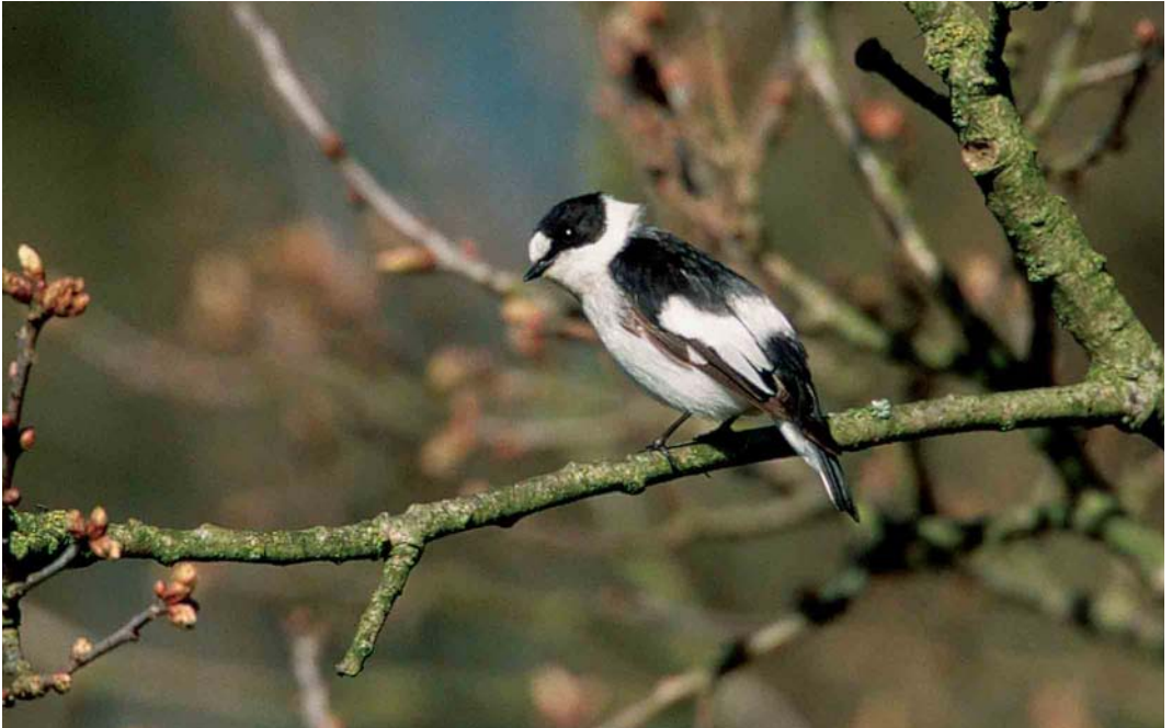
313 Collared Flycatcher / Withalsvliegenvanger Ficedula albicollis , first-summer male, Lies, Terschelling, Friesland, 7 May 2001