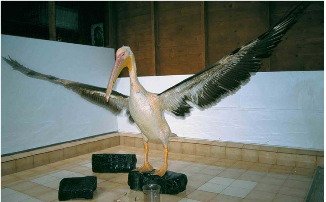
285 Great White Pelican / Roze Pelikaan Pelecanus onocrotalus , first-summer (taken into care at Oil Platform K-18 Kotter, Continental Shelf, on 28 May 2001), Den Helder, Noord-Holland, 2 June 2001