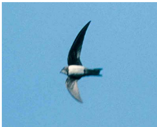
377 Alpengierzwaluw / Alpine Swift Apus melba , Wageningen, Gelderland, 12 november 2002

Pleisterende Alpengierzwaluw in Wageningen Op zondag 10 november 2002 zag Robert Keizer kortstondig een Alpengierzwaluw Apus melba vliegen boven Plantage Willem III aan de oostkant van Elst, Utrecht. Op maandag 11 november werd naar mag worden aangenomen dezelfde Alpengierzwaluw rond 09:00 gezien boven de wijk Noordwest in Wageningen, Gelderland. Daarna zagen Herman van Oosten en Marijn Salverda hem rond 11:30 boven de Rijnhaven