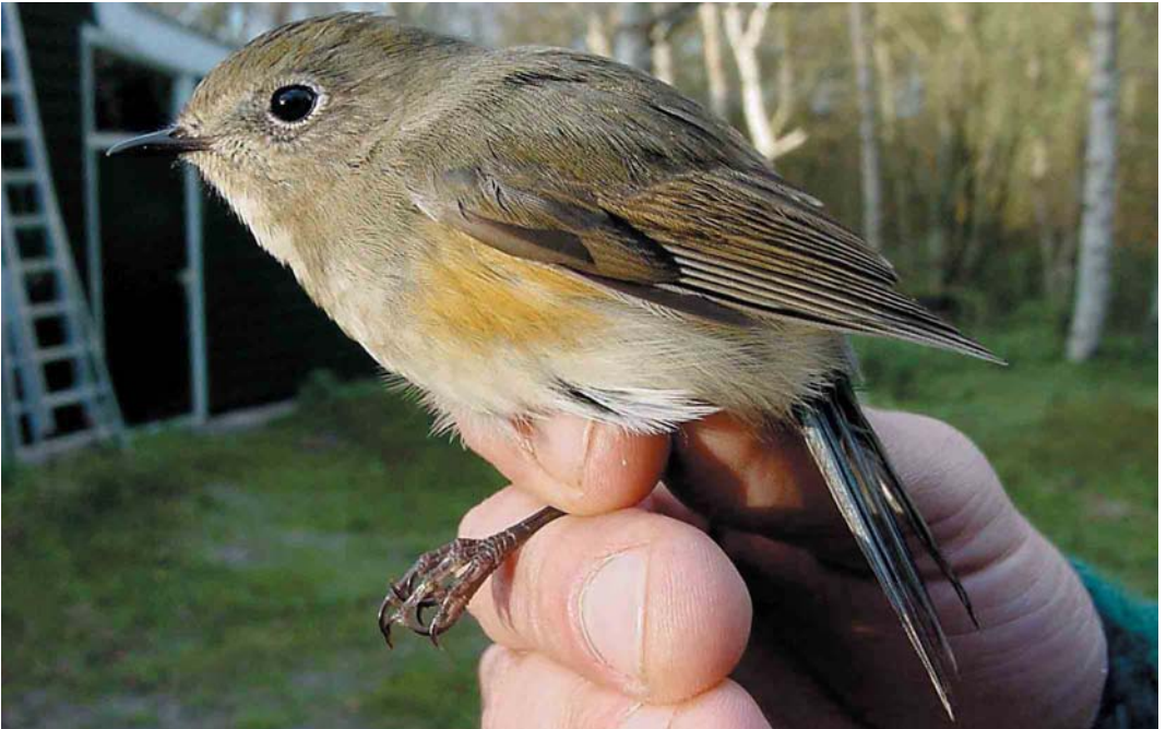
301 Red-flanked Bluetail / Blauwstaart Tarsiger cyanurus , first-winter female, Schiermonnikoog, Friesland, 5 November 2001 302 Desert Wheatear / Woestijntapuit Oenanthe deserti , first-winter male, Eemshaven, Groningen, 13 October 2001 303 Eyebrowed Thrush / Vale Lijster Turdus obscurus , first-winter, Oranjezon, Zeeland, 25 September 2001