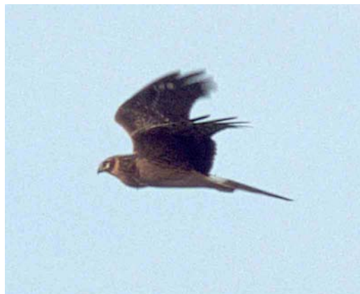
289 Greater Spotted Eagle / Bastaardarend Aquila clanga , juvenile, Alphen aan den Rijn, Zuid-Holland, 24 January 2001 290 Greater Spotted Eagle / Bastaardarend Aquila clanga , juvenile, Itteren, Limburg, 19 October 2001 291 Booted Eagle / Dwergarend Hieraaetus pennatus , Groene Pollen, Terschelling, Friesland, juvenile, pale morph, 30 September 2001 292 Pallid Harrier / Steppekiekendief Circus macrourus , juvenile, Langevelderslag, Zuid-Holland, 20 oktober 2001