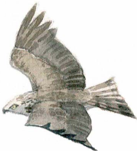
FIGURE 1 Short-toed Eagle / Slangenarend Circetus gallicus, Fochteloöerveen, Drenthe/Friesland, June 2001