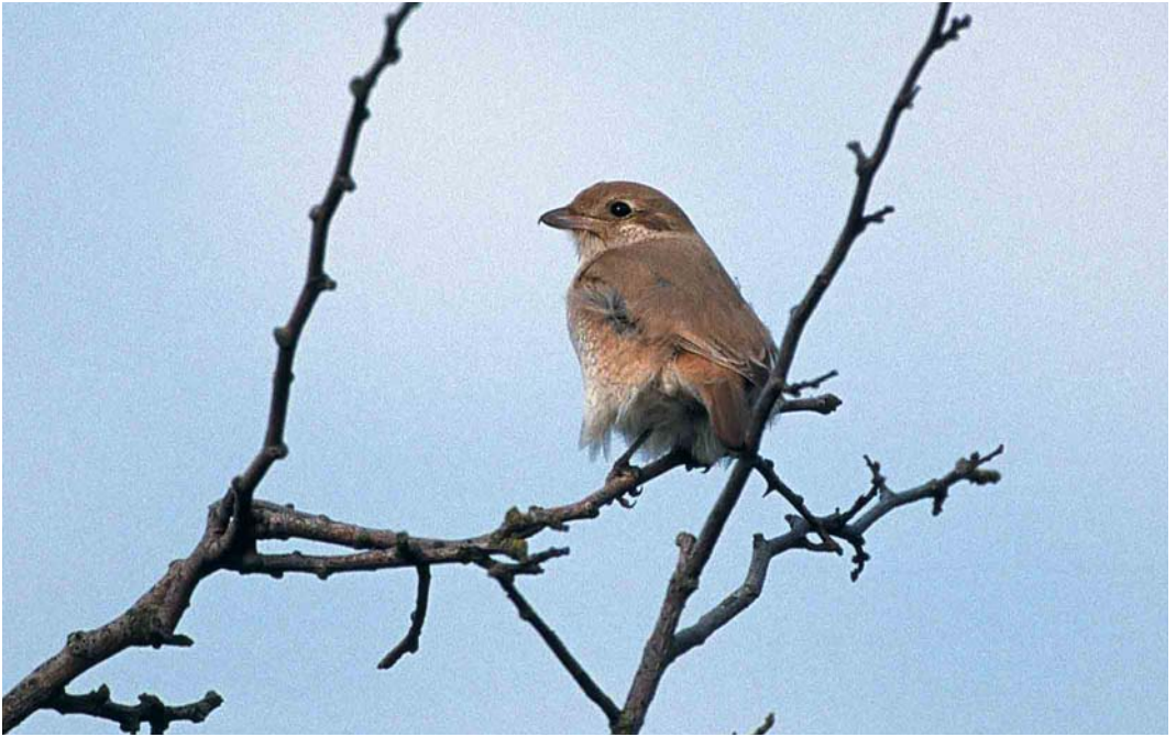
312 Daurian Shrike / Daurische Klauwier Lanius isabellinus , first-winter, Noordhollands Duinreservaat, Castricum, Noord-Holland, 3 October 2000 (Frank Dröge)