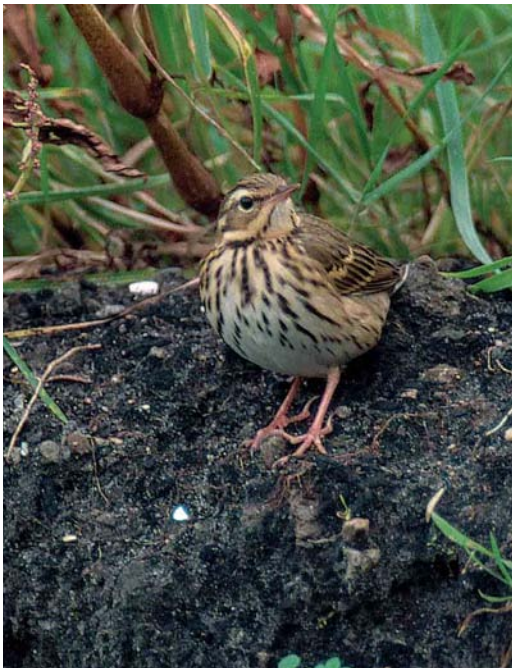
299 Olive-backed Pipit / Siberische Boompieper Anthus hodgsoni , Den Haag, Zuid-Holland, 3 October 2001 (Marten van Dijk)