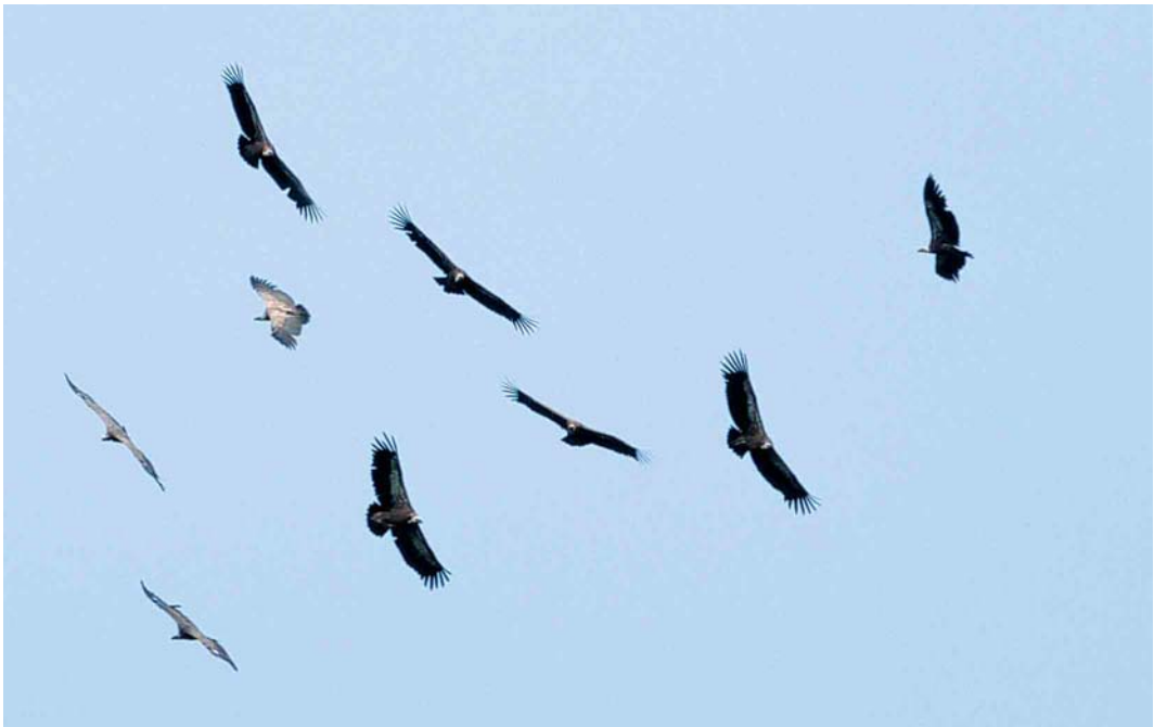
287 Eurasian Griffon Vultures / Vale Gieren Gyps fulvus , immatures, Westenschouwen, Zeeland, July 2001 288 Egyptian Vulture / Aasgier Neophron percnopterus , adult, Epen, Limburg, 25 May 2001