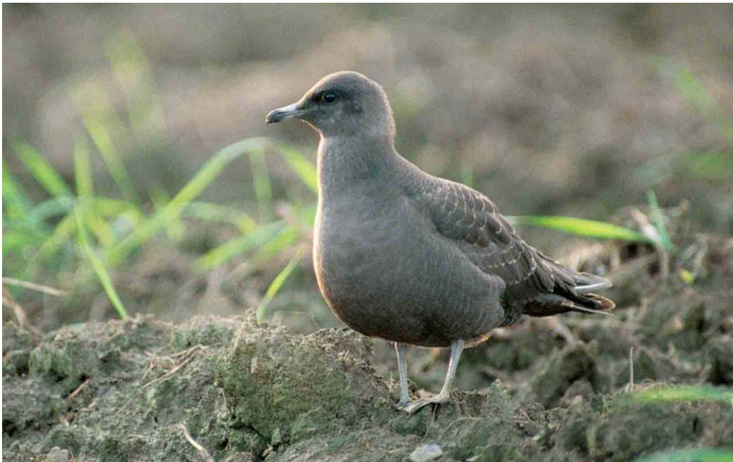
372 Kleinste Jager / Long-tailed Jaeger Stercorarius longicaudus , juveniel, Aische-en-Refail, Namur, 1 september 2002 (Antoine Joris)

Vlaanderen; Wintam (Bornem); en Zeebrugge (drie). De enige Morinelplevier Charadrius morinellus voor het najaar werd op 2 september opgemerkt bij Boneffe, Namur. De adulte Steppekievit Vanellus gregarius die in augustus te Willebroek verbleef, werd op 28 september herontdekt op het Noordelijk Eiland te Wintam (Bornem). De vogel was nu volledig in winterkleed en bleef tot 30 september. Temmincks Strandlopers Calidris temminckii verbleven te Gent, te Knokke en bij Veurne. Tot 4 september pleisterde de juveniele Gestreepte Strandloper C melanotos nog bij Veurne. Een andere verbleef op 26 september bij Genappe, Brabant-Wallon. De tweede Grote Griuze Snip Limnodromus scolopaceus voor België liet zich van 23 tot 25 september moeizaam vinden in de Achterhaven van Zeebrugge. Op 6 oktober vloog een Rosse Franjepoot Phalaropus fulicaria langs Raversijde, West-Vlaanderen. Vanaf 31 oktober pleisterde een eerste-winter te Blankenberge. Een binnenlandwaarneming van een Kleine Jager Stercorarius parasiticus vond plaats op 11 september in Willebroek. Ook verzeilden tijdens de eerste dagen van september enkele juveniele Kleinste Jagers S longicaudus in het binnenland: te Fexhe-le-Haut-Clocher, Liège, en te Aische-en-Refail, Namur. Een verzwakt exemplaar werd op 12 september opgehaald te Oostmalle maar overleefde het avontuur niet. Een zeer donkere juveniele was op 18 september aanwezig in Het Zwin te Knokke. Langs De Panne vloog er