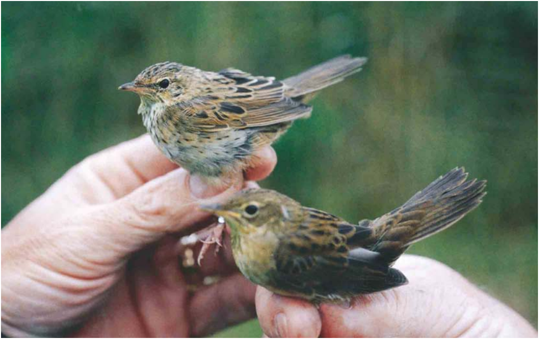
357 Kleine Sprinkhaanzanger / Lanceolated Warbler Locustella lanceolata (boven/upper) met Sprinkhaanzanger / Common Grasshopper Warbler L. naevia , Amsterdamse Waterleidingduinen, Zandvoort, Noord-Holland, 20 september 2002 358 Siberische Sprinkhaanzanger / Pallas's Grasshopper Warbler Locustella certhiola , Castricum, Noord-Holland, 21 september 2002