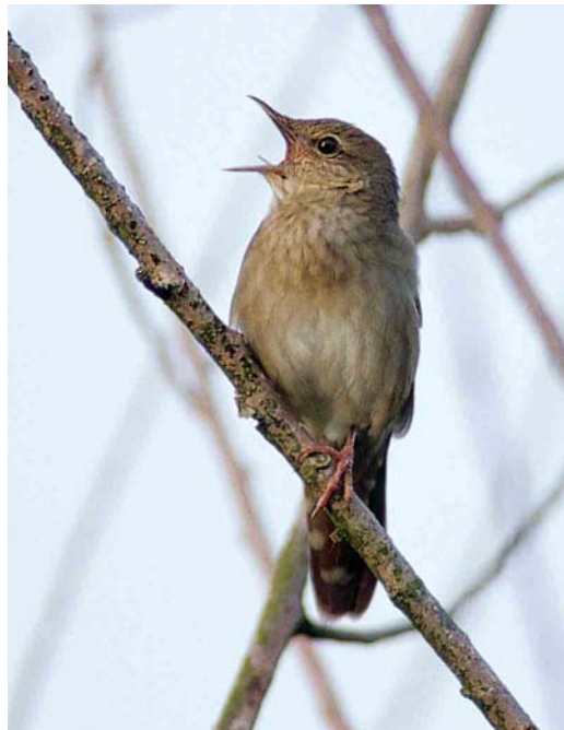
300 River Warbler / Krekelzanger Locustella fluviatilis , Leerdam, Gelderland, 5 June 2001