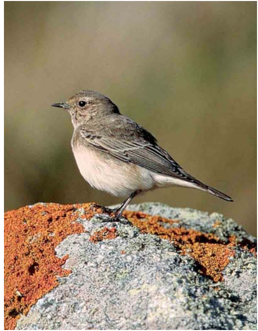
338 Blyth's Pipit / Mongoolse Pieper Anthus gustavi , Titran, Frøya, Sør-Trøndelag, Norway, 8 October 2002 339 Pied Wheatear / Bonte Tapuit Oenanthe pleschanka , Ouessant, Finistère, France, 18 October 2002 340 Pechora Pipit / Petsjorapieper Anthus gustavi , Utsira, Rogaland, Norway, 6 October 2002