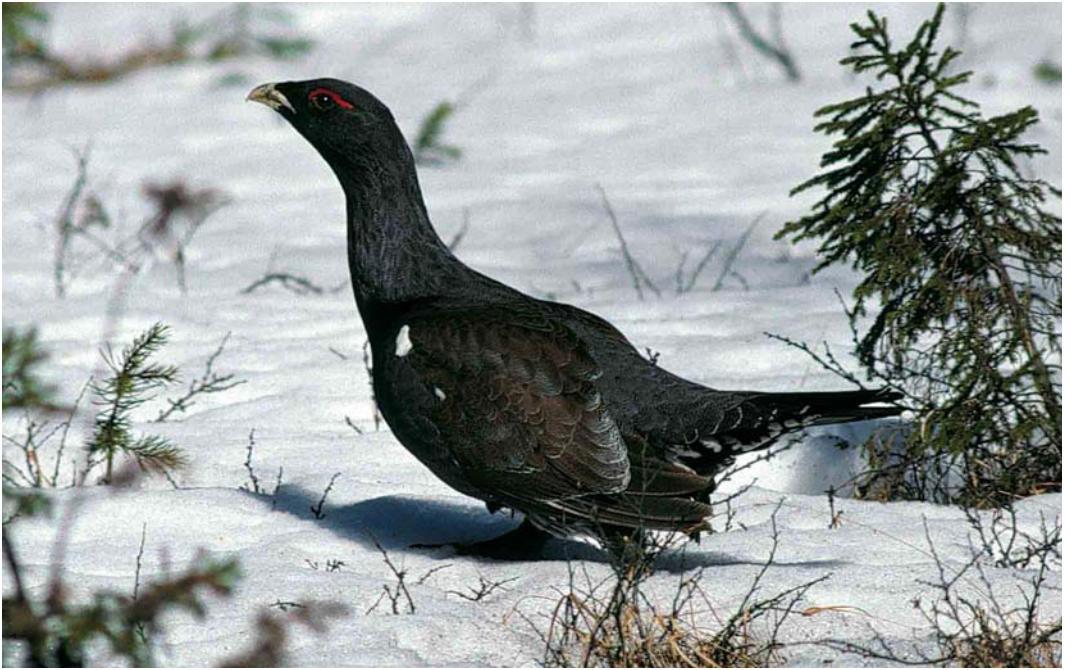
10 Western Capercaillie / Auerhoen Tetrao urogallus , male, Hamra, Sweden, April 1999