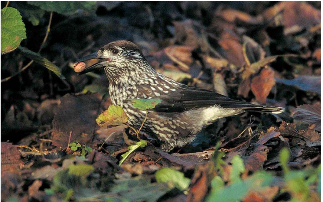
54 Notenkraker / Spotted Nutcracker Nucifraga caryocatactes , Zeewolde, Flevoland, 10 december 2001