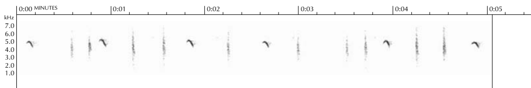
FIGUUR 2 Tapuit / Northern Wheatear Oenanthe oenanthe oenanthe , sonogram van roepen / sonogram of calls, Brough of Birsay, Orkney, Schotland, 2 juli 2001. 'Wiet-tjek-roep', hier gebruikt als alarmroep bij nest, maar fluitende deel waarschijnlijk equivalent aan fluitroep van Izabeltapuit / 'whistle and chak calls', here used as alarm call near nest but whistling call probably equivalent to whistle call by Isabelline Wheatear

De Izabeltapuit van IJmuiden kon tijdens de ontdekking worden gedetermineerd door het forse formaat, het lichte bruingrijze tot zandkleurige verenkleed, het weinige contrast tussen centrum en zoom van de middelste en grote dekveren (centra lichter dan duimvleugel), de lichte onderveugel en de korte staart met brede zwarte band. Nadien bleken subtielere kenmerken als forse snavel, lange poten, korte handpenprojectie, vorm van de wenkbrauwstreep en opgerichte houding de determinatie te ondersteunen. Daarnaast werd de determinatie bevestigd op grond van de gemaakte geluidsoptname. De waargenomen roep wordt in Cramp (1988) omschreven als 'whistle call', die soms door dwaalgasten ten gehore wordt gebracht. Voor een uitgebreid overzicht van de kenmerken van Izabeltapuit zij verwezen naar Corso (1997).