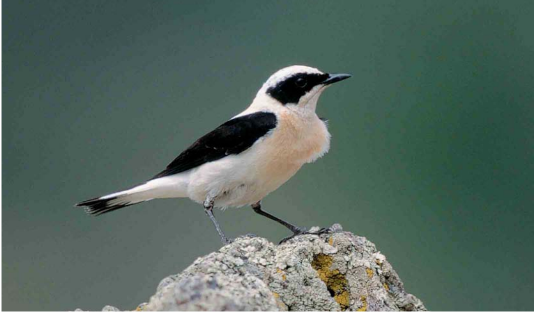
72 Eastern Black-eared Wheatear / Oostelijke Blonde Tapuit Oenanthe melanoleuca , adult male, Lesvos, Greece, April 2001 (René Pop). Typical bird, showing very white upperparts (apparently without any trace of ochre or yellow) but obvious peach wash on breast. Much black on lores and forehead as well as 'deep' black ear-coverts patch also typical.