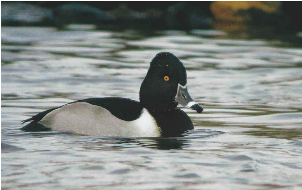
134 Ringsnaveleend / Ring-necked Duck Aythya collaris , adult mannetje, Hardenberg, Overijssel, 19 januari 2003 (Phil Koken)