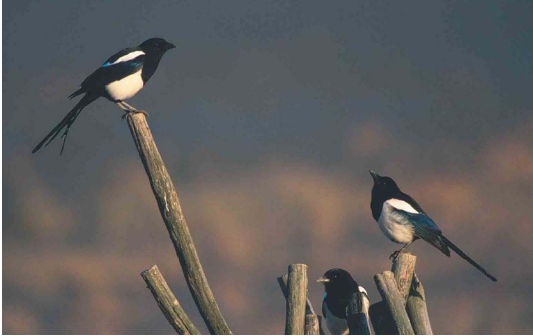
99 Oriental Magpies / Oosterse Eksters Pica (pica) sericea , Ganghwa-do, South Korea, 26 October 2002