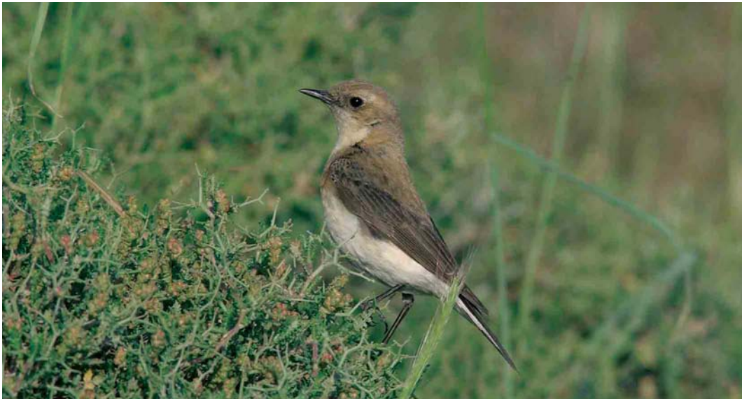
87 'Black-eared wheatear' / 'blonde tapuit' Oenanthe hispanica/melanoleuca , female, Lesvos, Greece, April 2002. Lack of any obvious black tones to ear-coverts or wings shows this to be a female rather than an immature male. While some hispanica have an ochre or russet tone to the upperparts and some melanoleuca are darker, more obviously deep brown, birds like this one occur in both taxa. Since the photograph is taken on Lesvos, it is most likely melanoleuca but it is not possible to identify a vagrant displaying a similar appearance.