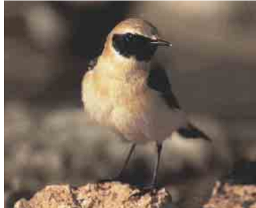
66 Western Black-eared Wheatear / Westelijke Blonde Tapuit Oenanthe hispanica , adult male, Spain, April 1988 ( Ola Bondesson ). Typical male with uniform, warm upperparts, small amount of black above bill and small throat-bib. 67 Western Black-eared Wheatear / Westelijke Blonde Tapuit Oenanthe hispanica , immature male, Spain, April 2001 ( Vicente Moreno ). Deep ochre/orange crown and nape (and apparently uniform with what is glimpsed of the mantle) typical for male hispanica and suggesting an adult bird. However, pale fringes to the coverts as well as over much of the centre of the throat-bib reveal that it is an immature bird. Small amount of black on lores/forehead typical for hispanica but not impossible for immature melanoleuca . Note, however, throat-bib which is too small for melanoleuca , and a diffuse whitish/pale ochre zone between the breast and the black throat, more consistent with hispanica .