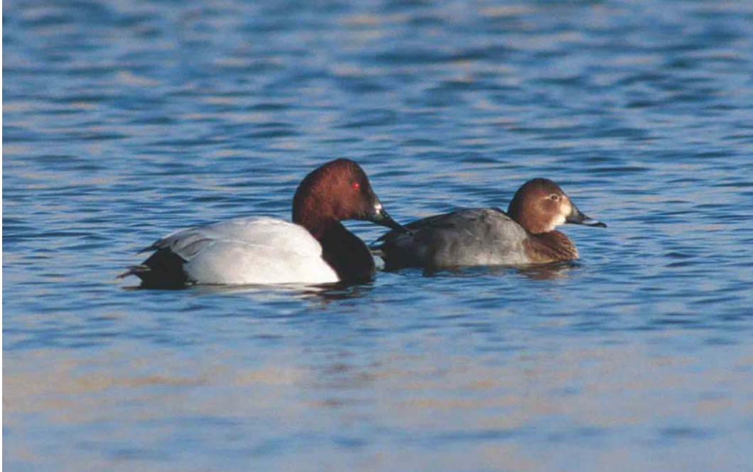
133 Grote Tafeleend / Canvasback Aythya valisineria , adult mannetje, met Tafeleend / Common Pochard A ferina , vrouwtje, Castricum, Noord-Holland, januari 2003 (Eric Koops)