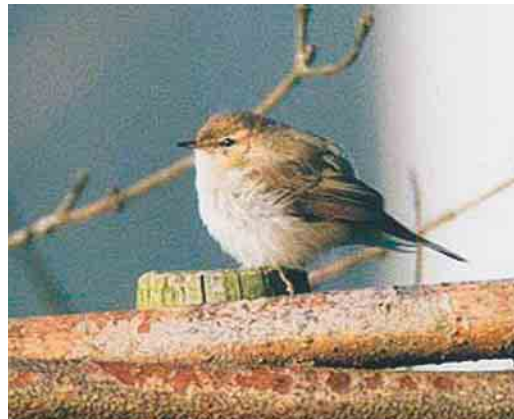
147 Witbandkruisbek / Two-barred Crossbill Loxia leucoptera bifasciata , mannetje, IJzeren Veld, Huizen, Noord-Holland, 3 november 2002 148 Rode Wouw / Red Kite Milvus milvus , Oosterland, Zeeland, 14 februari 2003 149 Kleine Alk / Little Auk Alle alle , Zoetermeer, Zuid-Holland, 16 februari 2003 150 Siberische Tjiftjaf / Siberian Chiffchaff Phylloscopus collybita tristis , Hoogerkerk, Groningen, Groningen, 24 januari 2003

de Brabantsche Biesbosch, Noord-Brabant, 12 begin januari in de omgeving van 's-Hertogenbosch, Noord-Brabant, 17 op 1 februari bij de visvijvers van Valkenswaard, Noord-Brabant, 10 op 2 februari in De Banen, Limburg, 18 op 17 februari in Polder Groot-Mijdrecht, Utrecht, en 12 op 16 februari bij Doornspijk, Gelderland. Vroege Lepelaars Platalea leucorodia werden opgemerkt op 9 februari in de Beemster, Noord-Holland (vier), en op 10 februari een uitzonderlijke groep van 72 vliegend over het Veerse Meer, Zeeland. Een Zwarte Wouw Milvus migrans werd gemeld op 17 januari bij Leusden, Utrecht. Behalve zeven losse Rode Wouwen M. milvus , verbleven er twee vanaf 8 januari in de omgeving van Ouwerkerk en Oosterland, Zeeland. Niet minder dan 17 Zeearenden Haliaeetus albicilla verbleven in Nederland, waaronder adulte (nog) op 1 januari langs het Drontermeer, Gelderland, en op 21 februari