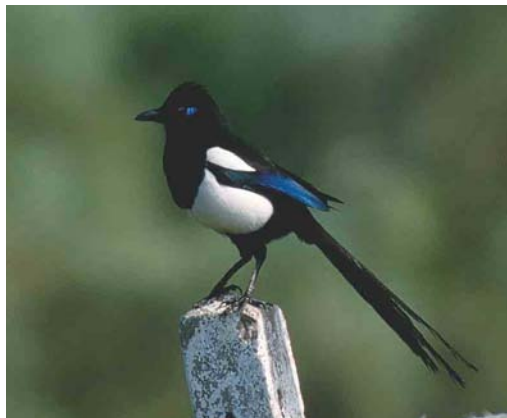
105 Maghreb Magpie / Maghrebekster Pica (pica) mauritanica , Sidi Bou Rhaba, Morocco, 24 March 2002 (Arnoud B van den Berg)

This taxon may prove to be the basal taxon within the Pica group (see above). It is widespread in eastern Asia, occurring from Amurland, Russia, through China, Korea and (introduced) on Kyushu, Japan, south to Vietnam and Laos. It looks much like nominate pica but is characterized by a relatively small and short bill, relatively long wings and short tail and a more purple blue gloss on wings and tail. Its chatter call is much slower than the same call of nominate pica and therefore closely resembles the chatter call of both Nearctic taxa. The strong similarities between the Nearctic taxon hudsonia and the Palearctic taxon sericea (including anderssoni ) were already noted in the mid-1900s by the German/Hungarian ornithologist Endre Kleiner (who changed his name after World War II to Anders Keve) (Kees Roselaar in litt). Sound recordings from Japan can be found in Ueda (1998). Behaviourally, it appears to be more