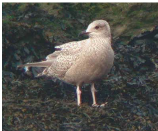
123 Lesser Short-toed Lark / Kleine Kortteenleeuwerik Calandrella rufescens , Utlängan, Blekinge, Sweden, 14 February 2003 ( Mikael Nord ) 124 Glaucous Gull / Grote Burgemeester Larus hyperboreus , second-winter, Punta de Jandia, Fuerteventura, Canary Islands, 7 February 2003 ( Andreas Buchheim ) 125-126 Thayer's Gull / Thayers Meeuw Larus glaucooides thayeri , juvenile, Killybegs, Donegal, Ireland, 24 February 2003 ( Chris Batty )

Another adult occurred at Castro Urdiales, Cantabria, Spain, from 9 February to March. A first-winter was present at Entressen, La Crau, Bouches-du-Rhône, from 25 February to at least 9 March, together with a first-winter Ring-billed Gull L. delawarensis and an adult Glaucous Gull L. hyperboreus . In both France and Spain, eight Ring-billed Gulls were reported during February alone. At Pt Saint Elmo, Malta, a first-winter Slender-billed Gull L. genei and a first-winter European Herring Gull L. argentatus were seen on 18 January and several Pontic Gulls L. cachinnans in January-February. On 16 February, seven migratory Lesser Black-backed Gulls flew over Reykjavík, Iceland. In the third week of February, six first-winter American Herring Gulls L. smithsonianus were reported from Cork and Londonderry, Ireland, and one from Cornwall, England. Up to 11 were present in the Azores in February. On 2 February, a juvenile Thayer's Gull L. glaucooides thayeri