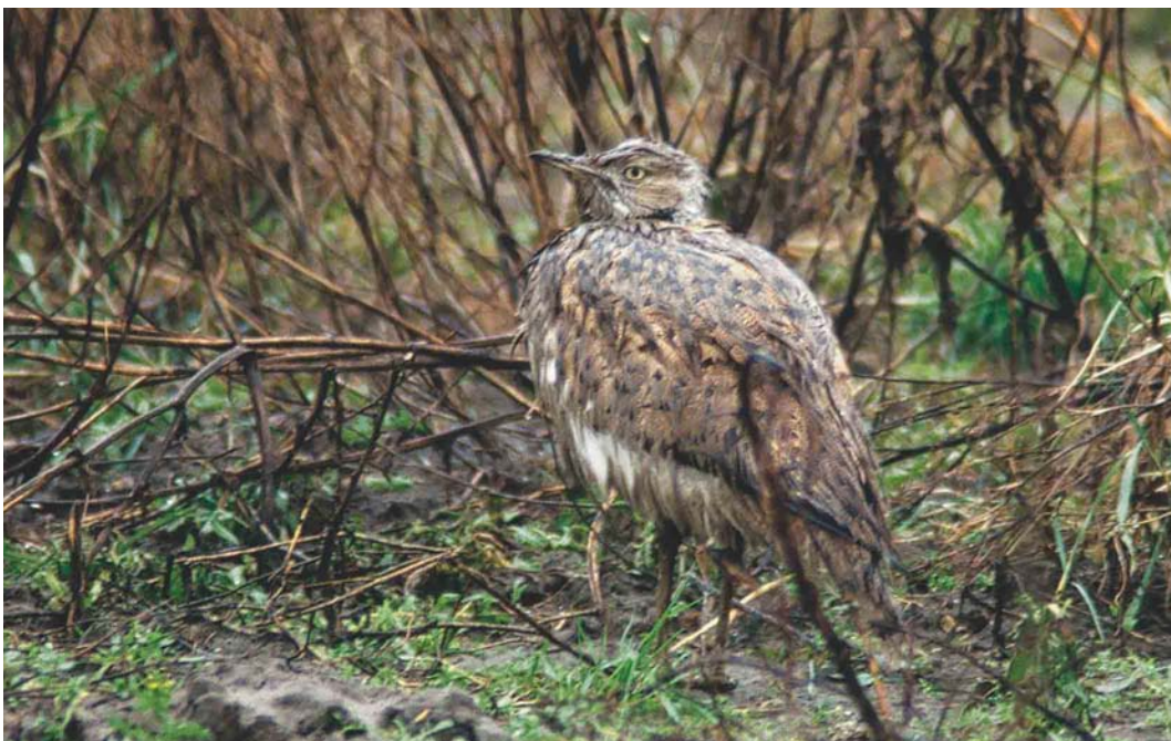
111 Macqueen's Bustard / Oostelijke Kraagtrap Chlamydotis macqueenii , first-winter, Lombardsijde, West-Vlaanderen, Belgium, 20 January 2003 ( Johan Buckens )