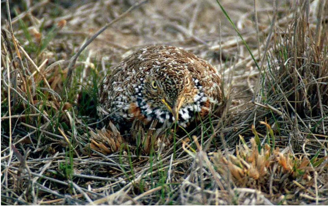
93-94 Plains-wanderer / Trapvechtkwartel Pedionomus torquatus , adult female, near Deniliquin, New South Wales, Australia, 20 June 2002 (Pieter van der Luit)