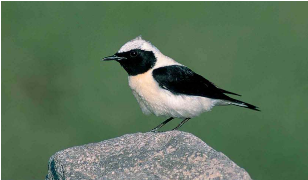
73 Eastern Black-eared Wheatear / Oostelijke Blonde Tapuit Oenanthe melanoleuca , adult male, Lesvos, Greece, May 2001. Typical bird, showing whitish upperparts with slight contrast between grey-stained crown and ochre tinge to mantle. Very slight ochre/orange tinge to breast reaches rather large black throat-bib. Much black on lores and forehead.