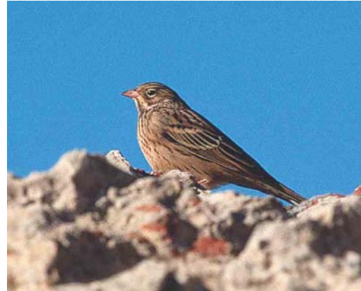
Mystery photograph IV (August)