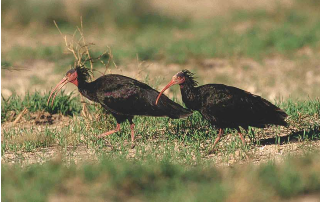
110 Northern Bald Ibises / Kaalkopibissen Geronticus eremita , Tamri, Morocco, January 2003 ( Eric Koops )