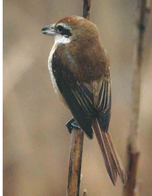
112 Dwergaalscholver / Pygmy Cormorant Microcarbo pygmeus , adult, Eijsder Beemden, Limburg, maart 2003 113 Brown Shrike / Bruine Klauwier Lanius cristatus , La Tomina, Modena, Italy, 18 January 2003 114 Northern Gannet / Jan-van-gent Morus bassanus , adult, Lac Léman, Switzerland, February 2003