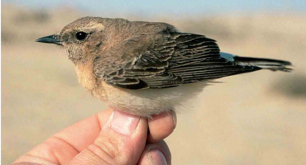
86 'Black-eared wheatear' / 'blonde tapuit' Oenanthe hispanica/melanoleuca , female, Egypt, March 1997 (Johan Vanautgaerden). Since this bird is photographed on migration in Egypt, it is most likely an Eastern Black-eared Wheatear O melanoleuca but as a vagrant elsewhere it would be impossible to identify with certainty. A little paler on the upperparts than typical melanoleuca and a little greyer, less ochre than typical Western Black-eared Wheatear O hispanica , the bird is intermediate and could be any of the two. Also, note the lack of a grey or brown tinge in the breast-band, which would have been a pointer towards melanoleuca . Fairly long primary projection indeed indicates melanoleuca .