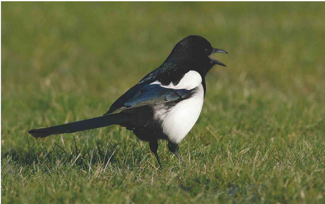
100 Eurasian Magpie / Ekster Pica pica pica , Julianadorp, Noord-Holland, Netherlands, 14 February 2003