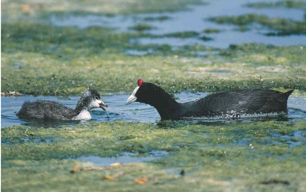
106 Red-knobbed Coots / Knobbelmeerkooten Fulica cristata , adult and juvenile, Ifrane, Morocco, 27 March 2002

cially rounder, the highest point at just a little more than halfway the back. Another difference between Red-knobbed and Eurasian in immature plumages is the overall body colour. Juvenile Red-knobbed is much darker overall than juvenile Eurasian. The body colour of Red-knobbed is dark black-grey, whereas the body colour in Eurasian is grey and even whitish on parts of the head and breast. A careful look at the mystery photograph shows that the white parts are restricted to the lores, chin and central parts of the throat and breast. Other parts of the head, such as ear-coverts and sides of the breast, are dark black-grey and this character is, therefore, in favour of Red-knobbed. A very important identification character of Red-knobbed at all ages is the shape or loreal feathering between bill and shield. In Eurasian, the loreal feathering projects forwards in a sharp point at the base of the upper mandible. In adults, this feature creates the well-known white indentation between the white frontal shield and the bill. In Red-knobbed, the loreal feathering is more or less rounded and does not project forwards in a point above the bill. In the mystery bird, the adult's shield is not present yet but the loreal feathering near the upper mandible can be seen well. The mystery bird shows