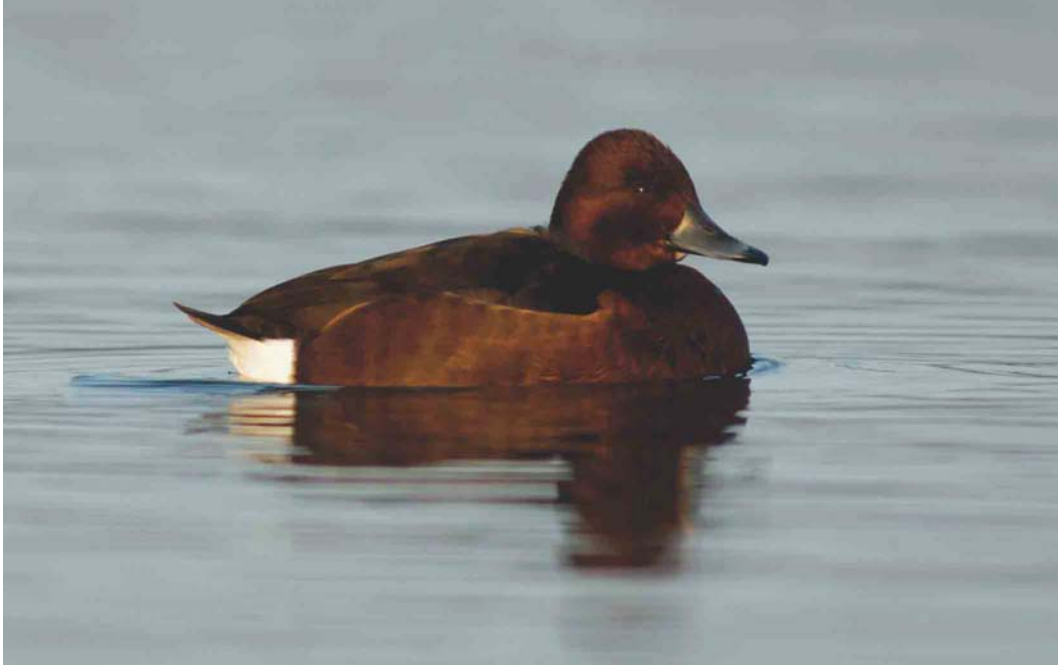
135 Witoogeend / Ferruginous Duck Aythya nyroca , vrouwtje, Heel, Limburg, 10 februari 2003