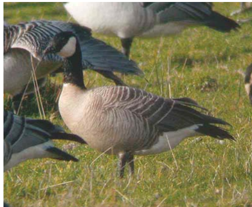
119 Yellow-billed Loon / Geelsnavelduiker Gavia adamsii , juvenile, Augsburg, Bayern, Germany, February 2003 (Markus Roemhild) 120 Green-winged Teal / Amerikaanse Wintertaling Anas carolinensis , male, Aiguamolls de l'Empordá, Girona, Spain, 12 January 2003 (Rafael Armada) 121 Canvasback / Grote Tafeleend Aythya valisineria , adult male, Castricum, Noord-Holland, Netherlands, 11 January 2003 (Bas van den Boogaard) 122 Hutchins's Canada Goose / Hutchins' Canadese Gans Branta hutchinsii hutchinsii , Lissadell, Sligo, Ireland, 24 February 2003 (Chris Batty)

up in Aisne on 5 March and one in Somme on 9 March. On 28 February, 11 Great Knots Calidris tenuirostris were seen at Khor al-Beidah, UAE. The long-staying Long-billed Dowitcher Limnodromus scolopaceus at Sohar, Oman, was still present on 21 February (first noted in 1997; cf Dutch Birding 23: 158, plate 177, 161, 2001, 25: 57-58, plate 33, 2003). The one in Cheshire, England, was still seen in early February. Other long-stayers at Inver Bay, Highland, Scotland, from 8 November 2002 and at Clonakilty, Cork, Ireland, from 30 November 2002 were still present in March (although the latter was lost for many weeks). The second Spotted Sandpiper Actitis macularia for Italy at Saline di Augusta, Siracusa, Sicily, from 9 December 2002 was still present in late February. A Red Phalarope Phalaropus fulicarius on Lac Léman near Lausanne, Valais, from December 2002 to at least