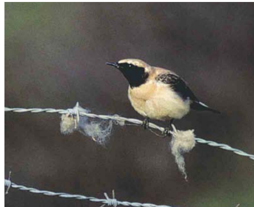
89-90 Presumed Eastern Black-eared Wheatear / vermoedelijke Oostelijke Blonde Tapuit Oenanthe melanoleuca , immature male, Aagtekerke, Zeeland, Netherlands, June 1996 91-92 Presumed Eastern Black-eared Wheatear / vermoedelijke Oostelijke Blonde Tapuit Oenanthe melanoleuca , immature male, Aagtekerke, Zeeland, Netherlands, June 1996. Obvious 'immature impression' increased by slight brownish tinge to black greater coverts is a character for melanoleuca . The contrast between the greyish, 'dirty' crown/nape and 'cleaner' ochre mantle is typical for melanoleuca . The throat-bib is too large for Western Black-eared Wheatear O. hispanica , while the ochre of the breast reaching the throat-bib is more typical for melanoleuca . Moreover, there is too much black on the lores for hispanica .