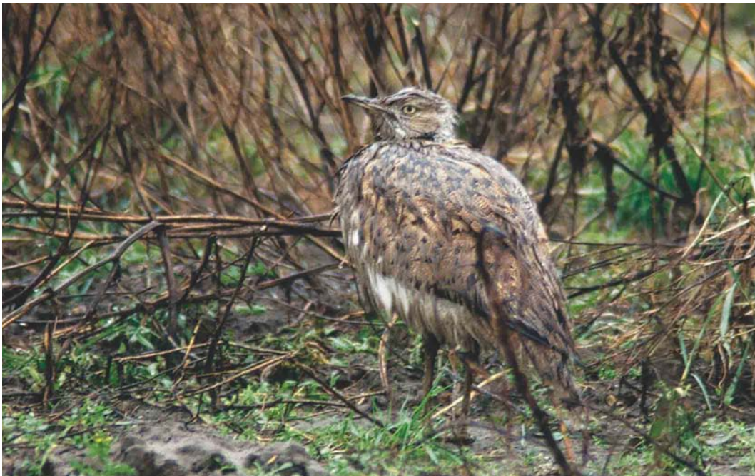
111 Macqueen's Bustard / Oostelijke Kraagtrap Chlamydotis macqueenii , first-winter, Lombardsijde, West-Vlaanderen, Belgium, 20 January 2003 ( Johan Buckens )