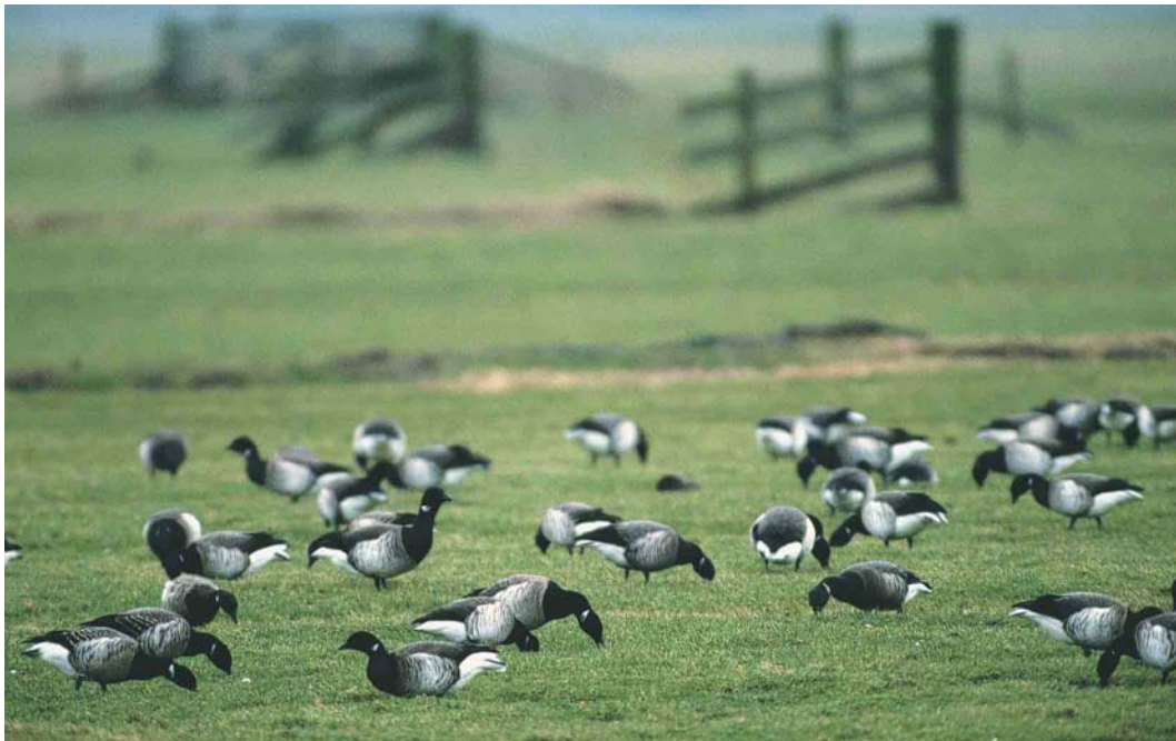
130 Witbuikrotganzen / Pale-bellied Brent Geese Branta hrota , met Rotgans / Dark-bellied Brent Goose B bernicla , Camperduin, Noord-Holland, 6 februari 2003