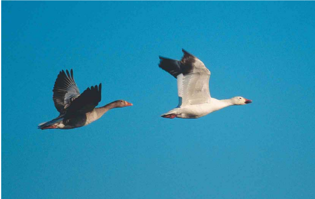
129 Sneeuwgans / Snow Goose Anser caerulescens , met Grauwe Gans / Greylag Goose A anser , Stellendam, Zuid-Holland, 25 februari 2003 (Marten van Dijk)