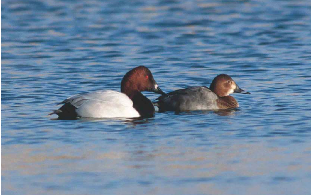
133 Grote Tafeleend / Canvasback Aythya valisineria , adult mannetje, met Tafeleend / Common Pochard A ferina , vrouwtje, Castricum, Noord-Holland, januari 2003 (Eric Koops)