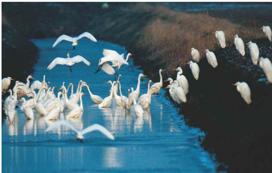
137 Grote Zilverreigers / Great Egrets Casmerodius albus , Brabantsche Biesbosch, Noord-Brabant, januari 2003