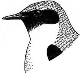
FIGURE 3 Adult 'half-bib' spring male Western Black-eared Wheatear / Westelijke Blonde Tapuit Oenanthe hispanica (Magnus Ullman). While most black-throated male hispanica have slightly smaller throat-bib than Eastern Black-eared Wheatear O melanoleuca , a minority has noticeably restricted throat-bib, so small that the silhouette of the black ear-coverts becomes clearly visible (the 'rear-end-shape' of the ear-coverts tends to be suggested in many normal hispanica as well). In most 'half-bib' males, the lower border of the bib is diffusely marked.

above the culmen, while in others the area of contact is 1 mm, occasionally more (see figure 4). Although the difference is normally obvious on birds which are seen well, there may be problematic individuals. Thus, this is a good character in most birds, while some birds seem intermediate.