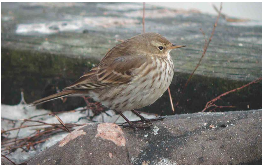
128 Water Pipit / Waterpieper Anthus spinoletta , Hals, Nordjylland, Denmark, 3 February 2003