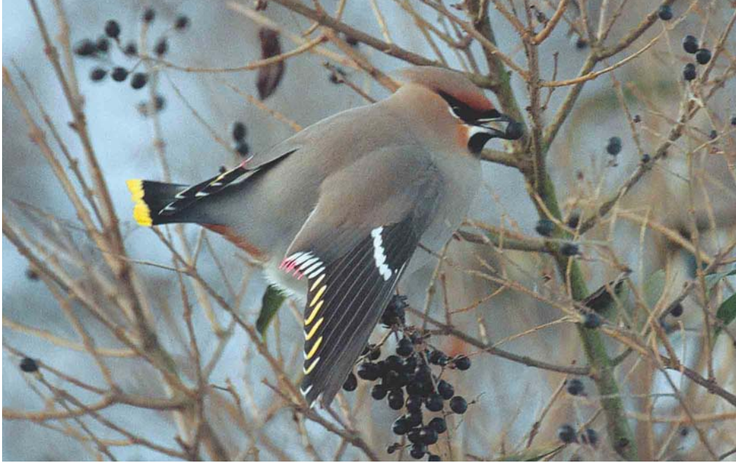
145 Pestvogel / Bohemian Waxwing Bombycilla garrulus , Noordwijk, Zuid-Holland, januari 2003 (Menno van Duijn)