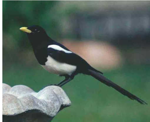
97 Yellow-billed Magpie / Geelsnavelekster Pica nuttalli , Nojoqui Park, California, USA, 12 March 1982 (René Pop)

derers have been recorded in most eastern states of North America and vagrants have reached the Atlantic coast of all eastern states from Newfoundland, Canada, south to North Carolina, USA (cf Sibley 2000). Magpies are reluctant to cross large stretches of water (cf Cramp & Perrins 1994) and the chances for a Black-billed Magpie to cross the Atlantic Ocean to Europe must be considered zero. However, the possibility of ship-assisted vagrancy to Europe should perhaps not be entirely ruled out and this would lead to a serious identification challenge. The same would be true for the hypothetical (ship-assisted) Eurasian Magpie turning up on the Atlantic coast of North America.