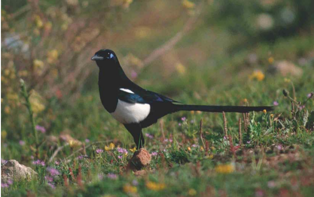
101 Maghreb Magpie / Maghrebekster Pica (pica) mauritanica , Sidi Bou Rhaba, Morocco, 24 March 2002 (Arnoud B van den Berg)