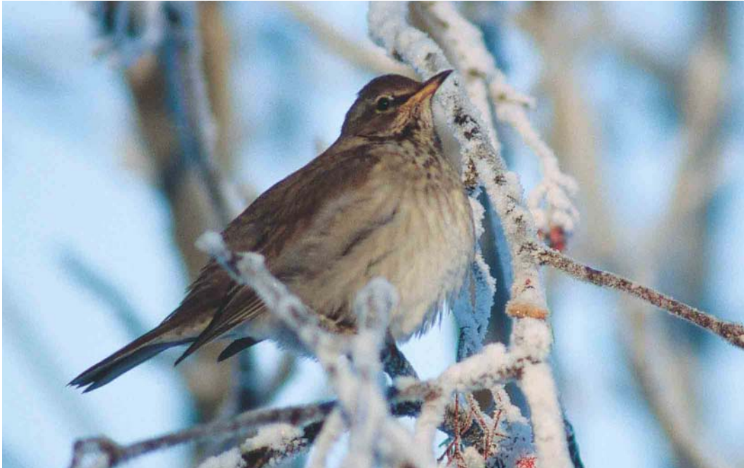
127 Black-throated Thrush / Zwartkeellijster Turdus ruficollis atrogularis , Rautjärvi, Finland, January 2003 (Pekka Komi)