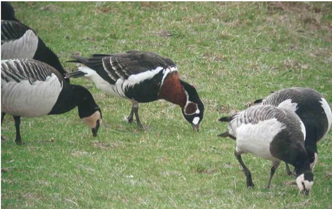
132 Roodhalsgans / Red-breasted Goose Branta ruficollis , eerstejaars, met Brandganzen / Barnacle Geese B leucopsis , Korendijkse Slikken, Zuid-Holland, 5 januari 2003