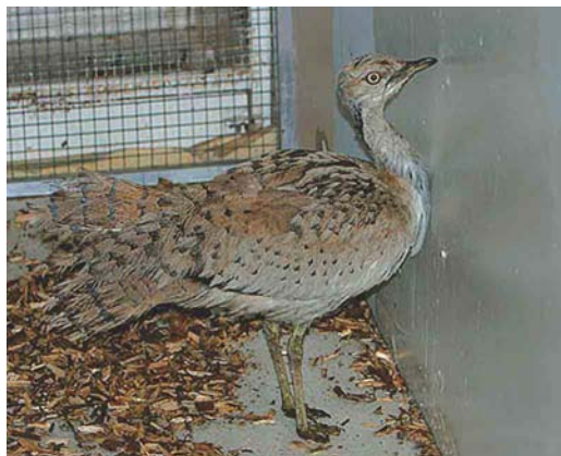
[Dutch Birding 25: 149-151, 2003]

151 Oostelijke Kraagtrap / Macqueen's Bustard Chlamydotis macqueenii , eerste-winter (gevangen bij Lombardsijde, West-Vlaanderen, op 20 januari 2003), Oostende, West-Vlaanderen, 22 januari 2003