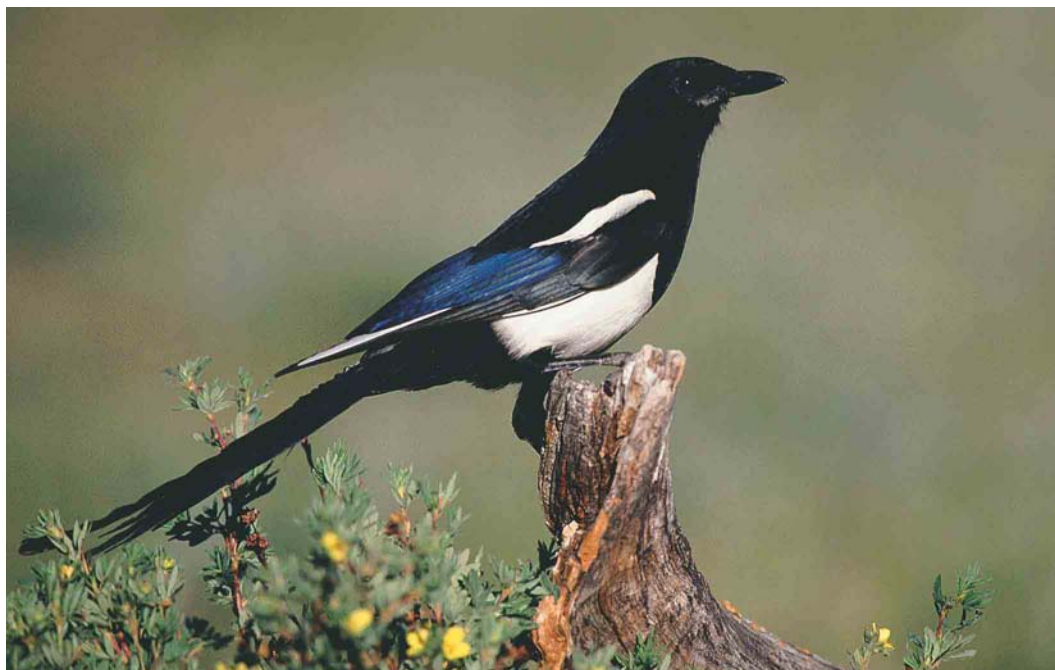
95 Black-billed Magpie / Amerikaanse Ekster Pica hudsonia , Rocky Mountains NP, Colorado, USA, June 2001

Black-billed Magpie was described as Corvus hudsonius by Sabine in 1823 from Cumberland House, Saskatchewan, Canada. It is resident from southern coastal Alaska, USA, through western Canada and northern Minnesota, USA, south to California, Nevada, Utah, Arizona, western Oklahoma, Kansas and Nebraska, USA. Wan-