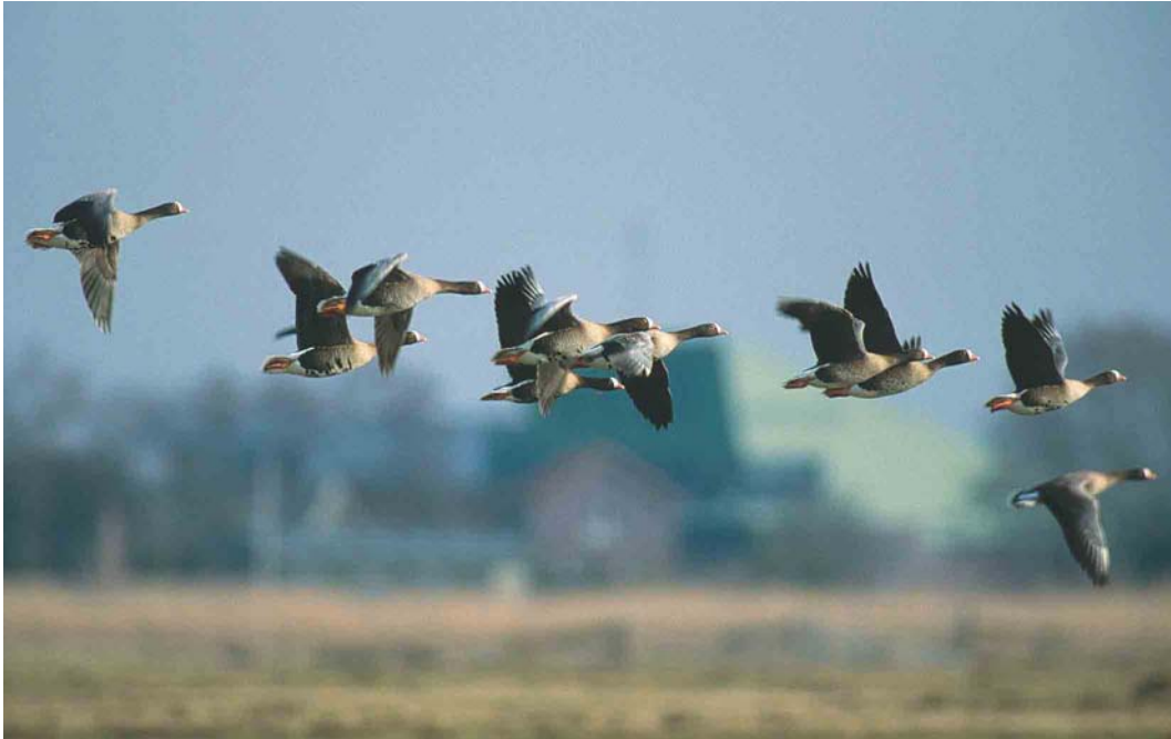
131 Dwergganzen / Lesser White-fronted Geese Anser erythropus , Oude Land van Strijen, Zuid-Holland, 6 februari 2003