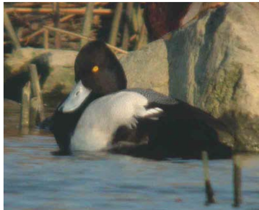
138 Witbuijkrotganzen / Pale-bellied Brent Geese Branta hrota, Camperduin, Noord-Holland, 24 februari 2003 139 Groenlandse Kolgans / Greenland White-fronted Goose Anser albifrons flavirostris, Slochteren, Groningen, 9 februari 2003 140 Zwarte Rotgans / Black Brant Branta nigricans, adult, Grevenbicht, Limburg, 24 november 2002 cf Dutch Birding 25: 64, 71, 2003. 141 Witooggeend / Ferruginous Duck Aythya nyroca, mannetje, Schipbeek, Diepenheim, Overijssel, 17 februari 2003 142 Kleine Topper / Lesser Scaup Aythya affinis, adult mannetje, Scheelhoek, Zuid-Holland, 19 februari 2003