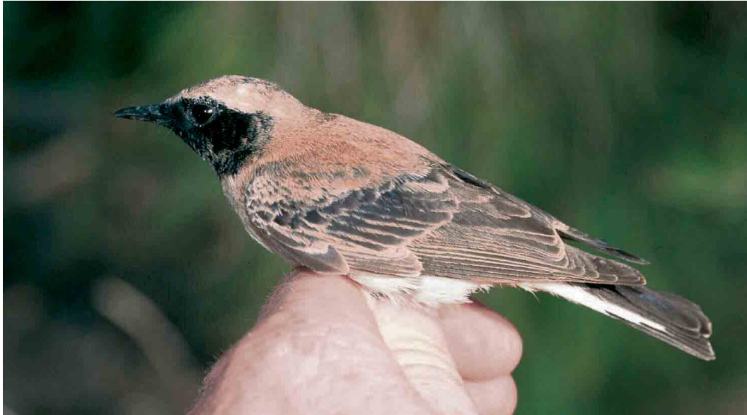
76 Eastern Black-eared Wheatear / Oostelijke Blonde Tapuit Oenanthe melanoleuca , immature male, Israel, March 2001 (Arend Wassink). Traces of pale fringes on the black throat and ear-coverts, as well as newly moulted black median coverts and most greater coverts in contrast with brownish wing show this male to be an immature. New coverts are black with slight brownish tinge, not jet-black as in Western Black-eared Wheatear O. hispanica . Although the rather bright ochre upperparts are more typical for hispanica , the large throat-bib and extensive black above the lores and the base of the bill verify that this is a melanoleuca .

narrower pale mantle section than in hispanica , which is a good supportive field mark for typical birds in spring. Moreover, the same difference in the extent of the black on the head (lores, forehead, ear-coverts and throat) as in adult males applies to immature spring males of melanoleuca and hispanica . However, there is one exception, since immature melanoleuca may have a small hispanica -type black face-mask. Thus, much black on the lores indicates melanoleuca , while little black on the lores not necessarily indicates hispanica .