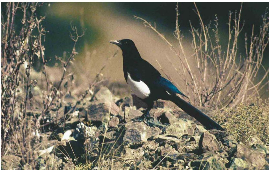
102 Asir Magpie / Asirekster Pica (pica) asirensis , Raydah, Asir Province, Saudi Arabia