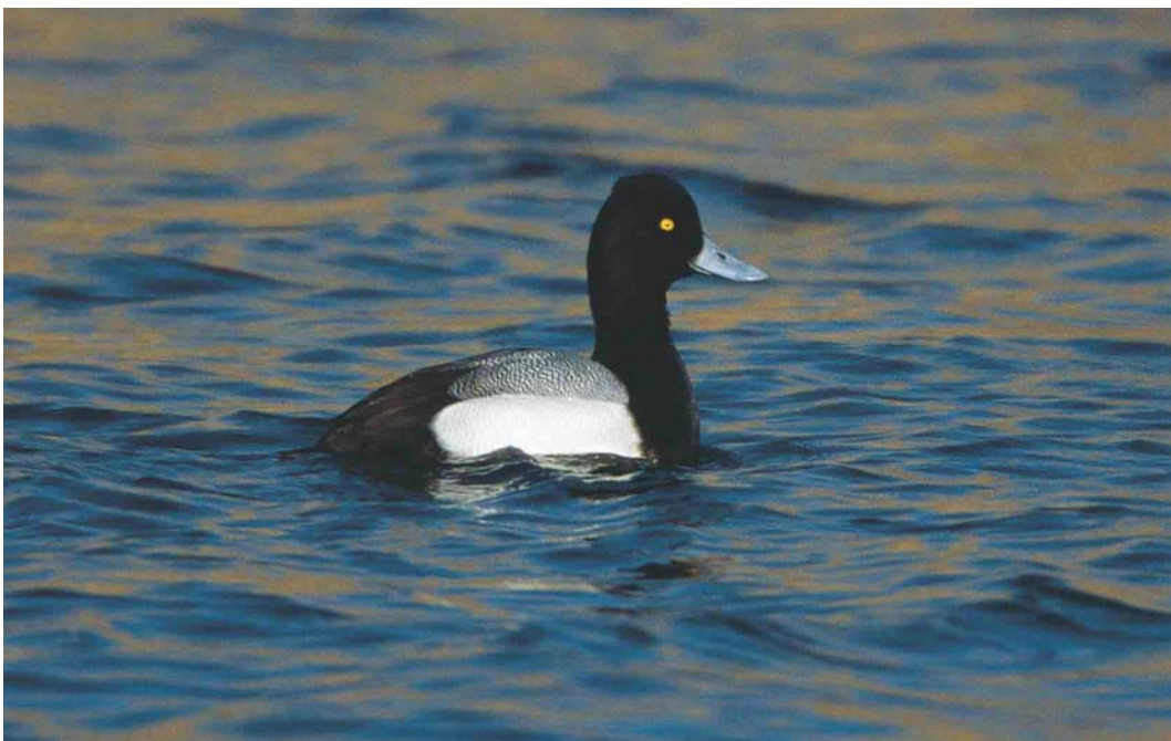
136 Kleine Topper / Lesser Scaup Aythya affinis , adult mannetje, Scheelhoek, Zuid-Holland, 21 februari 2003 ( Jan van Holten )