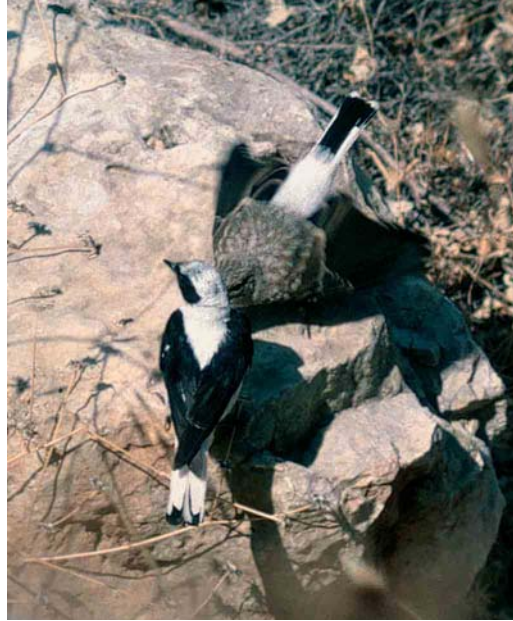
75 Eastern Black-eared Wheatears / Oostelijke Blonde Tapuiten Oenanthe melanoleuca , adult male (lower left) and juvenile, Crete, Greece, July 1984 (René Pop). Typical bird with obvious grey suffusion to crown and nape, and all-white triangular, rather narrow mantle, giving bi-coloured character to upperparts. By July, adult melanoleuca males rarely display any obvious ochre. Moulting has started and the middle, black, rectrices are missing.

males point towards melanoleuca , while bright, deep ochre upperparts point towards hispanica . In spring, whitish crown and nape with pale brownish/greyish tinge and only a slight ochre/orange touch on the mantle, as well as whitish breast and belly indicate melanoleuca , while deep ochre, uniform upperparts indicate hispanica . The most reliable of these plumages is the typical autumn melanoleuca plumage. The others are not conclusive and will need supportive characters for identification. Melanoleuca has more black on the scapulars, leaving a narrower pale mantle section than on hispanica – a good additional field mark for typical birds, mainly in spring. There is more black on the head in melanoleuca than in hispanica , thus covering a larger area of the lores, the forehead, the ear-coverts and – in black-throated males – the throat. This is the most reliable single field character in autumn as well as spring, and safe identification normally requires trustworthy assessment of