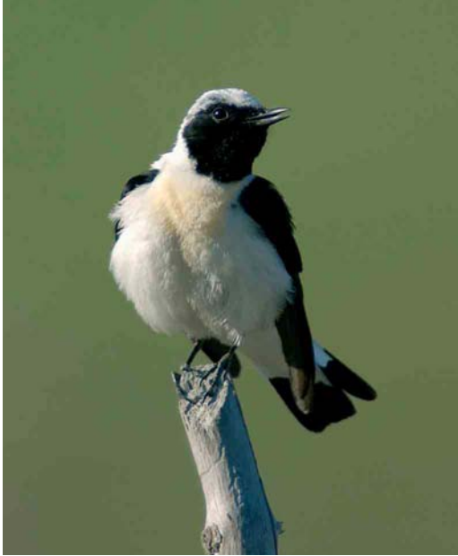
74 Eastern Black-eared Wheatear / Oostelijke Blonde Tapuit Oenanthe melanoleuca , adult male, Lesvos, Greece, April 2002. Rather typical bird with much black on lores, forehead and throat, too much for hispanica . The ochre tone on the breast is very weak (and will probably have disappeared within a month or so), leaving a narrow whitish fringe below the black throat-bib, more typical for hispanica .