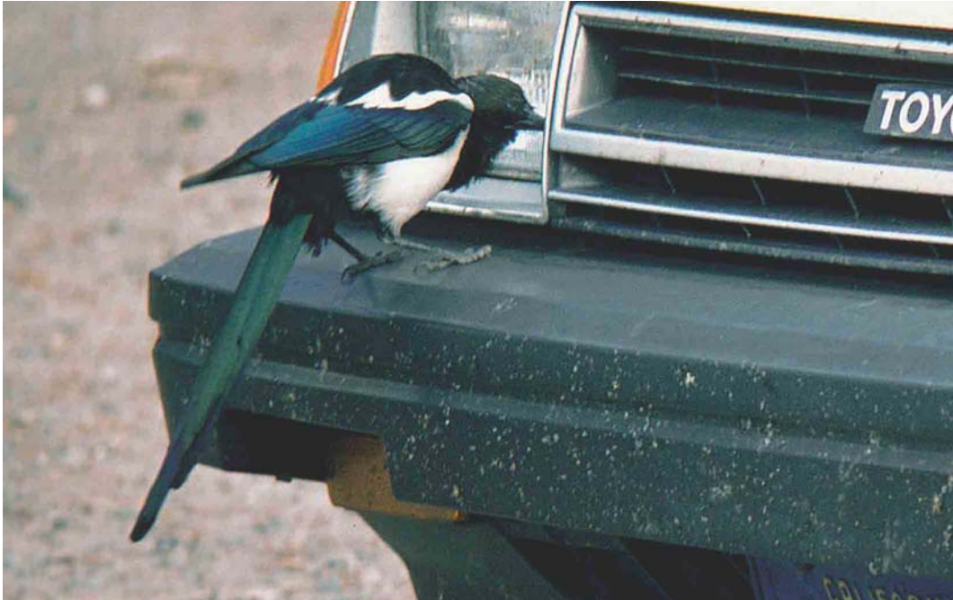
103 Black-billed Magpie / Amerikaanse Ekster Pica hudsonia , Glacier NP, Montana, USA, 19 September 1988 (René Pop)