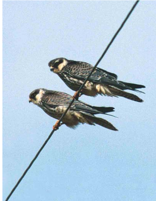
107 Amur Falcon / Amoerrootpootvalk Falco amurensis , juvenile, Dongmak-ri, Ganghwa-do, South Korea, 11 October 2002 ( Arnoud B van den Berg ) 108 Amur Falcons / Amoerrootpootvalken Falco amurensis , juveniles, Okgu, Gunsan, South Korea, 14 October 2002 ( Arnoud B van den Berg ). Note entirely dark crown and rather dark and cold upperparts, creating general impression like Eurasian Hobby F subbuteo . 109 Red-footed Falcon / Roodpootvalk Falco vespertinus , Eemshaven, Groningen, Netherlands, 2 September 2002 ( Roef Mulder ). Note broad, dark, blackish trailing edge and black barring on the remiges contrasting strongly with the pure white ground-colour.