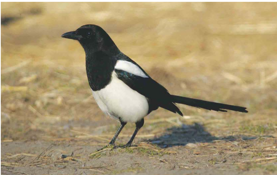
104 Eurasian Magpie / Ekster Pica pica pica , Julianadorp, Noord-Holland, Netherlands, 14 February 2003 (René Pop)