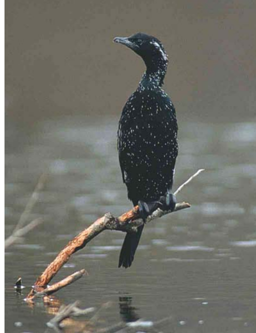
155 Dwergaalscholver / Pygmy Cormorant Microcarbo pygmeus , adult, Eijsder Beemden, Limburg, 7 maart 2003 (Marten van Dijk)

werd gedacht dat het om een (ontsnapte) aalscholver uit Zuid-Azië of Australië ging. Later op de dag bleek dit gelukkig vals alarm. In het weekend van 8 en 9 maart trokken veel waarnemers naar Zuid-Limburg om de Dwergaalscholver te bekijken; op deze dagen was de vogel de meeste tijd op zijn Nederlandse stek te vinden. Op 16 maart was de vogel nog aanwezig.