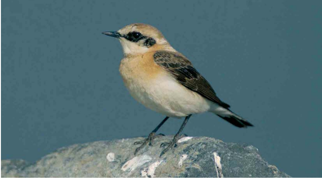
77 Eastern Black-eared Wheatear / Oostelijke Blonde Tapuit Oenanthe melanoleuca , immature male, Lesvos, Greece, April 2002 (René Pop). Typical bird with obvious 'immature impression' produced by black coverts with slight brownish tinge (and with obvious pale fringes) and grey-brown touch to crown, nape and lower mantle. 'Immature impression' in itself is a character for melanoleuca . Extensive fringes to black on lores and ear-coverts as well as blackish greater coverts in contrast with brownish primary coverts and remiges are all signs of immaturity. 78 Eastern Black-eared Wheatear / Oostelijke Blonde Tapuit Oenanthe melanoleuca , immature male, Eilat, Israel, March 1990 (René Pop). New blackish coverts in contrast with brownish remiges and primary coverts indicate immature bird. Typical melanoleuca with obvious 'immature impression' produced by the fact that the coverts are not the jet-black coverts immature Western Black-eared Wheatear O. hispanica usually displays. The rather dull buffish-brown crown, nape and mantle are more reminiscent of a female than of an adult male and are incompatible with a spring male hispanica . Restricted black in the region of the upper eye, lores and forehead is more typical for hispanica , but is regularly found in immature melanoleuca . However, the black ear-coverts patch is too 'deep' for hispanica . The non-black scapulars may suggest a female, but the face-mask is too black to support that suspicion, while the somewhat diffuse borders and pale fringing emphasize that this male is an immature.