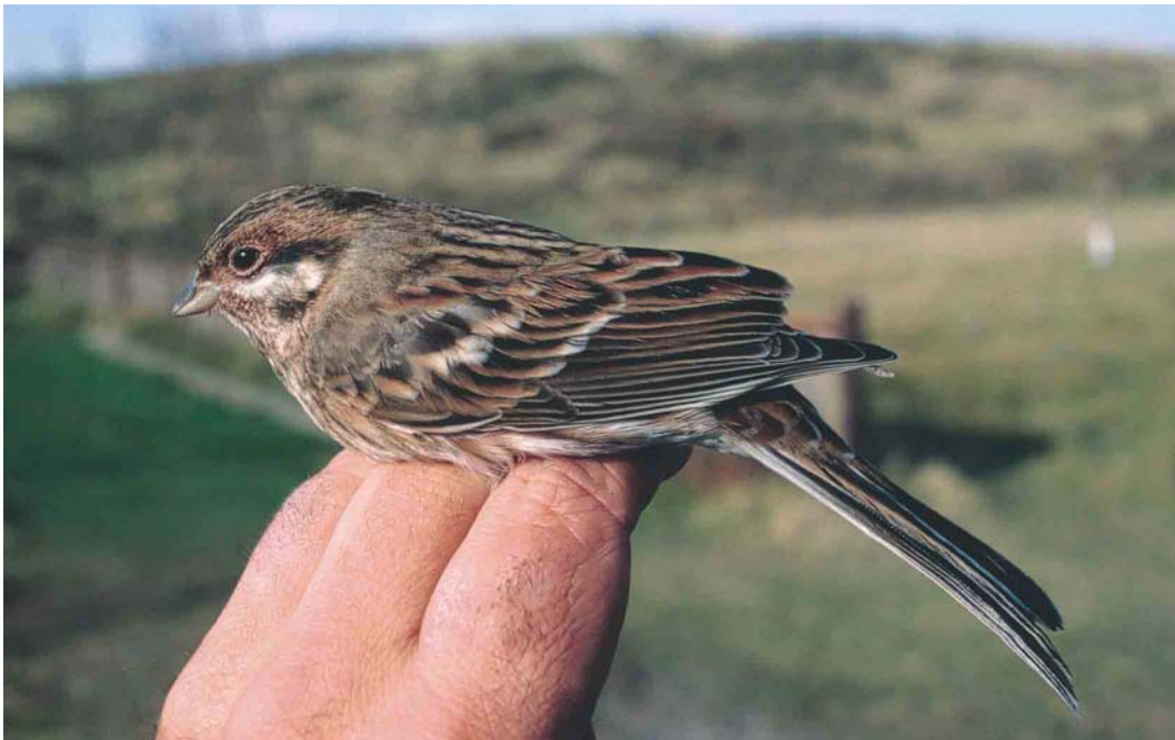
14 Pine Bunting / Witkopgors Emberiza leucocephalos , first-winter male, Kennemerduinen, Bloemendaal, Noord-Holland, Netherlands, 4 November 1987