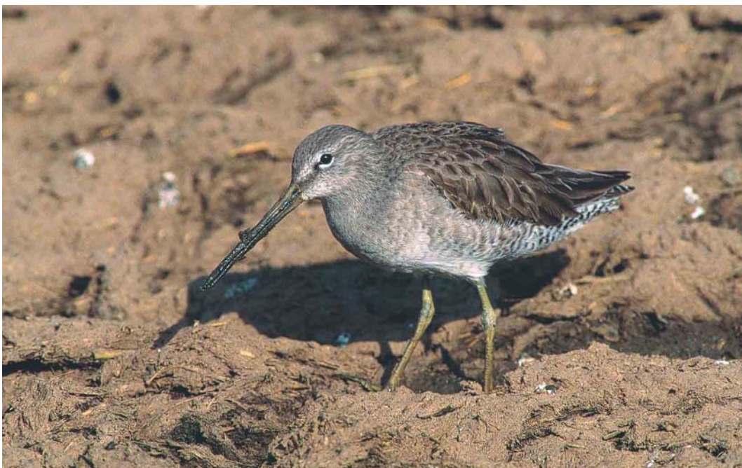
33 Long-billed Dowitcher / Grote Grijze Snip Limnodromus scolopaceus , adult, Sohar, Oman, 10 December 2002