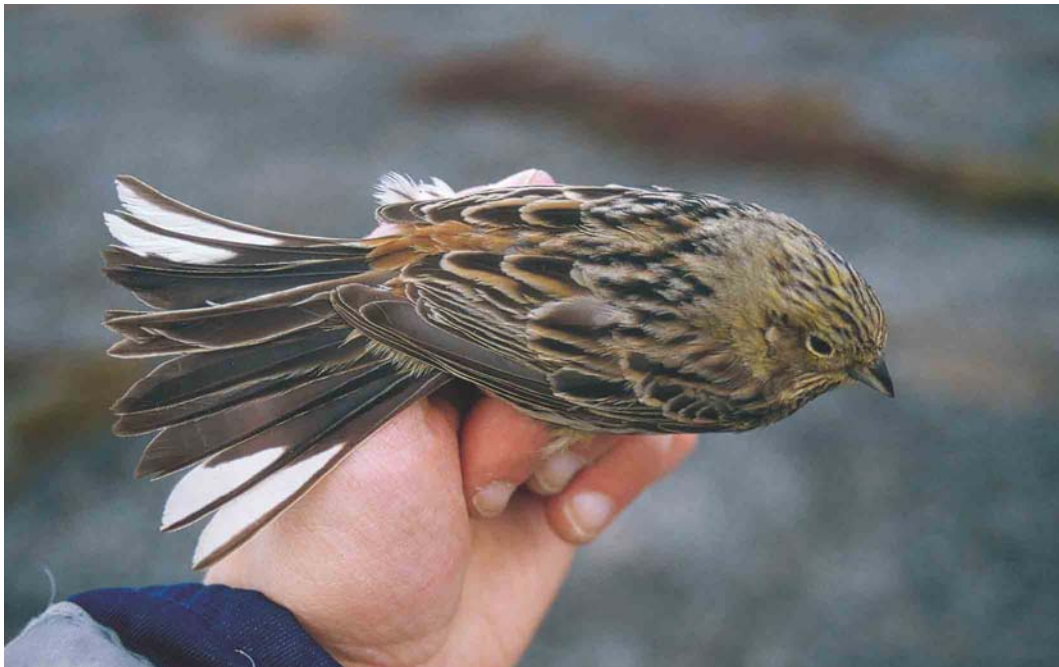
10 Yellowhammer / Geelgors Emberiza citrinella , female, Säppi ringing station, Luvia, Finland, May 1999