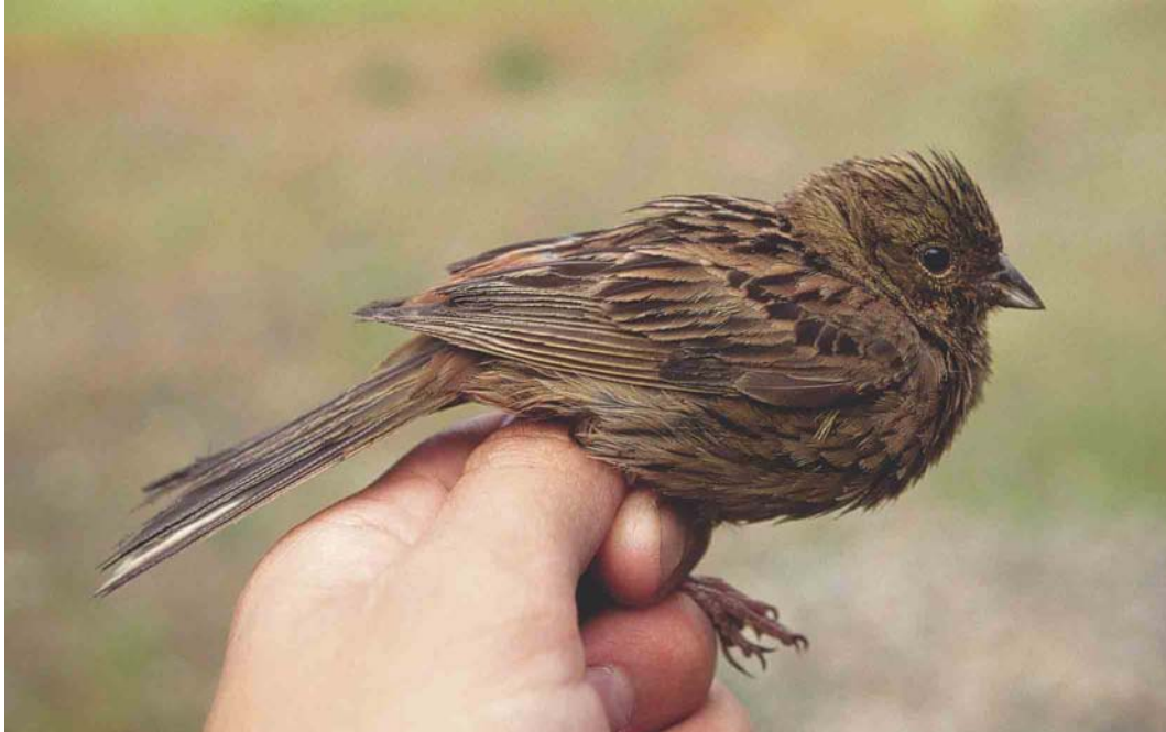
9 Yellowhammer / Geelgors Emberiza citrinella , first-winter female, Tauvo ringing station, Siikajoki, Finland, August 1991