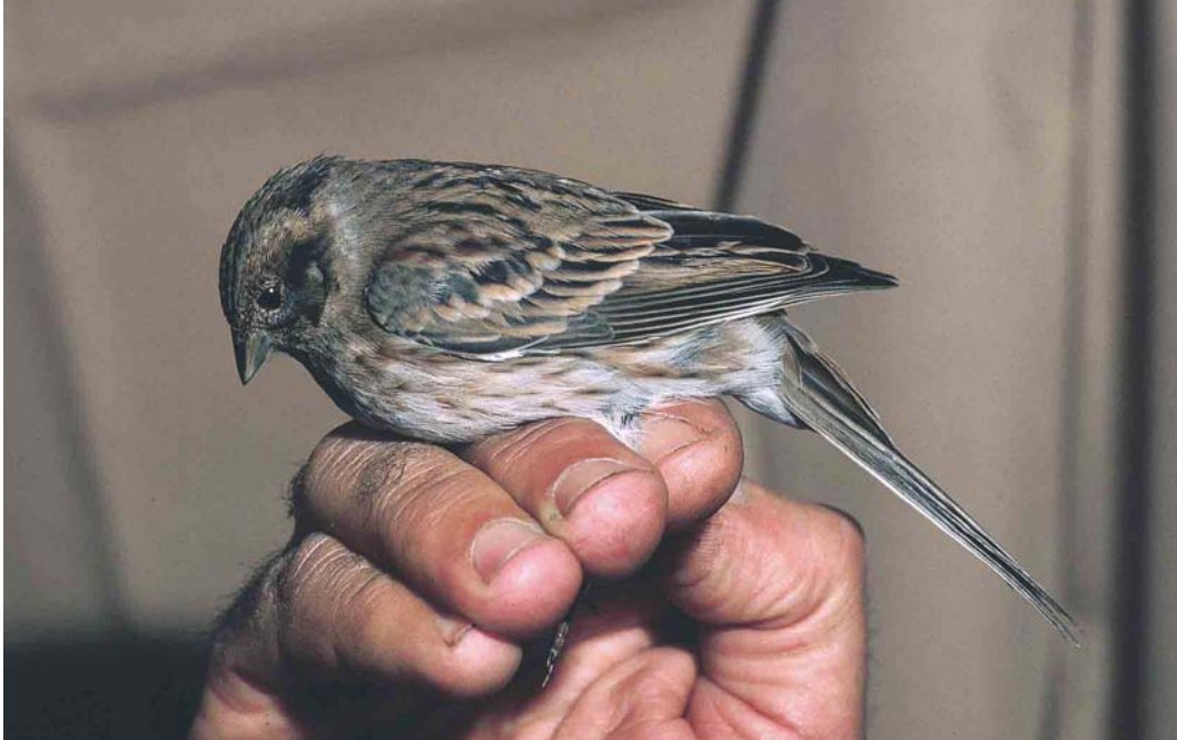
13 Pine Bunting / Witkopgors Emberiza leucocephalos , first-winter male, Westenschouwen, Zeeland, Netherlands (trapped on 19 October 1987), 29 October 1987