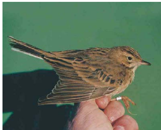
22-25 Mongoolse Pieper / Blyth's Pipit Anthus godlewskii , eerste-winter, 24 november 2002, Kennemerduinen, Bloemendaal, Noord-Holland 26-27 Grote Pieper / Richard's Pipit Anthus richardi , eerste-winter, 9 december 2002, Kennemerduinen, Bloemendaal, Noord-Holland