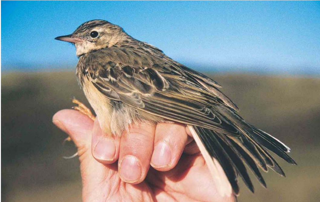
21 Mongoolse Pieper / Blyth's Pipit Anthus godlewskii , eerste-winter, 24 november 2002, Kennemerduinen, Bloemendaal, Noord-Holland

t4-6 postjuveniel (ruiscore 4); rechts t1 postjuveniel (ruiscore 4), t2-6 juveniel.