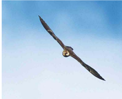
Mystery photograph II (September)

Tawny has a rather short hindclaw, at least much shorter than shown by the mystery bird.