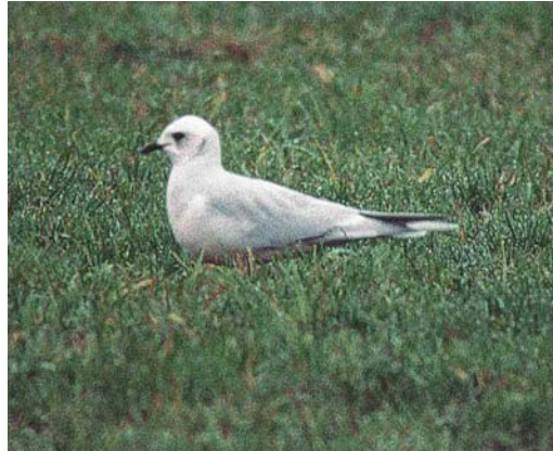
34 Forster's Tern / Forsters Stern Sterna forsteri , Belmullet Peninsula, Mayo, Ireland, 30 November 2002 (Paul Kelly) 35 Snowy Owl / Sneeuwuil Nyctea scandiaca , Belmullet Peninsula, Mayo, Ireland, 30 November 2002 (Paul Kelly) 36 Siberian Crane / Siberische Witte Kraanvogel Grus leucogeranus , juvenile, Mai Po, Hong Kong, China, 10 December 2002 (Yu Yat-tung) 37 Ross's Gull / Ross' Meeuw Rhodostethia rosea , Ulm, Baden-Württemberg, Germany, 6 December 2002 (Tobias Epple)

L. michahellis colour-ringed on Mendes island off north-eastern Spain in late May 2002 was subsequently seen at several sites in Noord-Holland, in early August (Hondsbossche Zeewering), October (Ijmuiden) and December (Amsterdam). The first Great Black-backed Gull L. marinus for Malta was an adult at Elmo on 31 December. An adult Kumlien's Gull L. glaucooides kumlieni was photographed at Glommen, Halland, Sweden, on 10 January. In Kerry, Ireland, a Ross's Gull Rhodostethia rosea was briefly seen on 21 November. An adult was present between Öpfingen and Griesingen near Ulm, Baden-Württemberg, Germany, on 5-6 December. In Wales, a first-winter Ivory Gull Pagophila eburnea was showing well at Blackpill, Swansea, South Wales, from 28 November to 5 December. Unseasonal Gull-billed Terns Gelochelidon nilotica were an adult and a first-winter at Lentini lake, Sicily, from 22 December. In the Netherlands, 13 Sandwich