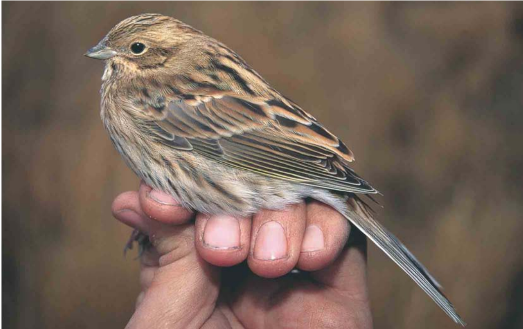
17 Hybrid Pine Bunting x Yellowhammer / Witkopgors x Geelgors Emberiza leucocephalos x citrinella , first-winter female, Lake Koybagar, Kostanay region, Kazakhstan, 1 October 2000 (Jari Peltomäki/Finnature). Same bird as in plate 15-16.

cilium is clearly wider and paler than in female Yellowhammer, especially on the lore. In adult female Pine Bunting, the ear-coverts are rather pale, buffy-white, with dark upper and lower borders, while in first-winter females they are generally darker and browner and contrast markedly with the pale supercilium, throat, and lores. In female Yellowhammer, the supercilium does not contrast with the rest of the head as it is darker and of the same colour as the lores and the ear-coverts, so that the head appears darker and more uniform than in Pine Bunting, especially in immatures. The pattern of the malar stripe is a distinctive but often overrated character. In Pine Bunting, there is generally a series of four to six dark streaks in the malar area, which are thicker in adult-winter and first-winter, but more contrasting and conspicuous in summer plumage. Yellowhammer normally shows three to four such streaks, which are not as well marked and less contrasting. This field mark is, however, rather variable and difficult to judge in the field, and there is some overlap. The sub-malar stripe is always wider and paler in Pine Bunting, regardless of age.