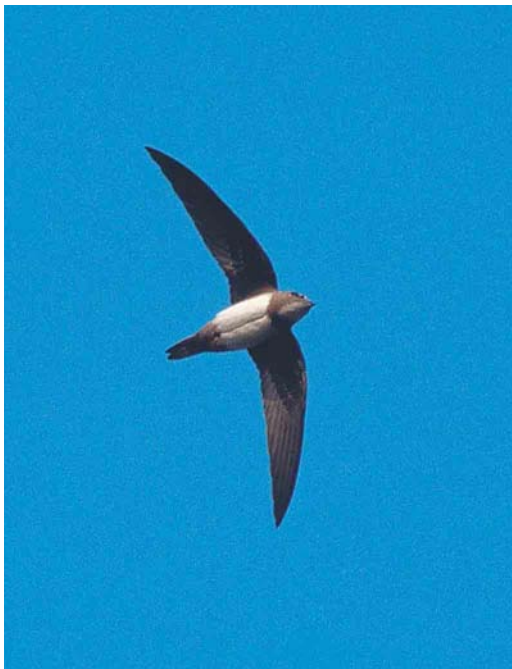
48 Alpengierzwaluw / Alpine Swift Apus melba , Wageningen, Gelderland, 17 november 2002 (Eric Koops)

gen, en op 18 december twee ten noorden van Eindhoven, Noord-Brabant. Er was een melding van een vrouwtje Koningseider Somateria spectabilis op 4 januari bij Vlissingen, Zeeland. Lang in het binnenland verblijvende Parelduikers Gavia arctica waren tot 9 november te zien bij Windesheim, Overijssel, en van 25 tot 31 december bij Sprang-Capelle, Noord-Brabant. Niet minder dan 12 Ijsduikers G immer werden waargenomen, waaronder vier langstrekking aan de kust en pleisterende van 2 november tot 2 december bij de Brouwersdam, Zuid-Holland, van 2 november tot 27 december ten oosten van Apeldoorn, Gelderland, en van 10 tot 26 december bij Zwolle, Overijssel. De laatste Grauwe Pijlstormvogels Puffinus griseus van het najaar vlogen op 7 november langs Westkapelle, Zeeland, en op 9 november langs Scheveningen, Zuid-Holland, en 10 langs Ameland, Friesland. Een uitzonderlijke waarneming betrof een late Vale Pijlstormvogel P mauretanicus op 8 december langs Langevelderslag, Zuid-Holland. Het Wilson's Stormvogeltje Oceanites oceanicus dat op 7 november langs Westkapelle vloog, betreft indien aanvaard de eerste voor Nederland. Tot 9 november werden ook nog vijf Vale Stormvogeltjes Oceanodroma leucorhoa gezien. Daarna werd er nog één dood gevonden op 19 december op het strand bij Vlissingen. Slechts een 10-tal waarnemingen van Kuifaalscholvers Stictocorba aristotelis sijpelde door. De Koereiger Bubulcus ibis van de Prunjepolder, Zeeland, hield het vol tot 7