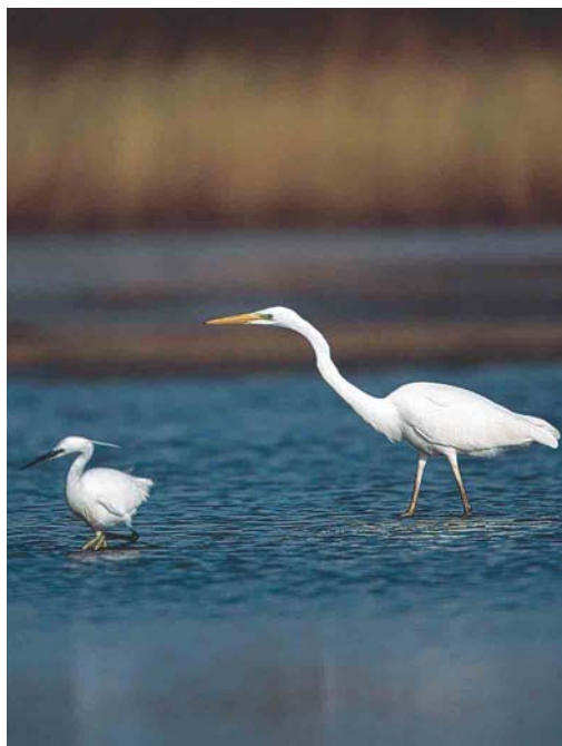
49 Grote Zilverreiger / Great Egret Casmerodius albus en Kleine Zilverreiger / Little Egret Egretta garzetta , Oostvoornse Meer, Zuid-Holland, 11 november 2002 (Jan van Holten)

Kleine Zilverreigers Egretta garzetta waren beduidend schaarser dan de vorige periode. Alleen in de Delta verbleven nog grote aantallen, met bijvoorbeeld op 10 december 43 rond het Veerse Meer, Zeeland, en op 11 december 12, waarvan twee overleden, op Dwars in de Weg in de Grevelingen, Zeeland. Ook werden 10-tallen Grote Zilverreigers Casmerodius albus gezien, met 10 of meer op de volgende locaties: in de Oostvaardersplassen, Flevoland, in de polders bij Mijdrecht, Utrecht, en in de polders ten noorden van Nuland, Noord-Brabant. Naast de eeuwig aanwezige Zwarte Ibis Plegadis falcinellus langs de Belkmerweg in Noord-Holland, waren er waarnemingen op 14 november bij Moergestel, Noord-Brabant, en op 6 december bij Nieuw Vennep, Noord-Holland. Uitzonderlijk was de melding van een Zwarte Wouw Milvus migrans op 31 december in de Wieringermeer, Noord-Holland. Vanaf eind november werd een 11-tal Rode Wouwen M milvus gezien. Er werden 11 Zeearenden Haliaeetus albicilla gezien, waaronder tweetallen op 23 november in de Oostvaardersplassen en op 31 december op de Korendijkse Slikken en een adulte van 5 tot 11 december rond het Drontermeer,