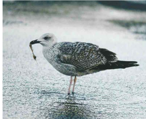
51 Geelpootmeeuw / Yellow-legged Gull Larus michahellis , Brouwersdam, Zeeland, 9 november 2002 (Rob van Bemmelen)

Holland. Er werden slechts 16 Kleine Alken Alle alle geteld. Papegaaiduikers Fratercula arctica vlogen op 6 en 7 november langs Westkapelle en op deze dagen ook twee respectievelijk één langs Camperduin, Noord-Holland, en op 9 november langs Ameland.