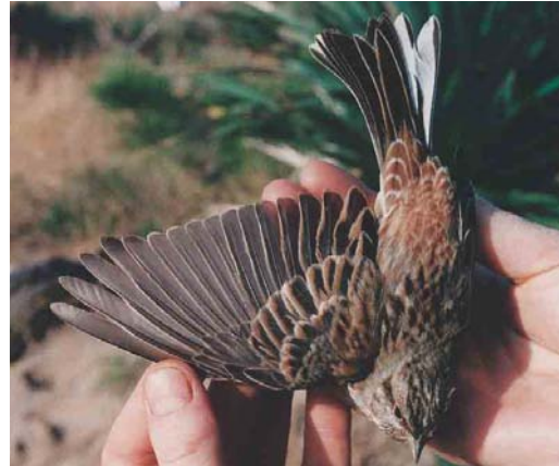
1 Pine Bunting / Witkopgors Emberiza leucocephalos , adult male, Duna di Migliarino, Toscana, Italy, 5 March 2000 ( Daniele Occhiato ). This individual shows a wide collar of dark grey spots. Note bright horn bill colour. 2 Pine Bunting / Witkopgors Emberiza leucocephalos , first-winter male, Duna di Migliarino, Toscana, Italy, December 1999 ( Daniele Occhiato ). 3 Pine Bunting / Witkopgors Emberiza leucocephalos , adult-winter male, Duna di Migliarino, Toscana, Italy, 17 December 1995 ( Roberto Gildi ). Note bright horn colour at basal corner of upper mandible, horn-coloured tones of lower mandible, conspicuous white borders to throat-feathers, and dark grey spots on white half-collar. 4 Pine Bunting / Witkopgors Emberiza leucocephalos , first-winter male, Duna di Migliarino, Toscana, Italy, December 1995 ( Emiliano Arcamone ). Note worn juvenile tertials, pointed tail-feathers, juvenile primary coverts, grey-brown lesser coverts and heavily streaked crown with only a hint of white median stripe.

ments. Hybrids present a further problem. Below, I briefly list the characters that can be used to separate female Pine Bunting from female Yellowhammer (first-winter birds and those with reduced yellow pigments), indicating which of these characters are age related.