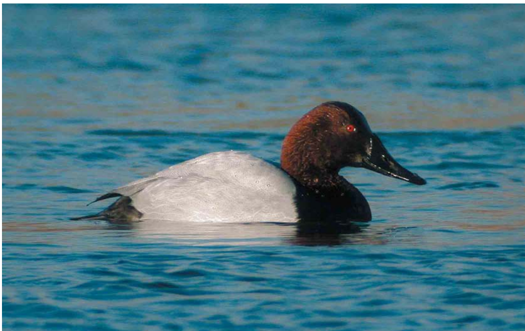
61 Grote Tafeleend / Canvasback Aythya valisineria , mannetje, Castricum, Noord-Holland, 10 januari 2003