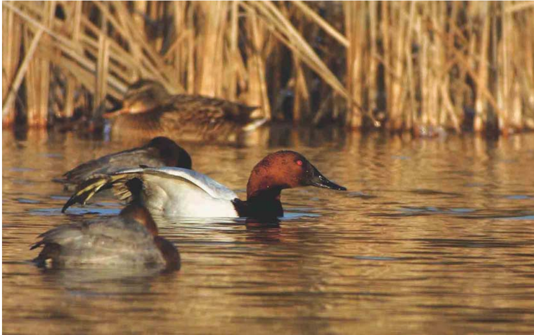
60 Grote Tafeleend / Canvasback Aythya valisineria , mannetje, Castricum, Noord-Holland, 9 januari 2003 (Phil Koken)