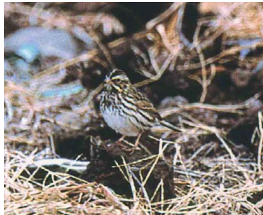
38-39 Oriental Turtle Dove / Oosterse Tortel Streptopelia orientalis , first-winter, Stromness, Orkney, Scotland, 6 December 2002 (Chris Batty) 40 Azure Tit / Azuurmees Parus cyanus , Masugnsbyn, Torne Lappmark, Sweden, 10 December 2002 (Michael Bergman) 41 Savannah Sparrow / Savannahgors Passerculus sandwichensis , Fajagrande, Flores, Azores, 31 October 2002 (Kris De Rouck) cf Dutch Birding 24: 381, 2002

Another at Litvatnet, Sør-Trøndelag, Norway, was last seen on 1 January. The first Oriental Turtle Dove S. orientalis meena for Britain since 1975 was a first-winter at Stromness, Orkney, from late November until 26 December. If accepted, a nominate Oriental Turtle Dove S. o. orientalis at Eilat on 2 November will be the sixth for Israel and the third this autumn. Also in Israel, at least 12 Striated Scops Owls Otus brucei were found during December, in remote wadis over the southern Arava and Eilat mountains. In Ireland, an adult male Snowy Owl Nyctea scandiaca took residence at Belmullet Peninsula, Mayo, from 23 November through December. From the second week of December onwards, a Northern Hawk Owl Surnia ulula visited Bialowieza, Poland. The latest ever Pallid Swifts Apus pallidus for Britain were at Exe Estuary, Devon, and at Christchurch, Dorset, on 22 November and in Kent on 29 November. The first Alpine Swift A. melba