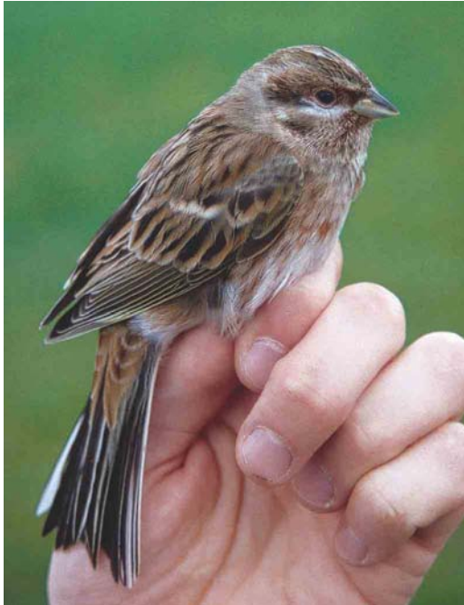
18 Hybrid Pine Bunting x Yellowhammer / Witkopgors x Geelgors Emberiza leucocephalos x citrinella , male, Hodne, Klepp, Rogaland, Norway, 9 November 2000 (Martin Eggen). Very like Pine Bunting, but note yellowish edges to primaries, indicative of hybrid origin.

always) shows a white half-collar on the upper breast, similar to that of the male. Female Yellowhammer sometimes also shows this half-collar but it is always much less conspicuous. In winter plumage, female Pine Bunting has lost most of its reddish tones (although close views reveal that some remain); the necklace of blackish-brown spots remains conspicuous and distinctive, while the whitish half-collar is much less evident and can be completely lacking. In first-winter female, the underparts are heavily streaked/spotted with dark brown and black on a whitish background, which becomes buffy towards the flank, and the dark necklace on the upper breast contrasts much less. The background colour is, however, always white or whitish, while Yellowhammer always shows some pale yellow tones, especially on the lower belly. The undertail is usually heavily streaked in female Yellowhammer. In female Pine Bunting, it is only weakly streaked (thinner and paler streaks), and the streaking can be absent altogether (although it is usually more evident in first-winters).