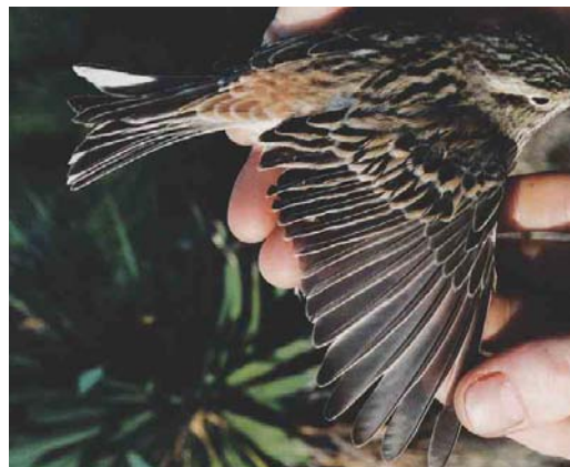
5 Pine Bunting / Witkopgors Emberiza leucocephalos , first-winter male, Duna di Migliarino, Toscana, Italy, 17 December 1995 ( Roberto Gildi ). Note heavy dark grey-brown streaking on underparts, and conspicuous dark spots on upper breast. 6 Pine Bunting / Witkopgors Emberiza leucocephalos , first-winter female, Katwijk, Zuid-Holland, Netherlands, 25 November 1996 ( René van Rossum ) 7 Pine Bunting / Witkopgors Emberiza leucocephalos , adult-winter female, Duna di Principina, Toscana, Italy, January 2001 ( Daniele Occhiato ). Note typical pale nape spot bordered by two dark stripes, and streaked crown with paler median stripe. 8 Pine Bunting / Witkopgors Emberiza leucocephalos , first-winter female, Duna di Migliarino, Toscana, Italy, December 1995 ( Emiliano Arcamone ). Note uniformly streaked crown, brown cheeks and ear-coverts contrasting with the whitish supercilium, pointed tail-feathers, worn juvenile tertials, juvenile primary coverts and grey-brown lesser coverts.

Bunting is strikingly different from that of Yellowhammer, more contrasting and totally lacking yellow pigments. There are often reddish tones to the supercilium and throat. Pine Bunting's crown shows finer, neater dark streaking; these streaks are usually more evident on the sides of the crown, while on the centre the streaks are thinner and less conspicuous, on a paler background. The pattern is thus similar to that of males. In adult-winter female, the median crown-stripe is generally more streaked and less