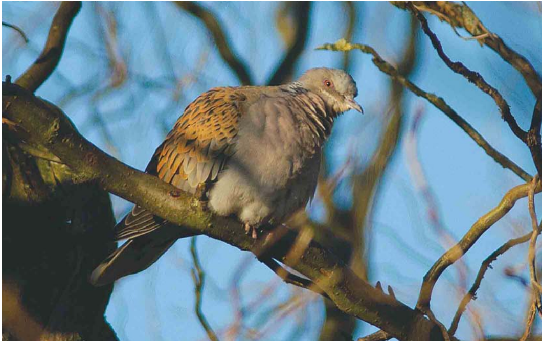
53 Zomertortel / European Turtle Dove Streptopelia turtur , Julianadorp, Noord-Holland, 9 december 2002 (René Pop)