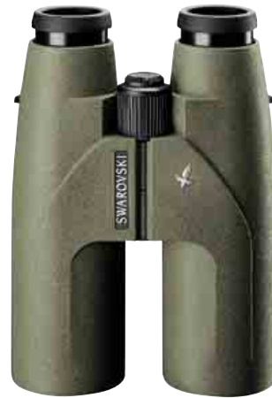
Swarovski SLC 10x50 WB binoculars

For each round, only one entry per person is