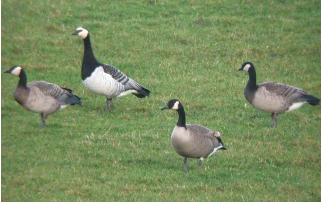
32 Intermediate Canada Goose / Middelste Canadese Gans Branta canadensis parvipes , with Barnacle Goose / Brandgans B leucopsis and hybrids Intermediate Canada x Barnacle Goose, Islay, Argyll, Scotland, November 2002 (Chris Batty)