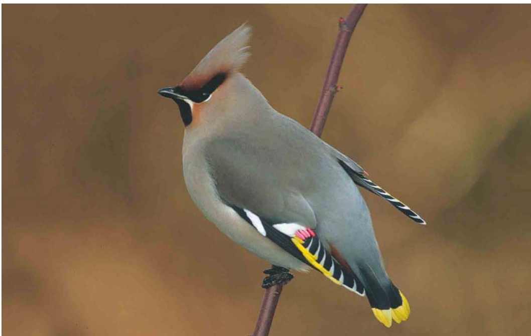
146 Pestvogel / Bohemian Waxwing Bombycilla garrulus , Noordwijk, Zuid-Holland, 10 januari 2003 (René van Rossum)