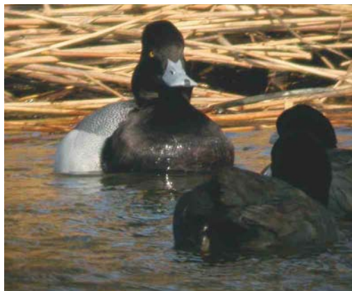
153 Kleine Topper / Lesser Scaup Aythya affinis , adult mannetje, Scheelhoek, Zuid-Holland, 19 februari 2003

De volgende dagen bleek de vogel het beste vroeg in de ochtend of in de late middag waargenomen te kunnen worden bij het uit- of invliegen van zijn slaapplek. Op 4 maart werd hij door twee doortastende Belgische vogelaars midden op de dag teruggevonden op een met wilgen begroeide plas bij Hermalle-sous-Argenteau bij Visé, Liège, België, c 8 km ten zuiden van de Eijsder Beemden, en kon daar door verschillende Belgische twitchers worden bewonderd. Op 5 maart herhaalde dit patroon zich; gedurende de dag ontstond er nog enige tijd twijfel omtrent de determinatie en