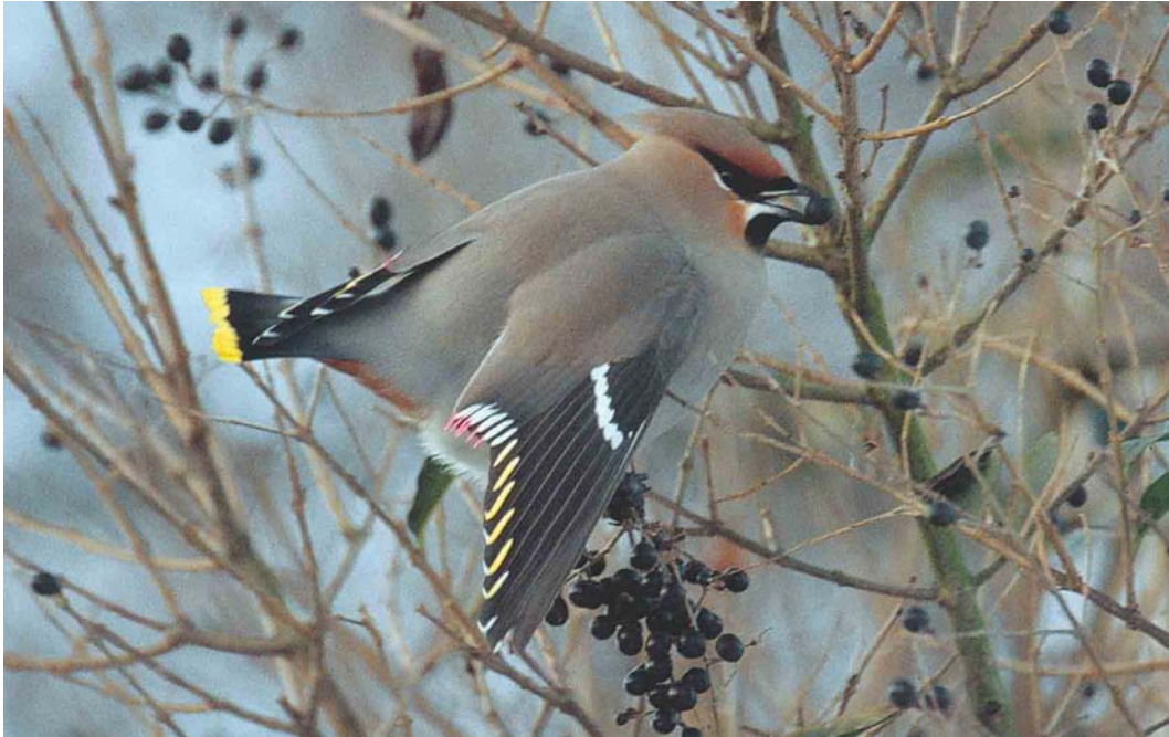
145 Pestvogel / Bohemian Waxwing Bombycilla garrulus , Noordwijk, Zuid-Holland, januari 2003