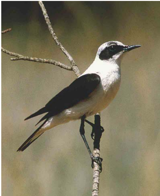
68 Western Black-eared Wheatear / Westelijke Blonde Tapuit Oenanthe hispanica , adult male, Valladolid, Spain, July 1999 ( Alejandro Torés Sánchez ). A very white hispanica , although this is partly due to the late date (early July). It certainly recalls a melanoleuca with a rather 'deep' ear-coverts patch and greyish crown and nape contrasting with the white mantle. Note, however, the untypical distribution of grey – which in melanoleuca normally is concentrated to the centre of the crown and nape, leaving a broad, white 'supercilium'. Small amount of black on lores and particularly forehead confirms that this is a hispanica . 69 Western Black-eared Wheatear / Westelijke Blonde Tapuit Oenanthe hispanica , immature male, Spain, May 1988 ( Lluís Gustamante ). Fresh black wing-coverts in contrast with worn, brownish remiges show this bird to be a second-year male. Restricted amount of black above bill and lores typical for hispanica but not impossible for immature melanoleuca . However, throat-bib very small (nearly 'half-bib' type) and uniform pale ochre upperparts typical for male hispanica (of any age) but not good for immature melanoleuca . Also note that the new coverts are jet black, typical for hispanica .