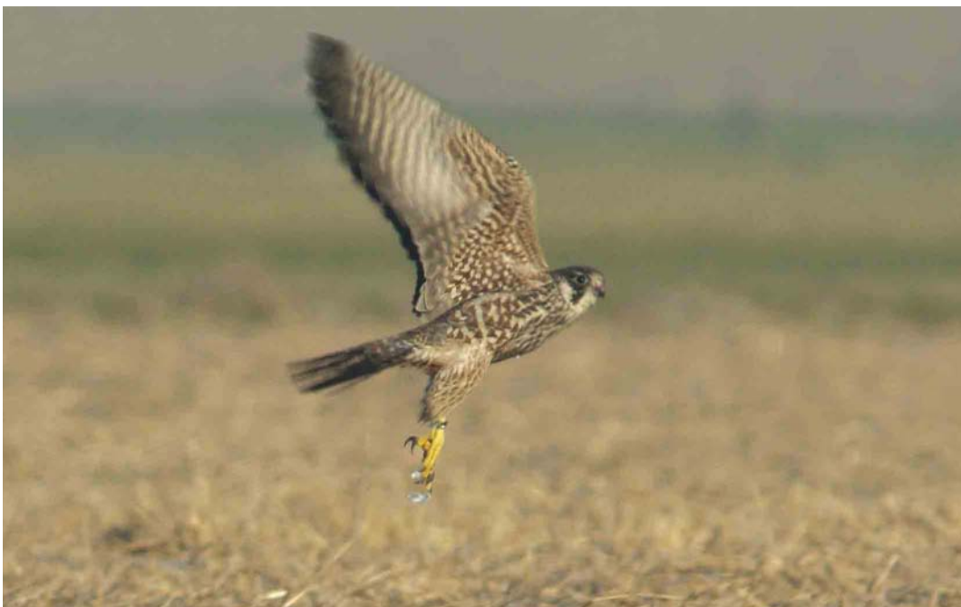
144 Slechtvalk / Peregrine Falcon Falco peregrinus , Julianadorp, Noord-Holland, 18 februari 2003