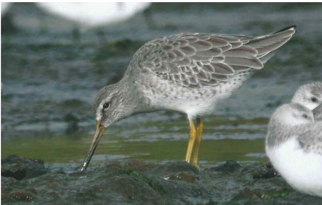
105 Short-billed Dowitcher / Kleine Grijsze Snip Limnodromus griseus , adult-winter, Cabo da Praia, Terceira, Azores, November 2003 (Magne Pettersen)