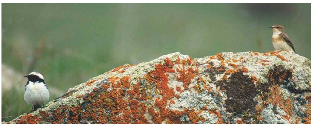
102 Pied Wheatears / Bonte Tapuiten Oenanthe pleschanka , Chokpak pass, Kazakhstan, April 2002 (Arend Wassink). Pale-throated ('vittata') morph female (right); same bird as in plate 99-101. This female was paired with a 'normal' male Pied Wheatear (left).

Observers should be aware that a number of 'vittata' females can look extremely similar to pale-throated and plain-faced melanoleuca females. Such 'vittata' females have also been recorded in the eastern part of the breeding range of pleschanka , for instance in western China (Hadoram Shirihai in litt), where melanoleuca is not present and, if reliably recorded, would be a true vagrant. In the field, they cannot be safely distinguished from melanoleuca . Even in the hand, the identification is difficult because of the large overlap in measurements (cf plate 99-102). The only reliable difference in the hand is the colouration of the basis to the throat-feathers, dark grey in 'vittata' and whitish in melanoleuca .