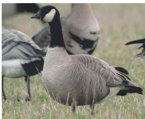
125 Siberische Tjiftjaf / Siberian Chiffchaff Phylloscopus collybita tristis , Lauwersoog, Groningen, 17 november 2003 (Oane Tol) 126 Vermoedelijke Westelijke Orpheusgrasmus / presumed Western Orphean Warbler Sylvia hortensis , Middelburg, Zeeland, 1 november 2003 (Bas van den Boogaard) 127 Bronskopeend / Falcated Duck Anas falcata , mannetje, Zurich, Friesland, 3 januari 2004 (Rob Versteeg) 128 Witkopeend / White-headed Duck Oxyura leucocephala , eerstejaars, Dijkwater, Zeeland, 21 november 2003 (Marten van Dijl) 129 Stormvogeltje / European Storm-petrel Hydrobates pelagicus (dood gevonden bij Langevelderslag, Zuid-Holland, op 13 december 2003), Amsterdam, Noord-Holland, 29 december 2003 (Vincent van der Spek) 130 Hutchins' Canadese Gans / Hutchins's Canada Goose Branta hutchinsii hutchinsii , Doniaburen, Friesland, 29 december 2003 (Leo J R Boon/Cursorius)