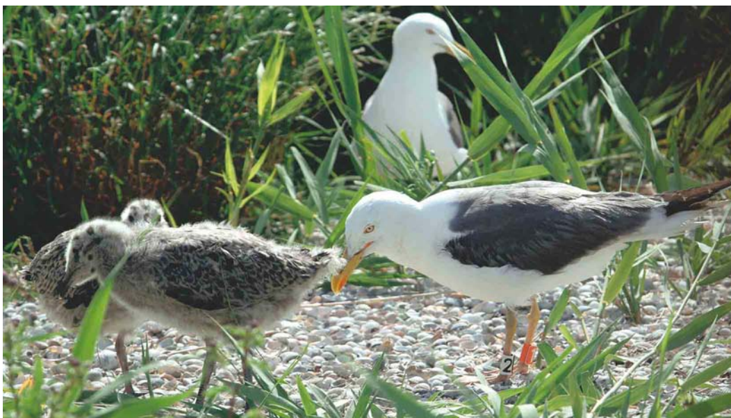
96 Hybride geelpootmeeuw / hybrid yellow-legged gull Larus , negen jaar oud, geslacht onbekend (wit 2 / rood 1), nazaat van 'stammoeder' in plaat 90 (wit = / rood 9), Holendrecht, Amsterdam, Noord-Holland, 25 juni 2003 (Martijn de Jonge). Zelfde vogel als in plaat 94-95.

ringen en Martijn de Jonge voor het ter beschikking stellen van fotomateriaal en informatie over de hybride bij Holendrecht.