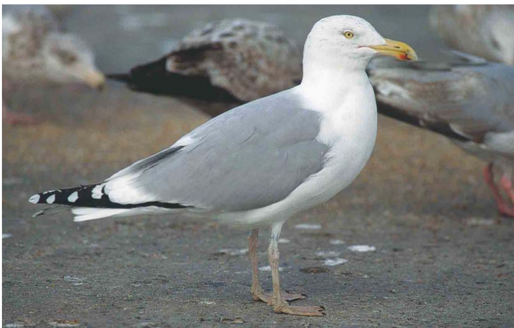
85 American Herring Gull / Amerikaanse Zilvermeeuw Larus smithsonianus , adult or near-adult, Boston, Massachusetts, USA, February 1999