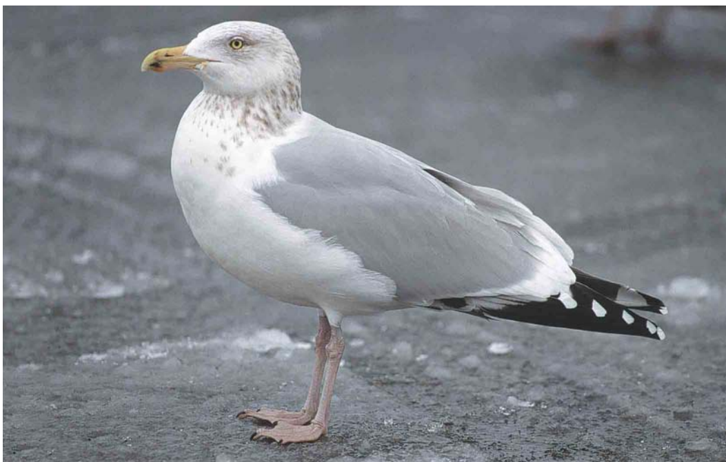
84 American Herring Gull / Amerikaanse Zilvermeeuw Larus smithsonianus , near-adult, Boston, Massachusetts, USA, January 2001 ( Pat Lonergan ). Note very well-defined, solid-black centre to primary coverts.