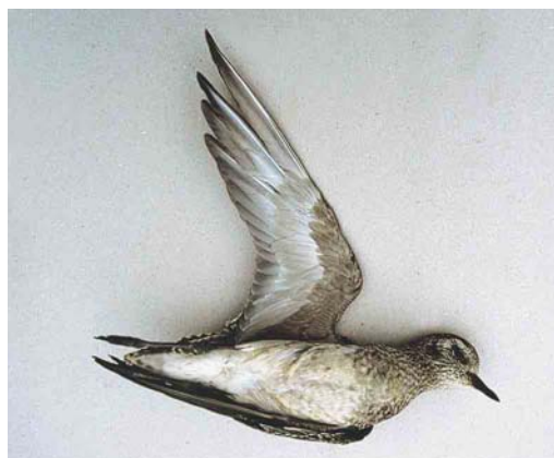
146-147 Amerikaanse Goudplevier / American Golden Plover Pluvialis dominica , eerste-winter, Hindeloopen, Friesland, 8 december 2003 (Joop Jukema)

bovendelen met mantel, rug, en schouderveren waren zwart met kleine vuilwitte stippen en met enkele gele stipjes. De kop was donker met contrasterende witgrijze wenkbrauwstreep. De volgende biometrische gegevens zijn verzameld: vleugellengte 187 mm, tarsuslengte 41.1 mm, snavelengte 22.1 mm, lengte van snavel en kop 57.5 mm, handpenprojectie 6/7 en gewicht 155 g.