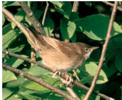
103 Savi's Warbler / Snor Locustella luscinioides , Zürich, Zürich, Switzerland, 2 September 2003 (Jan Bisschop)

XII This mystery photograph shows a rather uniformly reddish-brown coloured bird perching in a tree and preening its rump and undertail-coverts. The unstreaked head, back and rump, slightly streaked undertail-coverts, pinkish legs, uniformly coloured upperwing and especially the smoothly curved wing-edge (straight in Acrocephalus warblers) point towards one of the unstreaked Locustella warblers. Three species of unstreaked Locustella warbler occur in the Western Palearctic, of which one is only a rare vagrant in Western Europe. This is Gray's Grasshopper Warbler L. fasciolata which has been recorded on Ouessant, Finistère, France (September 1913 and September 1933, both L. f. fasciolata and the Sakhalin taxon L. f. amnicola which is often regarded as specifically distinct) and in Denmark (September 1955). The two more regularly occurring species are River Warbler L. fluviatilis and Savi's Warbler L. luscinioides . Gray's Grasshopper Warbler is a very large bird, as large as Great Reed Warbler A. arundinaceus , and should show warm brownish-buff almost plain undertail-coverts. Although the tail of the mystery bird