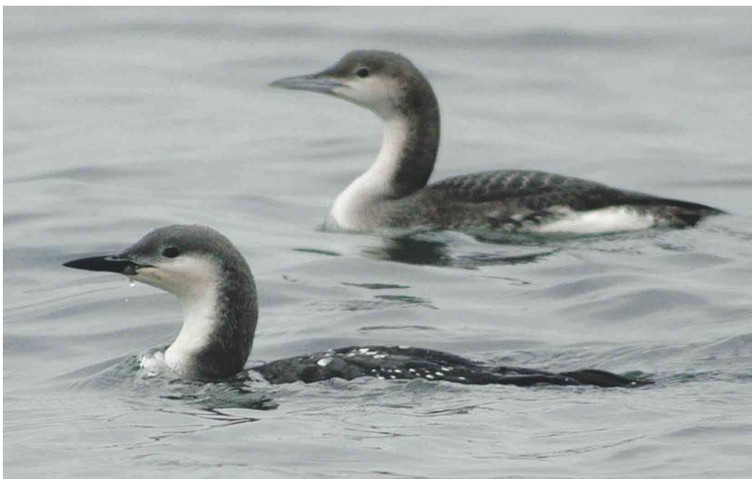
124 Parelduikers / Black-throated Loons Gavia arctica , adult (voor) en juveniel, Brouwersdam, Zeeland, 23 november 2003

sprong (voornamelijk Brandgans B leucopsis x Kleinste Canadese Gans). Er werden c 16 Roodhalsganzen B ruficollis , acht Witbuikrotganzen B hrota en vier Zwarte Rotganzen B nigricans gemeld. Bij het Wagejot op Texel werd vanaf 26 december een Witbuikrotgans gepaard met een Rotgans B bernicla en drie hybride jongen gezien. Een paar Rotgans en Zwarte Rotgans bij Oosterland op Wieringen, Noord-Holland, had één hybride jong. In de Haagse Waterleidingduinen, Zuid-Holland, werden op 3 december niet minder dan 27 Krooneenden Netta rufina geteld. Witoogeenden Aythya nyroca werden gezien tot 6 november bij Naarden, Noord-Holland, op 1 november op de Berkel bij Lochem, Gelderland, en bij De Blocq van Kuffeler, Flevoland, van 14 tot 16 november een mannetje en op 6 december een vrouwtje in de Botshol, Utrecht, vanaf 23 november op de plas Aquabest bij Eindhoven, Noord-Brabant, met op 10 december hier zelfs twee, op 7 en 31 december bij Heel, Limburg, en op 10 en 11 december bij Alphen aan den Rijn, Zuid-Holland. Een eerstejaars Witkopeend Oxyura leucocephala verbleef van 20 tot 23 november op het Dijkwater bij Sirjansland, Zeeland, en op 24 en 25 november werd naar wordt aangenomen dezelfde vogel gezien in de Prunjepolder, Zeeland. Een – mogelijk eerste-winter – mannetje Bronskopeend Anas falcata werd vanaf 23 december onregelmatig binnen- en buitendijks waargenomen ten zuiden van Harlingen, Friesland. Een mannetje Amerikaanse Smient A americana pleisterde van