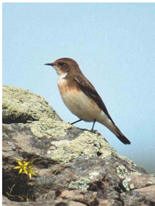
99-101 Pied Wheatear / Bonte Tapuit Oenanthe pleschanka , pale-throated ('vittata') morph, female, Chokpak pass, Kazakhstan, April 2002 (Arend Wassink). Combination of upperparts colour, very pale throat without any dusky colouration, orangy-brown breast-band and brownish smudge on breast-sides makes this bird look extremely similar to a number of female Eastern Black-eared Wheatears O melanoleuca and these birds may not be identifiable with certainty. This bird was paired with a 'normal' male Pied Wheatear (see plate 102).