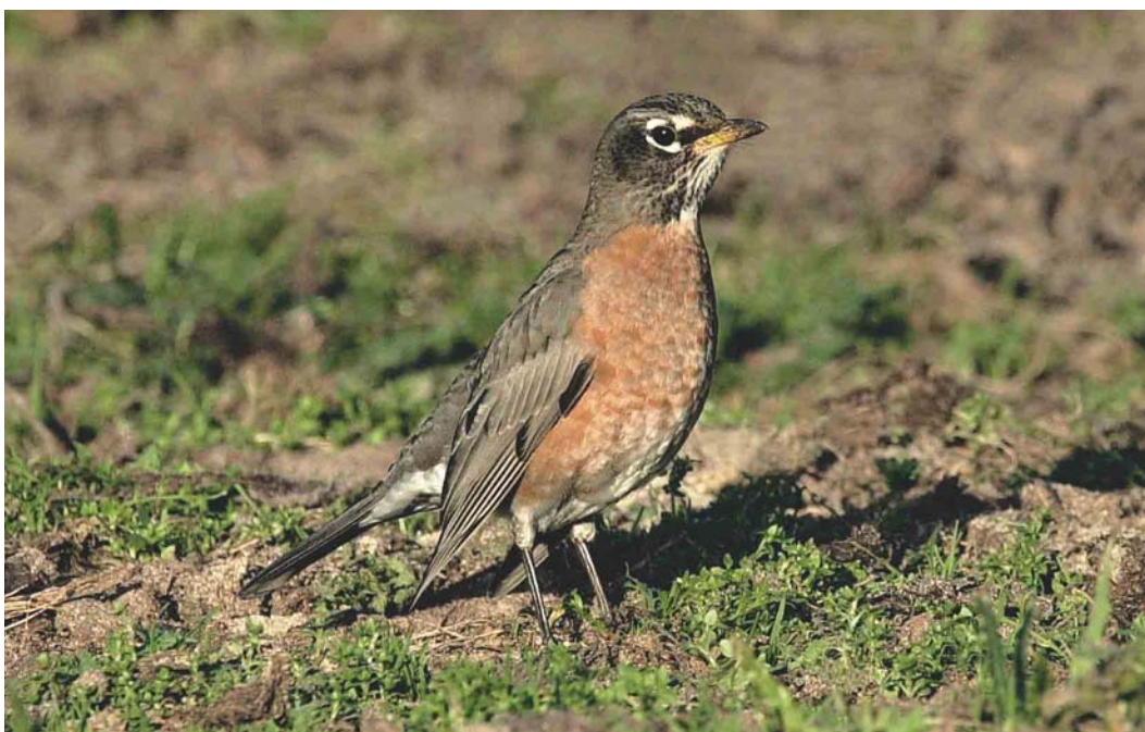
117 American Robin / Roodborstlijster Turdus migratorius , Godrevy Point, Cornwall, England, 16 December 2003 (Mike Malpass)