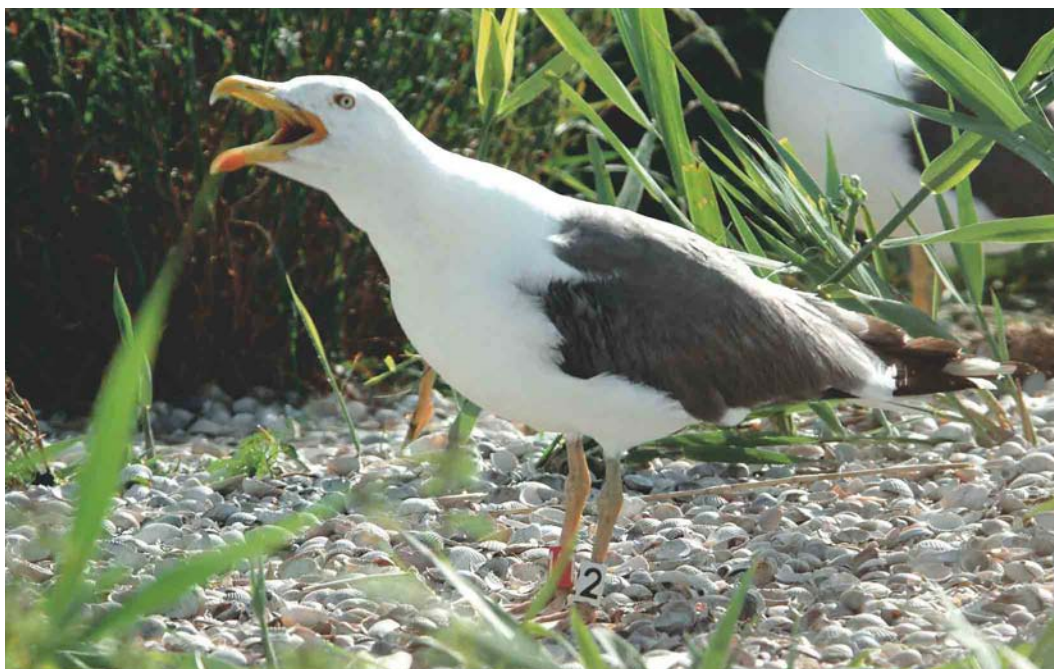
94-95 Hybride geelpootmeeuw / hybrid yellow-legged gull Larus , negen jaar oud, geslacht onbekend (wit 2 / rood 1), nazaat van 'stammoeder' in plaat 90 (wit = / rood 9), Holendrecht, Amsterdam, Noord-Holland, 25 juni 2003 (Martijn de Jonge). Vogel lijkt op 'forse' Kleine Mantelmeeuw L. fuscus graellsii ; kleur van bovendelen lijkt iets te donker voor Geelpootmeeuw L. michahellis .

Geelpootmeeuwcomplex van IJmuiden: in hoeverre zijn geelpootmeeuwen echte Geelpootmeeuwen?