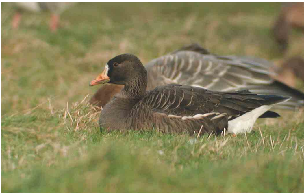
135 Groenlandse Kolgans / Greenland White-fronted Goose Anser albifrons flavirostris , juveniel, Uitkerke, West-Vlaanderen, 22 december 2003

bergen, Oost-Vlaanderen, en van 19 tot 23 december was een tweede te zien in de Bourgoyen bij Gent, Oost-Vlaanderen. In november werden in totaal negen en in december zes Krooneenden Netta rufina gemeld. Het mannetje Ringsnaveleend Aythya collaris dat op 16 en 31 december werd gezien op de Meerdamplas in Dendermonde, Oost-Vlaanderen, was wellicht dezelfde vogel die eerder verbleef bij Waasmunster, Oost-Vlaanderen. De vogel van Blokkersdijk, Antwerpen, keerde na 13 jaar niet meer terug. Witoogeenden A nyroca werden gezien in Harelbeke en bij Maaseik, Limburg, op 1 november; te Lier-Duffel vanaf 9 november; in Boorseme, Limburg, op 11 november; in Zevegem, Oost-Vlaanderen, op 4 december; in Brecht (twee van dubieuze origine vanaf 10 december); en in Boom-Niel, Antwerpen, van 13 tot 19 december. Van 1 tot 10 november verbleef een Ijseend Clangula hyemalis op de Skiput in De Pinte, Oost-Vlaanderen, en op 25 december één bij Pommeroeul, Hainaut; op 29 december trok er één langs Oostende, West-Vlaanderen. Een mannetje Brilzee-eend Melanitta perspicillata zwom op 5 december weer op zee voor Oostduinkerke, West-Vlaanderen. Enkele goede trekdagen in Oostende resulteerden in 286 kleine duikers Gavia stellata/arctica op 27 en 398 op 29 december. Parelduikers G arctica werden gezien bij De Panne, West-Vlaanderen (32, met 14 op 29 december); Heist, West-Vlaanderen (twee); Hensies, Hainaut; Kruikebe, Oost-Vlaanderen; op het Lac de la Plate-Taille; in Lier;