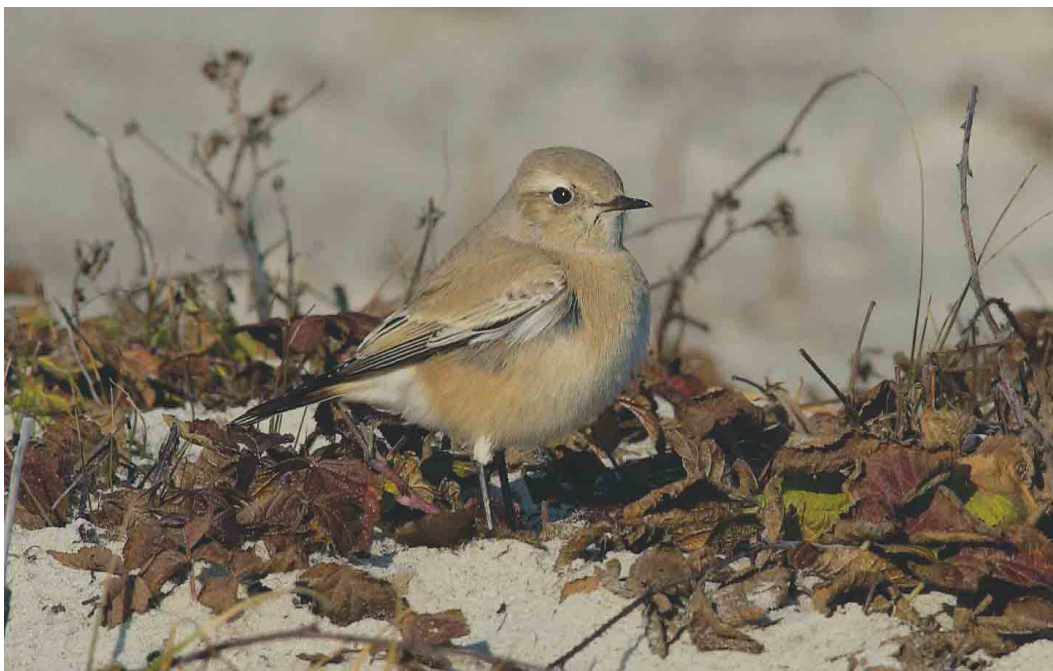
113 Desert Wheatear / Woestijntapuit Oenanthe deserti , female, De Cocksdorp, Texel, Noord-Holland, Netherlands, 9 November 2003 (René Pop)