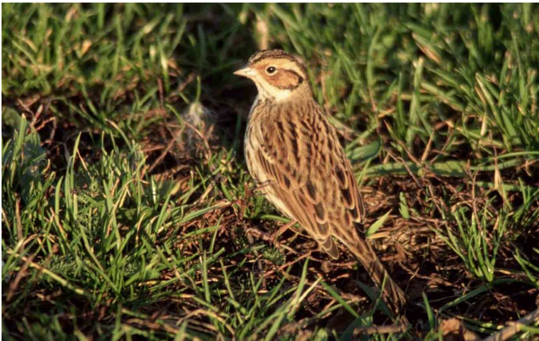
139 Dwerggors / Little Bunting Emberiza pusilla , eerste-winter, Nieuwpoort, West-Vlaanderen, 8 december 2003