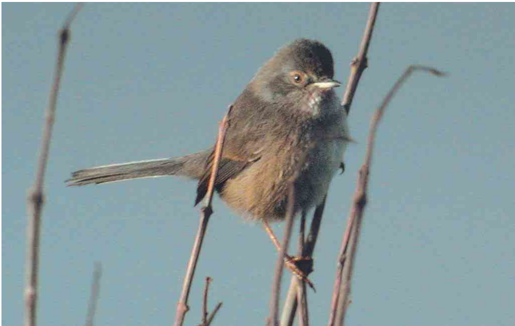
138 Provençaalse Grasmus / Dartford Warbler Sylvia undata , eerste-winter, Blankenberge, West-Vlaanderen, 9 december 2003 (Koen Verbanck)