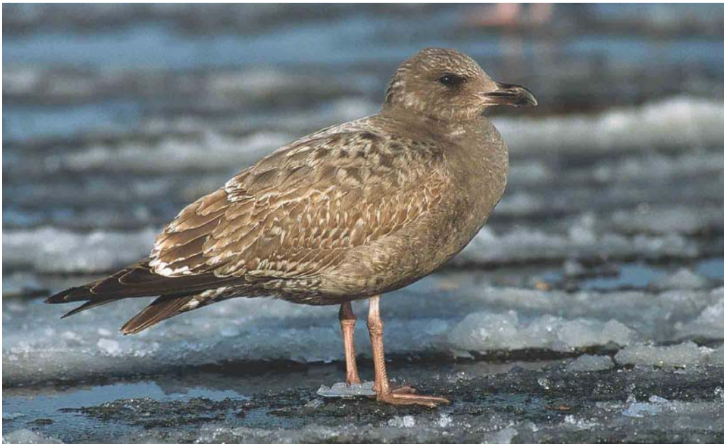
38 American Herring Gull / Amerikaanse Zilvermeeuw Larus smithsonianus , first-winter, Boston, Massachusetts, USA, January 2001. Very dark-headed bird. Note rather 'plain' rear-most (second generation) scapulars; also that one inner median covert has been moulted. 39 American Herring Gull / Amerikaanse Zilvermeeuw Larus smithsonianus , first-winter, Boston, Massachusetts, USA, January 2001. Not particularly pale-headed individual but note very solid-dark colouration on lower hindneck, mantle and underparts.