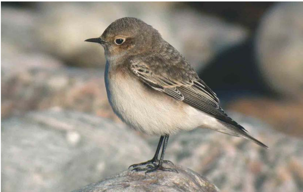
115 Pied Wheatear / Bonte Tapuit Oenanthe pleschanka , first-winter male, Falkenberg, Halland, Sweden, December 2003 (Mikael Nord)