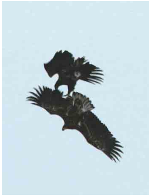
131 Taigaboomkruiper / Eurasian Treecreeper Certhia familiaris , Makkum, Friesland, 26 december 2003 132 Zeearenden / White-tailed Eagles Haliaeetus albicilla , Vossemeer, Flevoland, 15 november 2003 133 Woestijntapuit / Desert Wheatear Oenanthe deserti , vrouwtje, De Cocksdorp, Texel, Noord-Holland, 9 november 2003