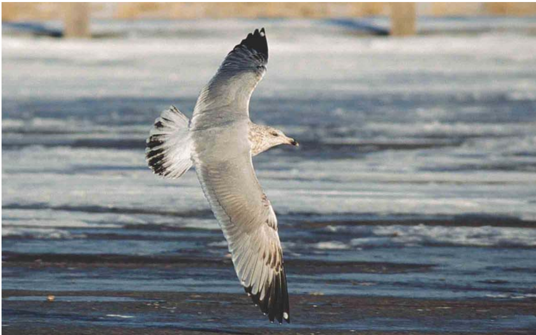
70 American Herring Gull / Amerikaanse Zilvermeeuw Larus smithsonianus , third-winter, Boston, Massachusetts, USA, January 2001 ( Pat Lonergan ). Rather advanced individual in some respects with unmarked adult-like secondaries. Note that tail is still rather heavily marked.