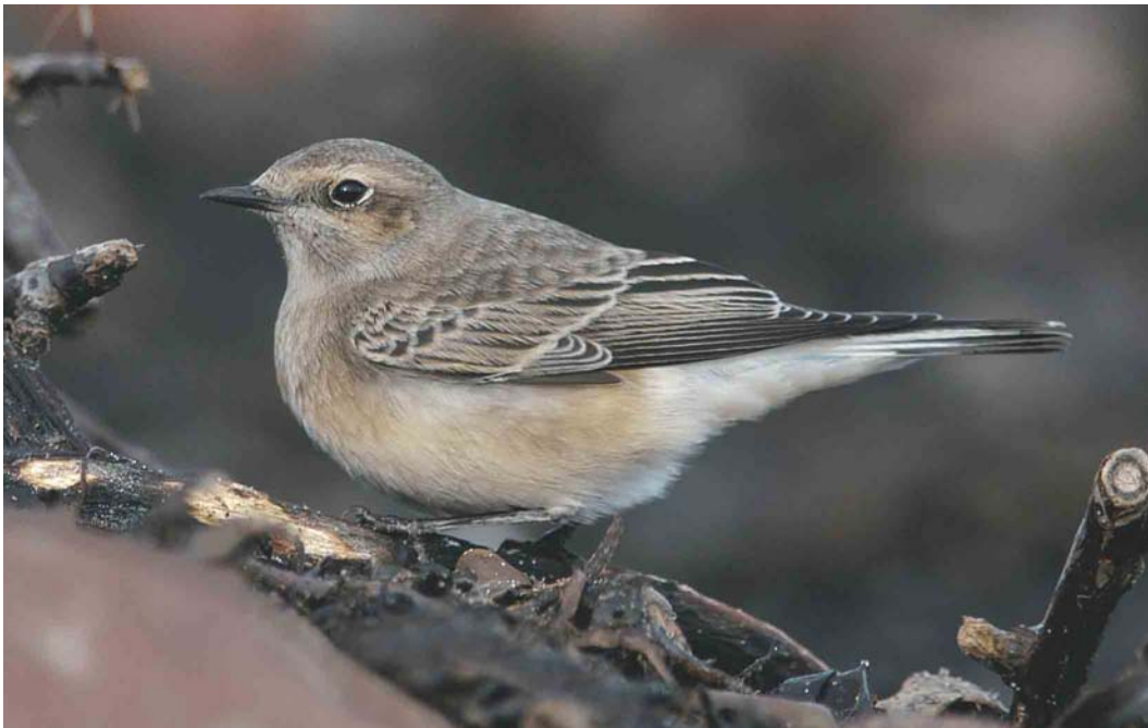
114 Pied Wheatear / Bonte Tapuit Oenanthe pleschanka , male, Helgoland, Schleswig-Holstein, Germany, November 2003