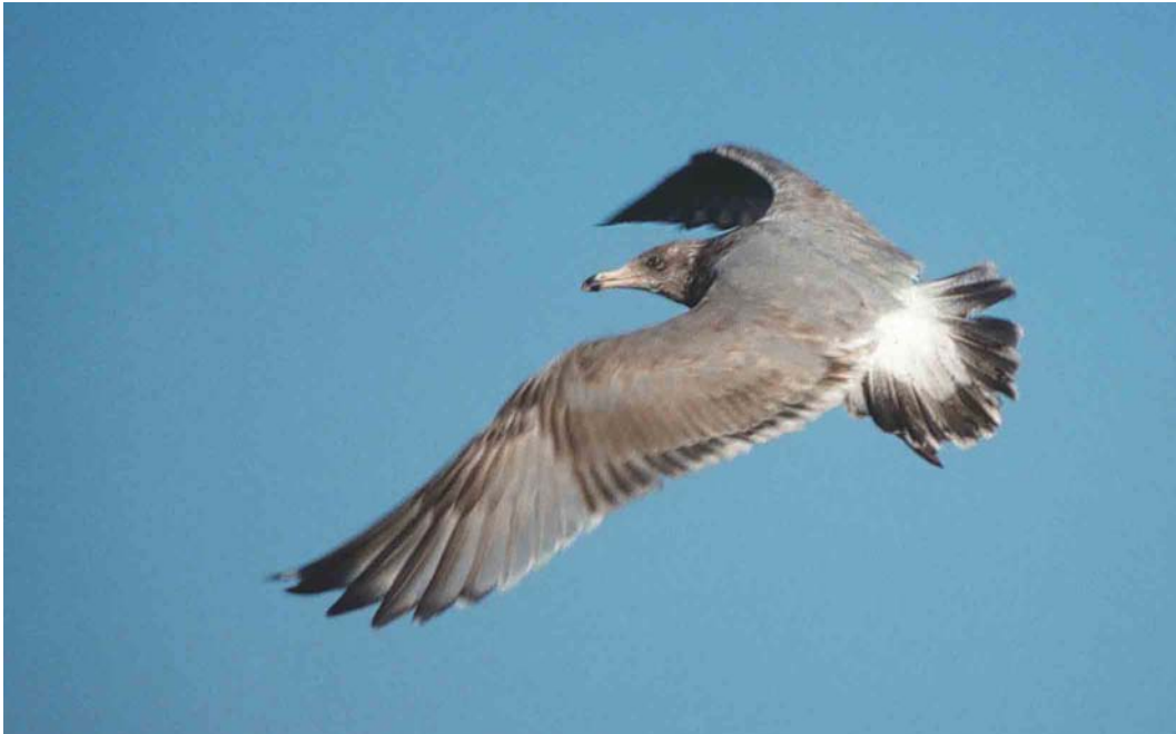
69 American Herring Gull / Amerikaanse Zilvermeeuw Larus smithsonianus , third-winter, Boston, Massachusetts, USA, January 1999. Note dark marks on secondaries and extensive dark in tail.