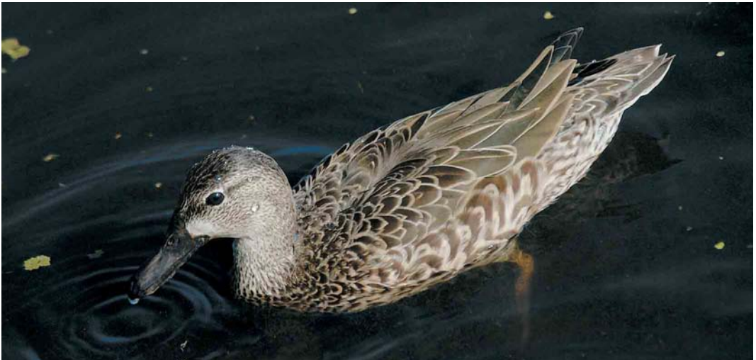
317 Blue-winged Teal / Blauwvleugeltaling Anas discors , Wakodahatchee, Palm Beach, Florida, USA, 18 February 2005

In other dabbling duck species, only Gadwall A strepera , Blue-winged Teal A discors and Baikal Teal A formosa show yellowish legs. Female Gadwall can be eliminated as this species would show extensive pale markings on the scapulars, forming dark U-shaped bars reminiscent of the flank-feathers, and grey-centred tertials. The absence of a white streak at the base of the tail in the mystery bird is another clue to eliminate Gadwall. In Baikal Teal, this pale patch should also be present. In addition, an important difference between Baikal and Blue-winged Teal