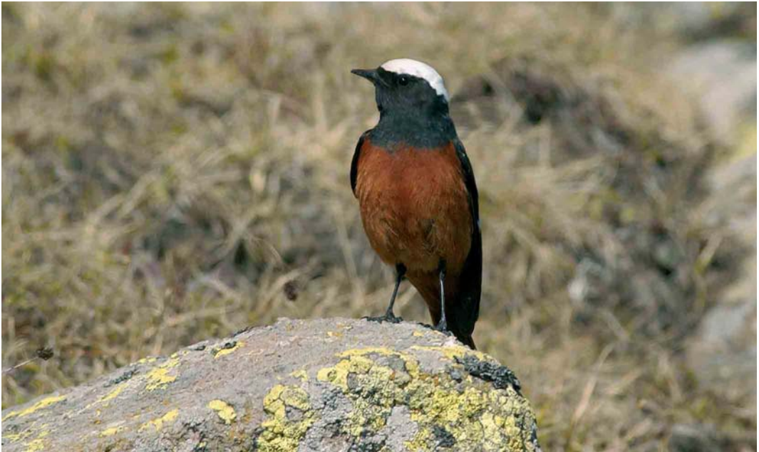
299 Güldenstädt's Redstart / Witkruidroodstaart Phoenicurus erythrogasterus , male, mount Kazbeg at 3000 m elevation, Kazbegi, Khevi, Georgia, 24 June 2005

In late April and early May, the snow line is usually below 1900 m which means that altitudinal migrants can still be found in the river valley, especially in the dense bushes of Sea Buckthorn ('duindoorns' in Dutch) Hippophae rhamnoides south of Kazbegi. For instance, after heavy snow-