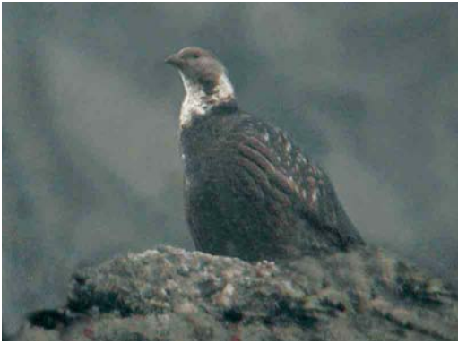
304 Caucasian Snowcock / Kaukasisch Berghoen Tetraogallus caucasicus , mount Kuro, Kazbegi, Khevi, Georgia, 12 June 2005 (Calum D Scott)