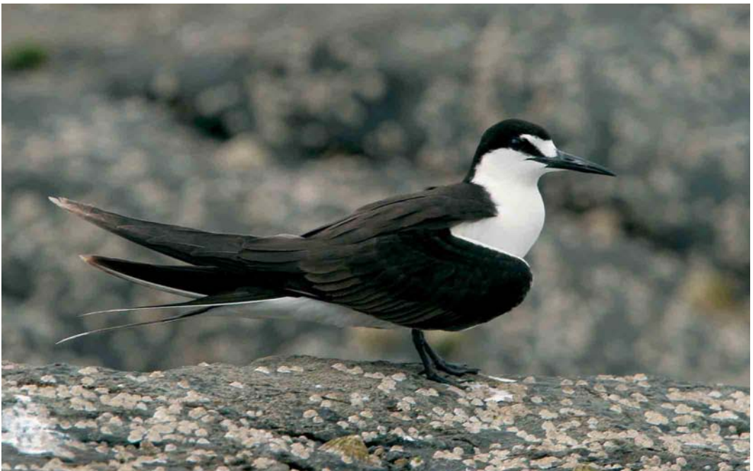
320 Sooty Tern / Bonte Stern Sterna fuscata , The Skerries, Anglesey, Wales, 8 July 2005 (Adrian Webb)