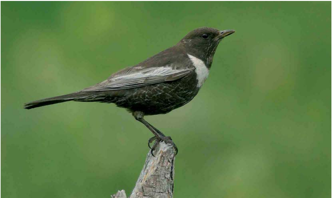
298 Caucasian Ring Ouzel / Kaukasische Beflijster Turdus torquatus amicornum , near Kobi, Khevi, Georgia, 21 June 2005 (René Pop)