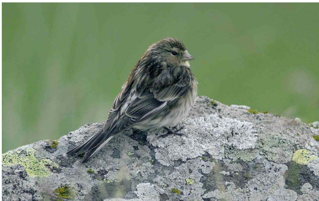
301 Turkish Twite / Turkse Frater Carduelis flavirostris brevirostris , mount Kuro, Kazbegi, Khevi, Georgia, 22 June 2005 (René Pop)