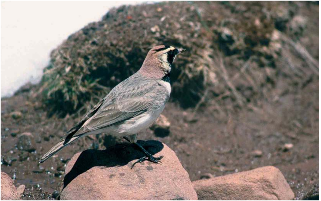
311-312 Atlas Horned Lark / Atlasstrandleeuwerik Eremophila alpestris atlas , Oukaimeden, High Atlas, Morocco, 5 April 2002