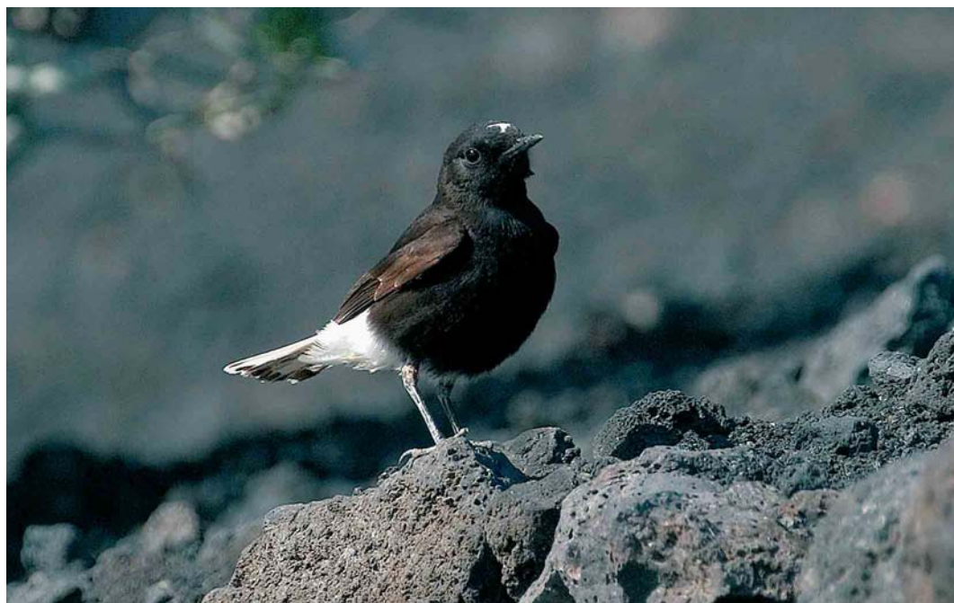
314 White-crowned Wheatear / Witkruintapuit Oenanthe leucopyga , first-year, La Palma, Canary Islands, Spain, 10 January 2005

If accepted by the Spanish rarities committee, this is the first record for the Canary Islands and the first for Spain. An old record of two birds (an immature and an adult male) at Sabinar del Marquez, Reserva Biológica de Doñana, Huelva, on 28 May 1977 (Soriquer 1978) has recently been reviewed and will not appear in the next version of the Spanish avifaunal list (Ricard Gutiérrez in litt). In western Europe, there have been just three previous records, in England (June 1982), Germany (May 1986, Category D) and Portugal (March 2001) (Tipper & Beale 2002). Other records in Europe are from Cyprus, Greece and Malta. Remarkably, the first for the Cape Verde Islands was reported near Fort Real on Santiago on 16 January 2005 (van den Berg 2005). White-crowned Wheatear breeds in rocky areas in deserts in North Africa and the Middle