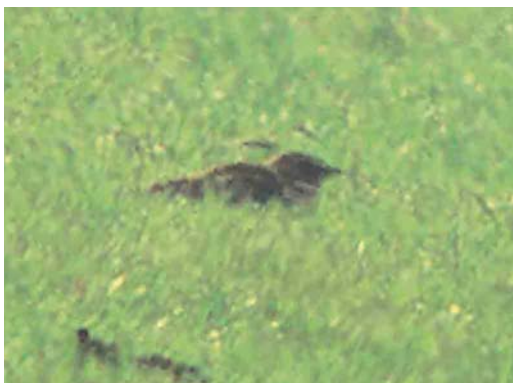
360 Kalanderleeuwerik / Calandra Lark Melanocorypha calandra , Eemshaven, Groningen, 27 mei 2005 (Martijn Bot)