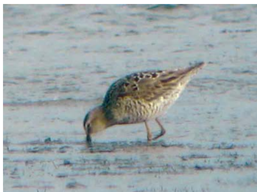
310 Steltstrandloper / Stilt Sandpiper Calidris himantopus , Ezumakeeg, Friesland, 7 juli 2004 (Martijn Bot)

De combinatie van bouw, grootte, lange lichtgebogen snavel, lange geelgroene poten en uniform grijs verenkleed past alleen op Steltstrandloper. In juni, toen de vogel voor een groot deel in zomerkleed was, was de determinatie uiteraard nog eenvoudiger (cf Sibley 2000, Svensson et al 2000). De leeftijdsbepaling is lastiger. Gezien het onvolledige zomerkleed (minder zwaar gebandeerd en met minder roodbruine tekening dan in volledig zomerkleed) en de niet geruide vleugelveren lijkt een eerste-zomer vogel het meest voor de hand te liggen omdat steltlopers soms in hun eerste zomer niet het volledig uitgekleurde adulte kleed bereiken. Het is echter lastig om een niet geheel doorgeruide adulte vogel uit te sluiten.