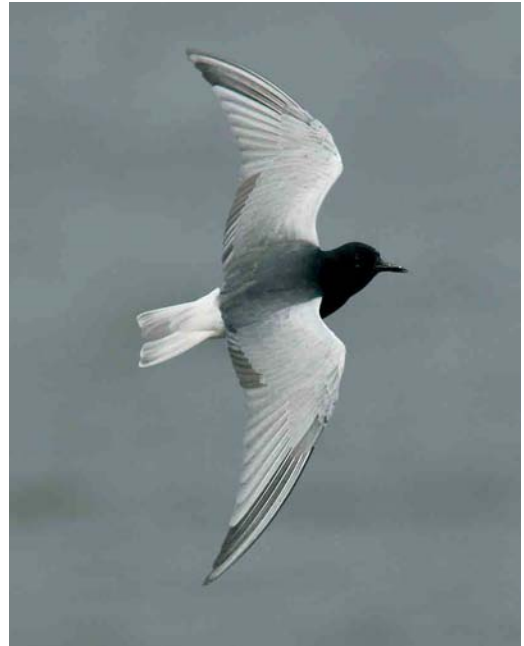
355 Witvleugelstern / White-winged Tern Chlidonias leucopterus , Nieuwpoort, West-Vlaanderen, 14 mei 2005