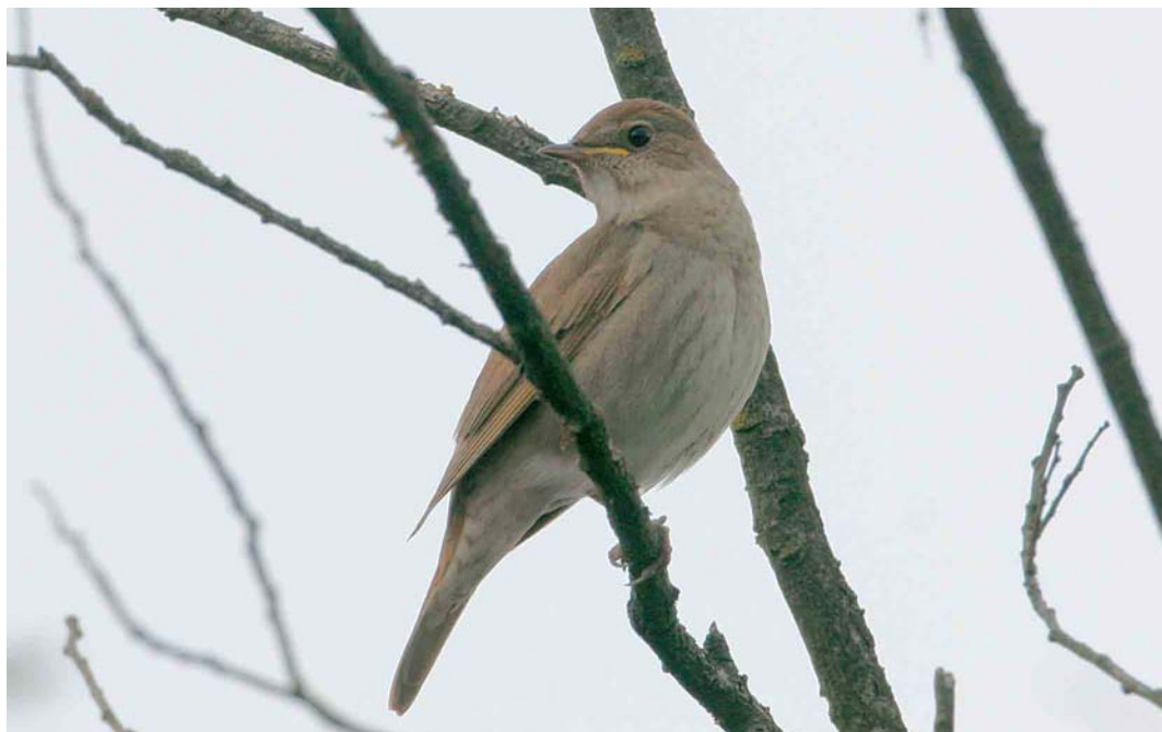
348 Noordse Nachtegaal / Thrush Nightingale Luscinia luscinia , Flevocentrale, Flevoland, 21 mei 2005 349 Orpheusspotvogel / Melodious Warbler Hippolais polyglotta , Swalmen, Limburg, 3 juni 2005 350 Orpheusspotvogel / Melodious Warbler Hippolais polyglotta , Arnemuïden, Zeeland, 12 juni 2005