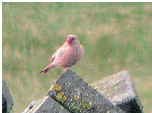
361 Woestijnvink / Trumpeter Finch Bucanetes githagineus , adult mannetje, Eemshaven, Groningen, 12 juni 2005

Deze waarneming is de tweede voor Nederland. De eerste was op 31 mei 2003 op de Maasvlakte, Zuid-Holland. De waarneming in de Eemshaven past in het patroon van een ware influx van Woestijnvinken in Europa in april-juni 2005. In totaal werden tot begin