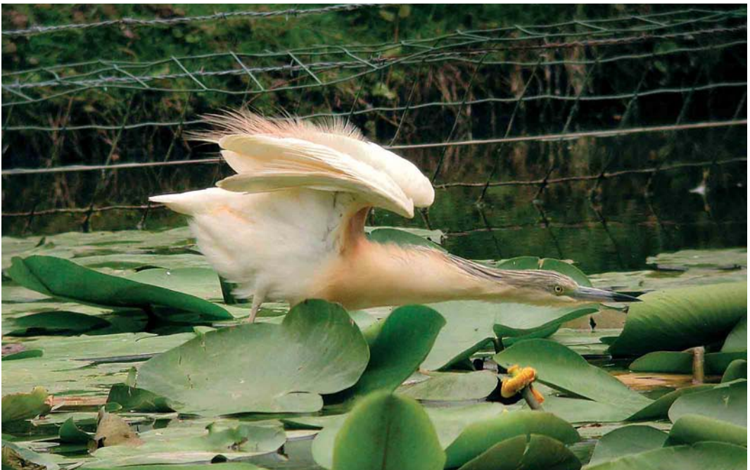
354 Ralreiger / Squacco Heron Ardeola ralloides , Kruike, Oost-Vlaanderen, 26 juni 2005 (Vincent Legrand)