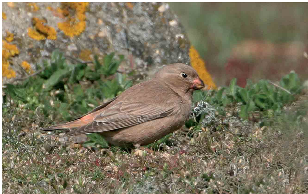
341 Trumpeter Finch / Woestijnvink Bucanetes githagineus , Landguard, Suffolk, England, 21 May 2005 (Bill Baston)