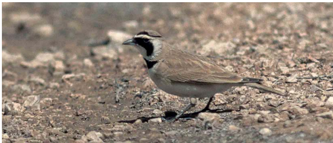
313 Temminck's Lark / Temmincks Strandleeuwerik Eremophila bilopha , Boumalne de Dadès, Morocco, 10 April 1997

Eurasian Horned by having, for instance, on average even longer horns, a wider black mask across the eye and down the cheek, a broader black breast band pointing upwards at the centre, paler grey upperparts, plainer, less streaky flanks suffused with grey, and a quite contrasting reddish-cinnamon crown, nape and uppermantle merging into the grey of the mantle. Below the cheek, the black mask narrows into a black line almost completely encircling the yellow throat by connecting with the pointed centre of the black breast band.