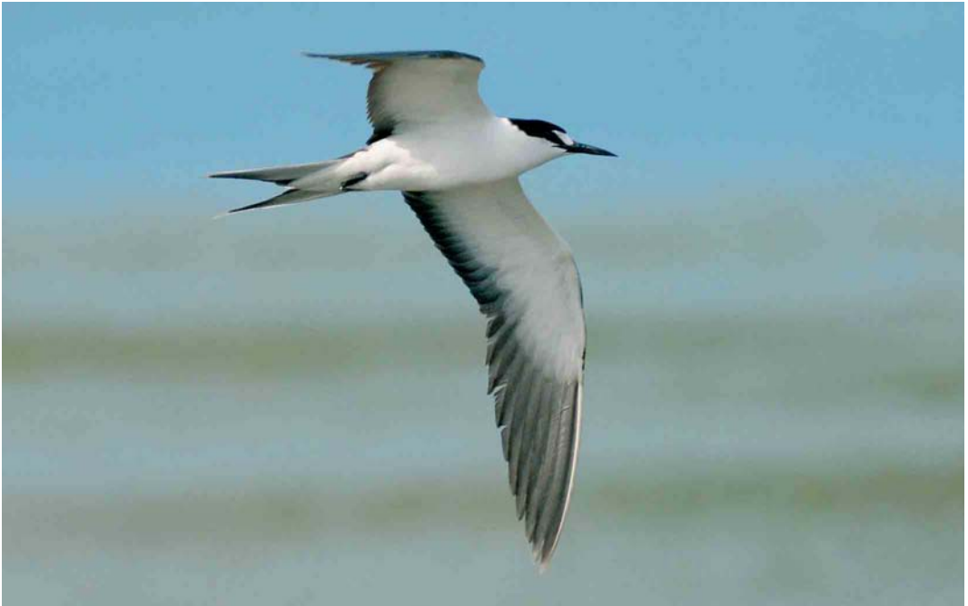
319 Sooty Tern / Bonte Stern Sterna fuscata , The Skerries, Anglesey, Wales, 10 July 2005