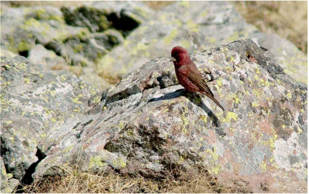
302-303 Caucasian Great Rosefinch / Grote Roodmus Carpodacus rubicilla , male, mount Kazbeg at 2900 m elevation, Kazbegi, Khevi, Georgia, 24 June 2005