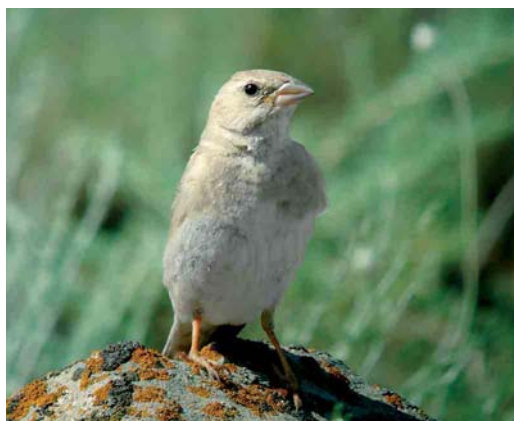
332 Steppe Grey Shrike / Steppeklapekster Lanius pallidirostris , Lågskär, Åland, Finland, 23 May 2005 333 Paddyfield Warbler / Veldrietzanger Acrocephalus agricola , Helgoland, Schleswig-Holstein, Germany, 3 June 2005 334 Marmora's Warbler / Sardijnse Grasmus Sylvia sarda , Skagen, Nordjylland, Denmark, 12 June 2005 335 Pale Rockfinch / Bleke Rotsmus Carpospiza brachydactyla , Oorts hills, Armenia, 15 June 2005

were in Outer Hebrides, Scotland, from 18 May until early June. The fifth Sabine's Gull L sabini for Italy was an adult-summer at Garlate, Lecco, Lombardia, on at least 17-18 May. An adult Audouin's Gull L audouinii turned up at St Ouen's Pond, Jersey, Channel Islands, at 07:00 on 31 May. A second-summer was present for 30 min at Beacon Pond, Spurn, East Yorkshire, in the afternoon of 1 June. The largest colony for Italy was found this spring in southern Sardinia where 600 pairs were counted. In the Netherlands, the number of nesting Black-legged Kittiwakes Rissa tridactyla on an oil rig at Friese Front (where the species bred for the first time in 2003 with three pairs) had increased to 45 pairs on 22 June 2005. A first-summer Ross's Gull Rhodostethia rosea was reported at Húsavík, Iceland, on 28 May. In northern Noord-Holland, the first breeding of Gull-billed Terns Gelochelidon nilotica for the Netherlands