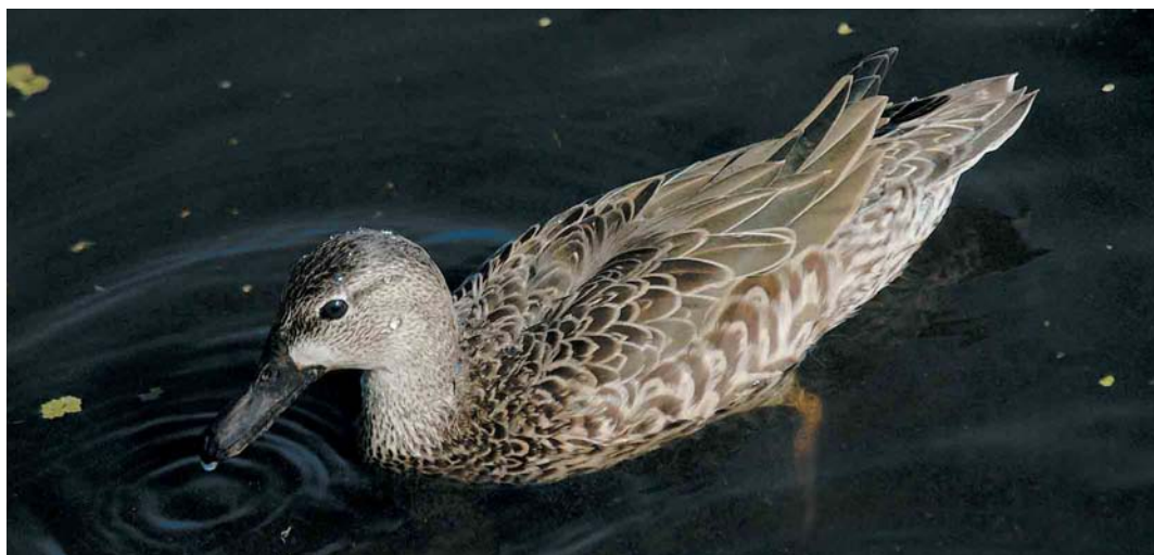
317 Blue-winged Teal / Blauwvleugeltaling Anas discors , Wakodahatchee, Palm Beach, Florida, USA, 18 February 2005 (Arnoud B van den Berg)

In other dabbling duck species, only Gadwall A strepera , Blue-winged Teal A discors and Baikal Teal A formosa show yellowish legs. Female Gadwall can be eliminated as this species would show extensive pale markings on the scapulars, forming dark U-shaped bars reminiscent of the flank-feathers, and grey-centred tertials. The absence of a white streak at the base of the tail in the mystery bird is another clue to eliminate Gadwall. In Baikal Teal, this pale patch should also be present. In addition, an important difference between Baikal and Blue-winged Teal