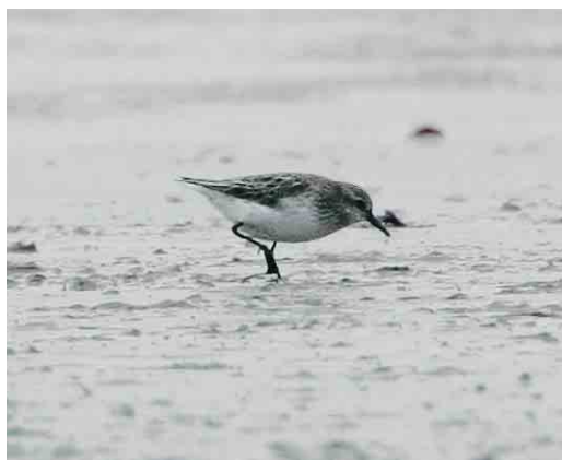
326 Slender-billed Gull / Dunbekmeeuw Larus genei , Ile de Noirmoutier, Vendée, France, 11 June 2005 327 Sabine's Gull / Vorkstaartmeeuw Larus sabini , Lago di Garlate, Lecco, Lombardia, Italy, May 2005 328 Lesser Crested Tern / Bengaalse Stern Sterna bengalensis , Banc d'Arguin, Arcachon, Gironde, France, June 2005 329 White-tailed Lapwing / Witstaartkievit Vanellus leucurus , Brake, Hannover, Niedersachsen, Germany, 7 June 2005 330 Caspian Plover / Kaspische Plevier Charadrius asiaticus , Rovaniemi, Finland, 3 June 2005 331 Semipalmated Sandpiper / Grijze Strandloper Calidris pusilla , Esbjerg, Jylland, Denmark, 30 May 2005