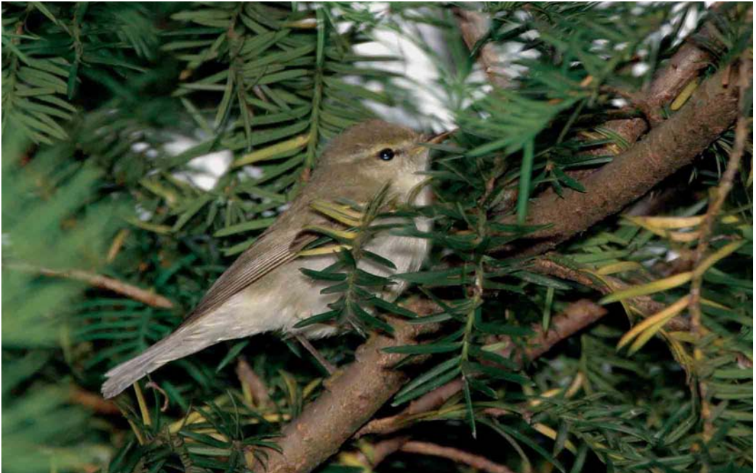
351 Grauwe Fitis / Greenish Warbler Phylloscopus trochiloides , Bodegraven, Zuid-Holland, juni 2005