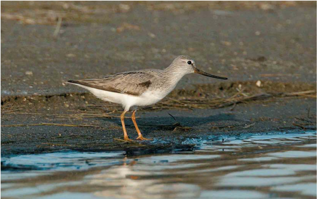
353 Terekruiter / Terek Sandpiper Xenus cinereus , Kieldrecht, Oost-Vlaanderen, Antwerpen, juni 2005