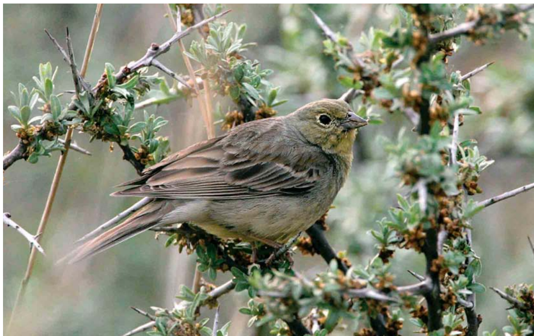
340 Cinereous Bunting / Smyrnagors Emberiza cineracea , Skagen, Nordjylland, Denmark, 28 May 2005 (Ole Krogh)