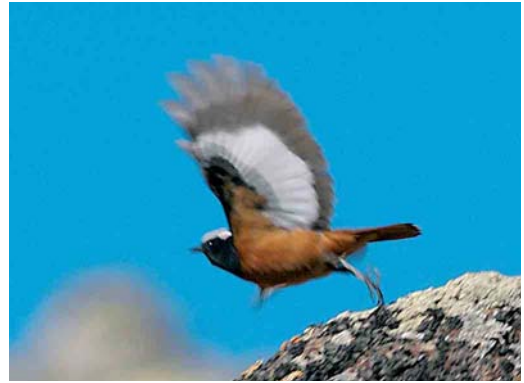
305 Güldenstädt's Redstart / Witkruinroodstaart Phoenicurus erythrogastrus , male, mount Kazbeg at 3000 m elevation, Kazbegi, Khevi, Georgia, 24 June 2005