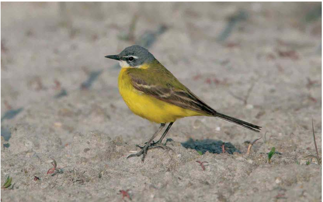
352 Waarschijnlijke Iberische Kwikstraat / probable Iberian Wagtail Motacilla iberiae , mannetje, Nieuwerkerk aan den IJssel, Zuid-Holland, 18 mei 2005 (Chris van Rijswijk)