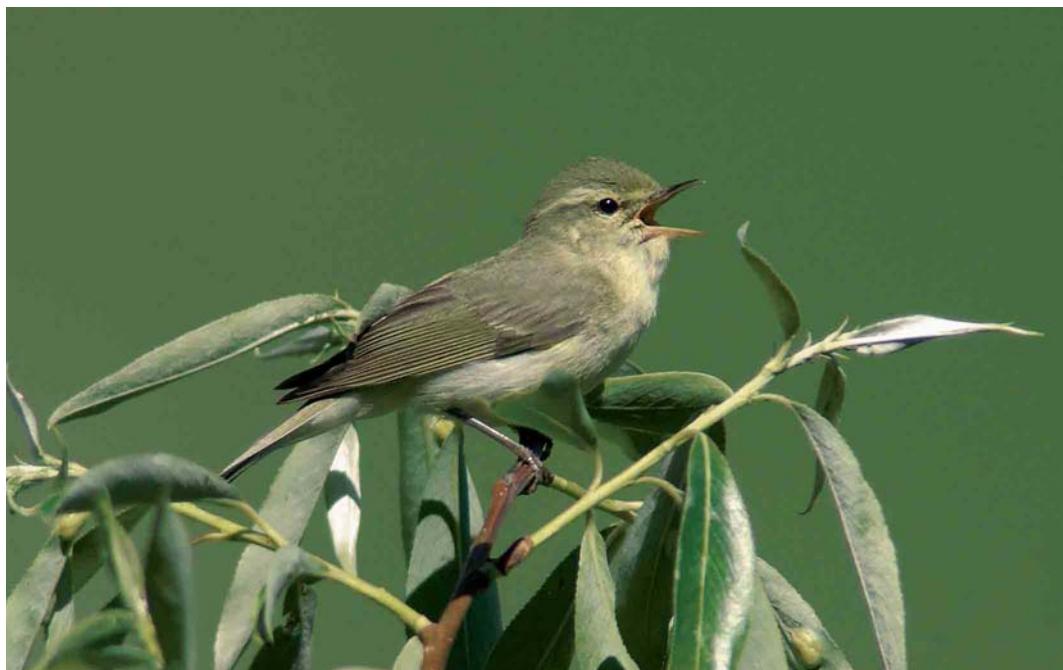
300 Bright-green Warbler / Groene Fitis Phylloscopus nitidus , Stepantsminda Hotel, Kazbegi, Khevi, Georgia, 23 June 2005