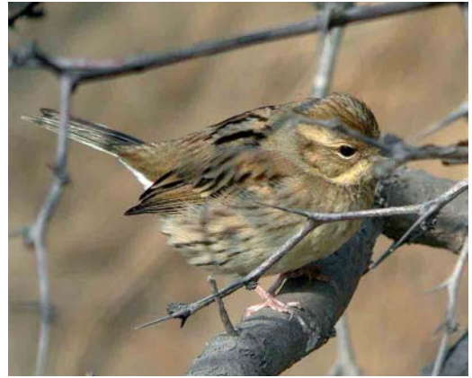
Mystery photograph VIII (May)

concerns the pattern of the flank-feathers. In the mystery bird, a subterminal pale line in the flank-feathers is present, creating dark U-shaped subterminal marks. This is typical for Blue-winged. In Baikal, the flank-feathers are more uniformly coloured brown with a pale fringe.