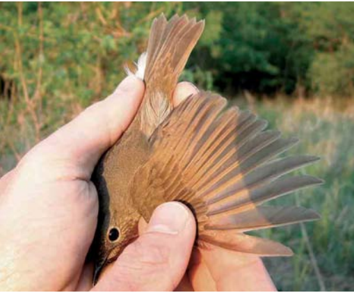
Mystery photograph VII (May)