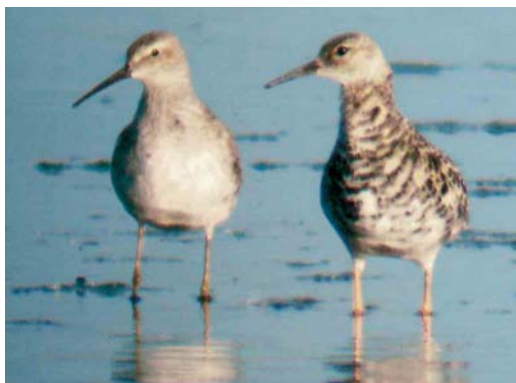
309 Steltstrandloper / Stilt Sandpiper Calidris himantopus , met Kempphaan / Ruff Philomachus pugnax , Ezumakeeg, Friesland, 16 mei 2004 (Bart-Jan Prak)