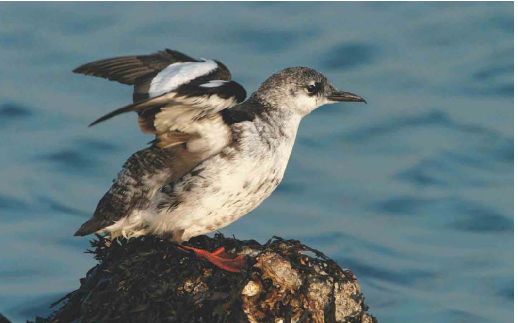
81 Zwarte Zeekoet / Black Guillemot Cepphus grylle , adult-winter, West-Terschelling, Terschelling, Friesland, 4 oktober 2004