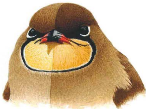
FIGURE 2 Head characters of nominate Collared Pratincole / Vorkstaartplevier Glareola pratincola (left half) and typical Afrotropical Collared Pratincole / Afrikaanse Vorkstaartplevier G p erlangeri/fuelleborni/riparia (right half) summer (Gerald Driessens). Afrotropical Collared Pratincole typically has 1 darker brown forehead, decreasing contrast with lores; 2 richer buff throat-patch; 3 often longer black mouth-line; and 4 broader black throat surround (especially below eye).

Many Afrotropical pratincola show the same colour as typical Palearctic pratincola : a buffish salmon-pink wash on the lower breast and a white belly. A minority of Afrotropical pratincola show a more saturated orange-buff but never as deeply as in well-marked maldivarum . In some birds, the wash on the underparts runs down to the belly but it is never as intensively coloured as in maldivarum . When such Afrotropical pratincola have fresh feathers, they appear – just like maldivarum – rather scaly on the underparts as the orange feathers are clearly paler tipped.