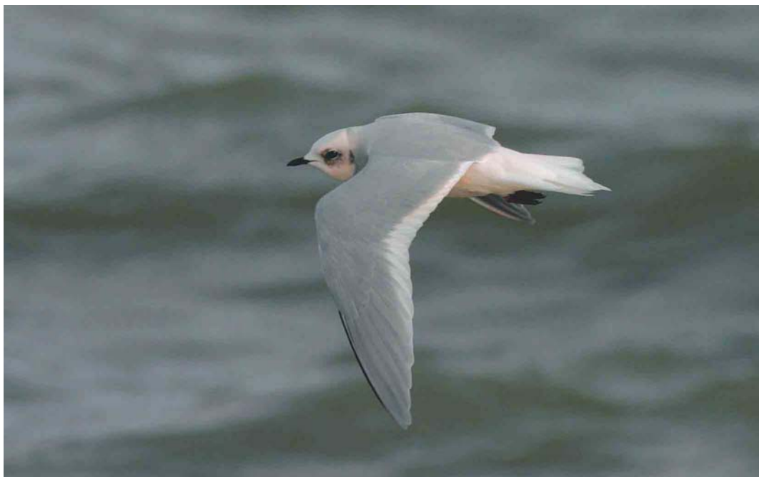
77 Ross' Meeuw / Ross's Gull Rhodostethia rosea , adult, Scheveningen, Zuid-Holland, 23 november 2004 ( Jack Folkers )