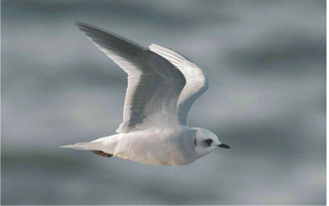
97 Ross' Meeuw / Ross's Gull Rhodostethia rosea , adult, Scheveningen, Zuid-Holland, 23 november 2004 (Arnaud B van den Berg) 98 Ross' Meeuw / Ross's Gull Rhodostethia rosea , adult, Scheveningen, Zuid-Holland, 23 november 2004 (Edwin Winkel) 99 Ross' Meeuw / Ross's Gull Rhodostethia rosea , adult, Scheveningen, Zuid-Holland, 23 november 2004 (Jack Folkers)