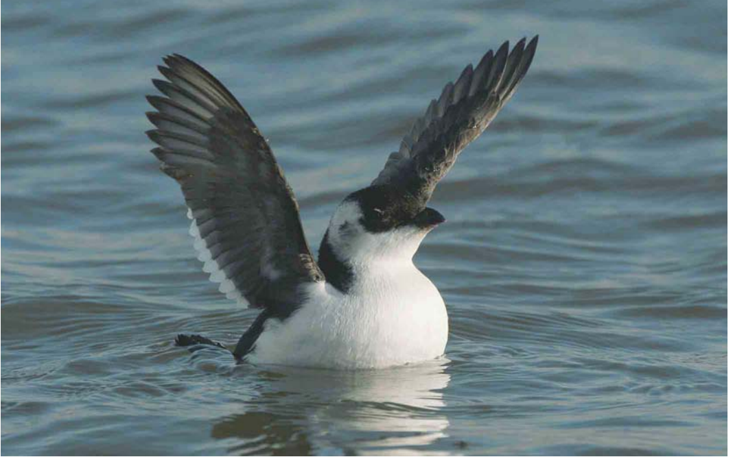
80 Kleine Alk / Little Auk Alle alle , Trintelhaven, Flevoland, december 2004 (Jack Folkers)