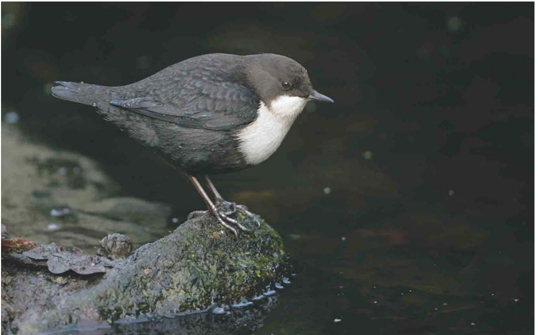
88 Zwartbuikwaterspreuw / Black-bellied Dipper Cinclus cinclus cinclus , Emmen, Drenthe, 14 december 2004 (Roland Jansen)