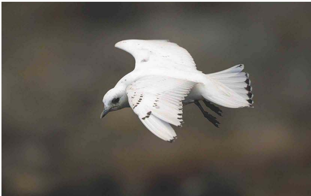
54 Ivory Gull / Ivoormeeuw Pagophila eburnea , first-winter, Lerkil, Halland, Sweden, 18 December 2004 (Bas van den Boogaard)