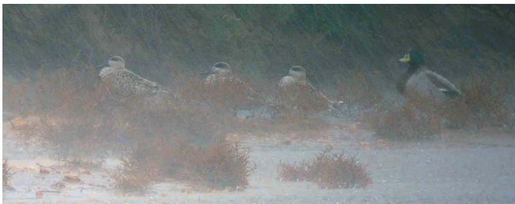
58 Laughing Gull / Lachmeeuw Larus atricilla , adult, Angelochori salt pools, Macedonia province, Greece, 13 January 2005 59 Laughing Gull / Lachmeeuw Larus atricilla , adult, San Remo, Liguria, Italy, 28 November 2004 60 Intermediate Egret / Middelste Zilverreiger Egretta intermedia , Yotvata, Israel, 6 November 2004 61 Greater Spotted Eagle / Bastaardarend, first-year, Camargue, Bouches-du-Rhône, France, 28 November 2004 62 Marbled Ducks / Marmereenden Marmaronetta angustirostris , with Mallard / Wilde Eend Anas platyrhynchos , male, Ghadira, Malta, 17 December 2004