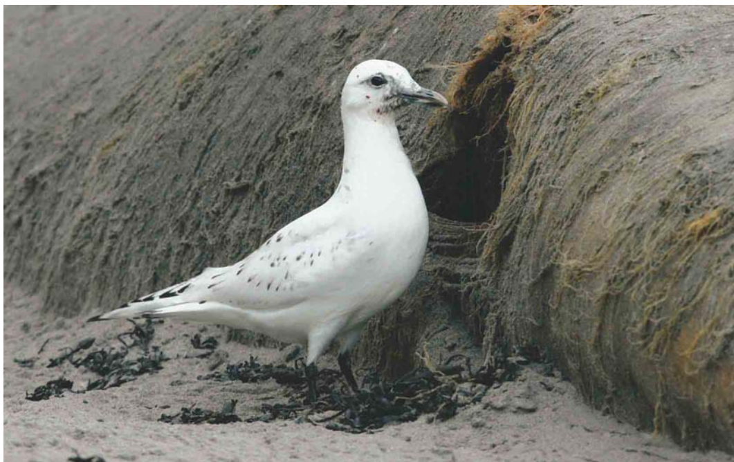
55 Ivory Gull / Ivoormeeuw Pagophila eburnea , first-winter, Coldbackie Bay, Kyle of Tongue, Highland, Scotland, 5 December 2004