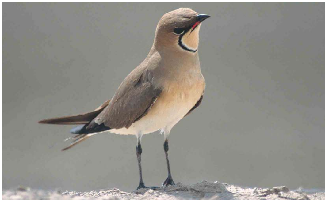
12 Collared Pratincole / Vorkstaartplevier Glaucopis trichotis , adult-summer, Sevilla, Andalucía, Spain, 26 April 2002 (Ray Tipper). Brightly coloured individual with darker forehead, black mouth-line, deep buff throat-patch, broad black-and-white throat-surround and orangy-buff wash on lower breast reminiscent of Oriental Pratincole G. maldivarum . Tail length clearly clinching identity as Collared. Beware that frontal view can produce high-legged impression in Collared as well! 13 Collared Pratincole / Vorkstaartplevier Glaucopis trichotis , adult-summer, Sevilla, Andalucía, Spain, 26 April 1999 (Ray Tipper). Nostril shape or presence of skin difficult to assess on other wise typical Collared.