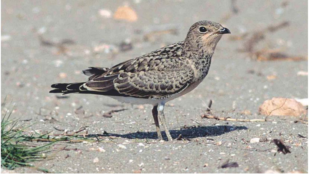
31 Collared Pratincole / Vorkstaartplevier Glareola pratincola , juvenile, Ebro delta, Tarragona, Spain, 18 July 2003 (Karel A Mauer). Bird in fresh juvenile plumage, difficult to identify. Elongated Collared silhouette is not yet developed as the primaries are still rather short. Nevertheless, the tail is already too long for Oriental Pratincole G maldivarum , showing two quite widely spaced tips to the outer tail-feathers. Slit-shaped nostril is not reliably visible. Feather centres on upperparts are mid-brown, lacking harsh contrast with pale tips of Oriental and creating buff cast over the plumage. 32 Collared Pratincole / Vorkstaartplevier Glareola pratincola , juvenile, Ebro delta, Tarragona, Spain, 18 July 2003 (Karel A Mauer). Same bird as in plate 31, practically impossible to identify in this posture, except for broad, white tips to secondaries, visible on underside of wing. 33 Collared Pratincole / Vorkstaartplevier Glareola pratincola , juvenile, Histria, Romania, August 1998 (Laszlo Szabo). Rather dark, moulting juvenile. Underside of outer tail-feather is visible and shows broad black tip. Nostril shape too narrow for Oriental.