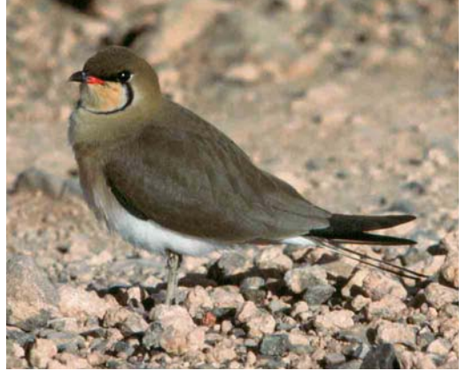
44 Collared Pratincole / Vorkstaartplevier Glareola pratincola , adult-summer, Ouarzazate, Morocco, 13 April 1992. Dark, sepia-brown crown and upperparts, deep buff throat-patch and warm orangy-buff wash on lower breast produce a very fuelleborni -like appearance. Probably, such birds appear more regularly in North Africa than in the European population.

only a slight contrast between the pale inner and the dark outer web of the inner primaries (cf darker individuals in Palearctic pratincola ).