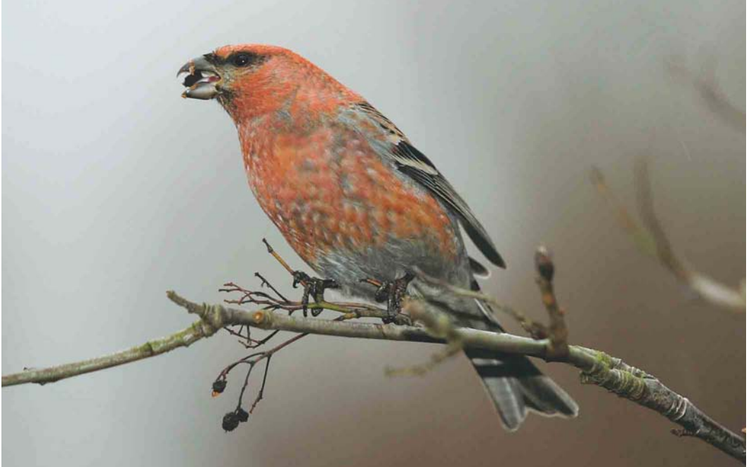
87 Haakbek / Pine Grosbeak Pinicola enucleator , adult mannetje, Beijum, Groningen, Groningen, 17 november 2004 (Roland Jansen)