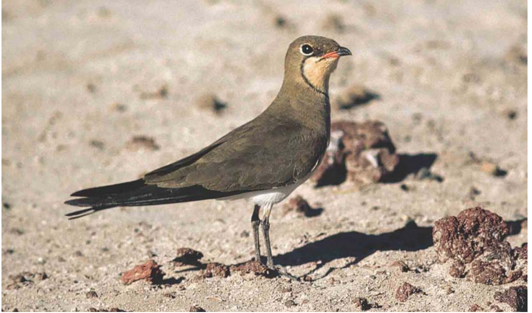
45 Afrotropical Collared Pratincole / Afrikaanse Vorkstaartplevier Glareola pratincola fülleborni , adult-summer, Amboseli, Kenya, January 1985. Another African Collared (probably female) showing most of its characters. Upperparts perhaps not as typically dark as in figure 1 but still showing little contrast with remiges. Note lack of white throat-surround. Black parts (primaries, tail-feathers) show deep purplish-blue gloss, much more pronounced than in average pratincola . Inner primary pattern is generally less pronounced than in nominate, as a result of the blacker remiges. 46 Collared Pratincole / Vorkstaartplevier Glareola pratincola , worn adult, Chobe, Botswana, 4 December 2001. A worn, rather pale bird, either a wintering nominate pratincola or a paler individual of the resident Afrotropical subspecies-group.