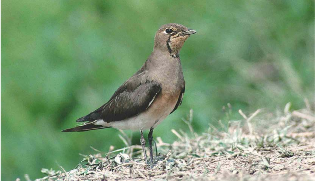
21 Oriental Pratincole / Oosterse Vorkstaartplevier Glareola maldivarum , adult-winter, Long Valley, Hong Kong, China, 27 November 1994. Tail length difficult to interpret. Combination of upperpart coloration, tinge of throat-patch, deep orange wash on lower breast and all-black bill unique for adult Oriental. 22 Oriental Pratincole / Oosterse Vorkstaartplevier Glareola maldivarum , adult-winter, Ängsnäset, Sweden, 16 August 2001. Same bird as in plate 23. Only the outer primaries are still to be replaced. The lack of any first-winter feathers proves this bird to be an adult (although some first-winters can look exactly the same). Knowing that this is an adult (when first present it was still partial in summer plumage), however, bill shows average amount of red for the species (nearly absent on lower mandible) and, more importantly, oval nostril. Also note tail projection creating a short hind-body and dark olive-brown upperparts (with slight olive-green cast).