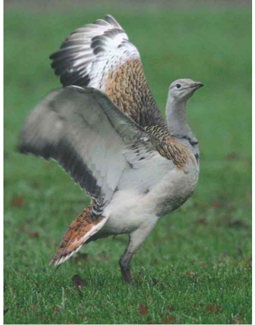
69 Blue-naped Mousebird / Blauwnekmuivogel Colius macrourus , Aghmakou, Mauritania, 2 January 2005 (Kris De Rouck) 70 Great Bustard / Grote Trap Otis tarda , female, Borculo, Gelderland, Netherlands, 8 December 2004 (Chris van Rijswijk) 71 Cricket Warbler / Krekelpriinia Spiloptila clamans , Aghmakou, Mauritania, 2 January 2005 (Kris De Rouck)