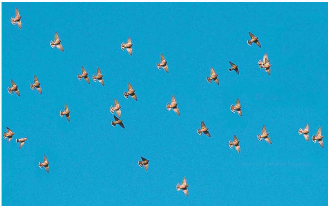
82 Pestvogels / Bohemian Waxwings Bombycilla garrulus , Den Haag, Zuid-Holland, 30 november 2004 (Henk Harmsen)