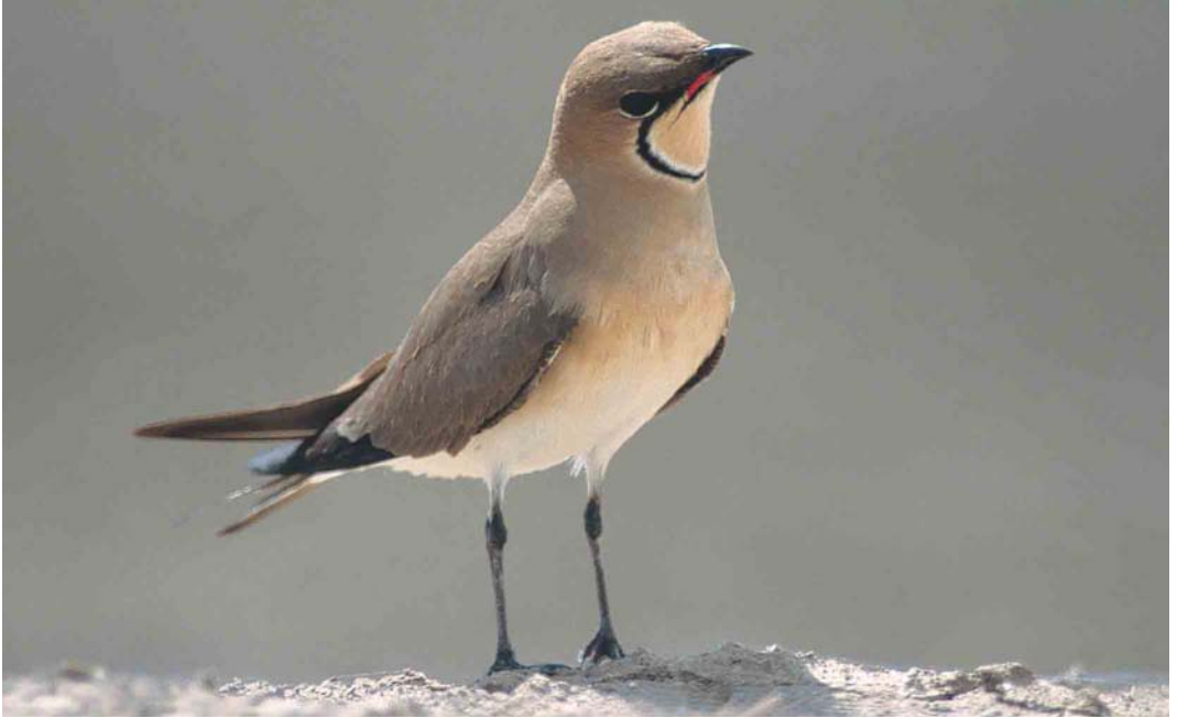
12 Collared Pratincole / Vorkstaartplevier Glaucopis pratincola , adult-summer, Sevilla, Andalucía, Spain, 26 April 2002 (Ray Tipper). Brightly coloured individual with darker forehead, black mouth-line, deep buff throat-patch, broad black-and-white throat-surround and orangy-buff wash on lower breast reminiscent of Oriental Pratincole G. maldivarum . Tail length clearly clinching identity as Collared. Beware that frontal view can produce high-legged impression in Collared as well! 13 Collared Pratincole / Vorkstaartplevier Glaucopis pratincola , adult-summer, Sevilla, Andalucía, Spain, 26 April 1999 (Ray Tipper). Nostril shape or presence of skin difficult to assess on other wise typical Collared.