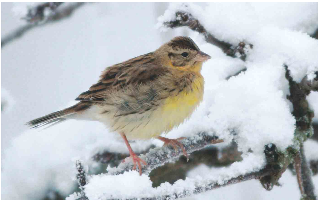
75 Yellow-breasted Bunting / Wilgengors Emberiza aureola , first-winter male, Hellkås, Telemark, Norway, 3 December 2004 ( Christian Tiller )