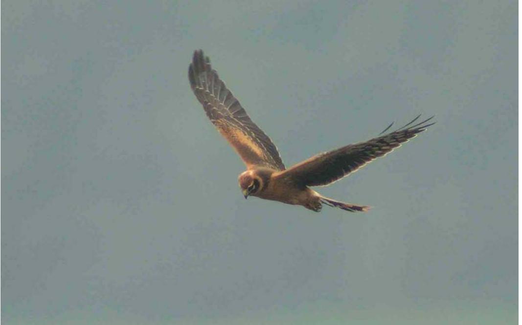
95 Steppekiekendief / Pallid Harrier Circus macrourus , juveniel, Thuillies, Hainaut, 2 november 2004 (Johan Buckens)

segena opgemerkt. Late Grauwe Pijlstormvogels Puffinus griseus werden waargenomen op 5 november langs De Panne (drie) en op 19 november langs Oostende en De Panne (telkens twee). Op 19 november vlogen bovendien twee Stormvogeltjes Hydrobates pelagicus langs Nieuwpoort, West-Vlaanderen, en één langs De Panne. Tussen 13 en 22 november werden in totaal nog acht Vale Stormvogeltjes Oceanodroma leucorhoa opgemerkt. Kuifaalscholvers Phalacrocorax aristotelis deden het naar 'moderne' tendenzen weer iets beter dan het vorige jaar met waarnemingen in De Panne (18 en 20 november); Nieuwpoort (van 1 tot 6 en twee op 19 november); Oostende (22 november) en Zeebrugge, West-Vlaanderen (30 november en 10 december). Net zoals tijdens de vorige winter kreeg een tuinvijver in Schilde, Antwerpen, eind december weer regelmatig bezoek van een adulte Kwak Nycticorax nycticorax . Op 8 december was een eerste-winter aanwezig in Mariembourg, Namur. De hoogste concentraties van Kleine Zilverreiger Egretta garzetta waren 45 in Lissewege, West-Vlaanderen; 33 in Knokke, West-Vlaanderen; 13 in Zeebrugge; vijf in Verrebroek, Oost-Vlaanderen; en telkens drie in Zonhoven, Limburg, en Harchies-Hensies, Hainaut. Er werden ook weer heel wat Grote Zilverreigers Casmerodius albus opgemerkt met opvallende concentraties in Zonhoven (59 op 5 december); Zolder, Limburg (56 op 4 november); Harchies-Hensies (22 op 19 december); Essen en Heindonk, Antwerpen (13 op 21 december);