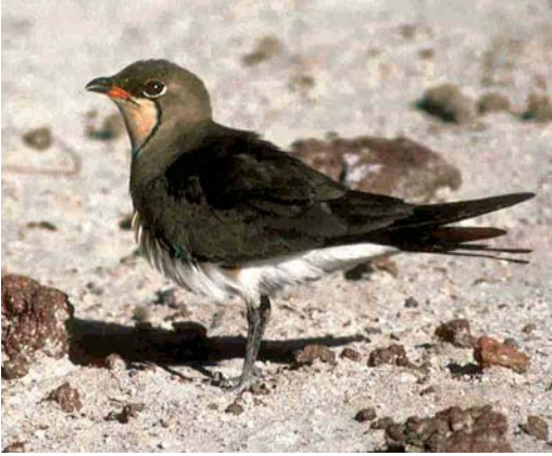
43 Afrotropical Collared Pratincole / Afrikaanse Vorkstaartplevier Glareola pratincola fuelleborni , adult-summer, Amboseli NP, Kenya, 7 januari 1995. Typical African Collared (probably male), showing very dark sepia-brown upperparts, little contrast between forecrown and lore and very deep orangy-brown coloured throat-patch with practically no indication of a white border. Birds of the fuelleborni -type more often show a clear black mouth-line than nominate pratincola . Structure is identical to nominate pratincola , including slit-shaped nostril.