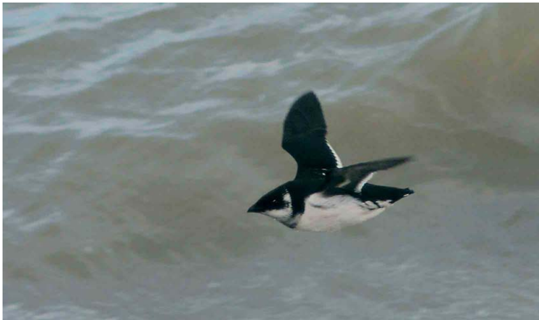
96 Kleine Alk / Little Auk Alle alle , Oostende, West-Vlaanderen, 20 november 2004 (Johan Buckens)