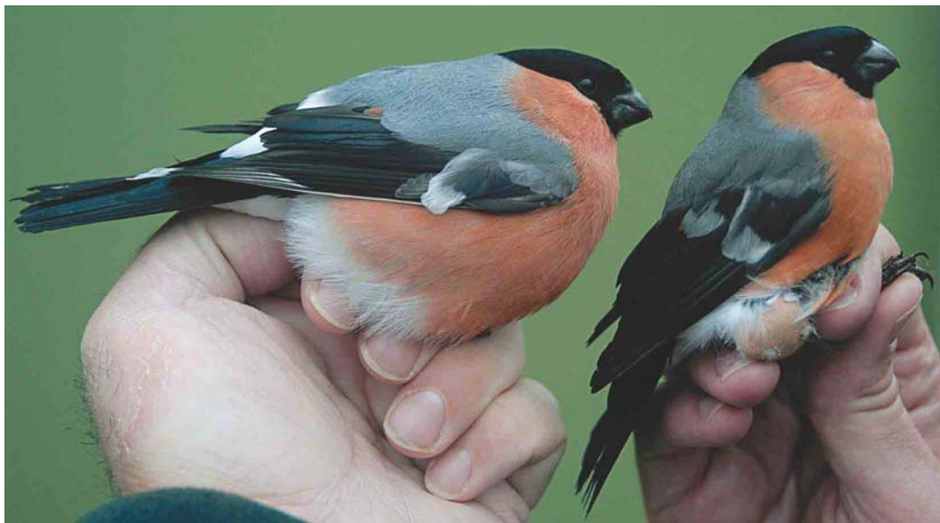
101 Noordse Goudvink / Northern Bullfinch Pyrrhula pyrrhula , adult of eerste-winter mannetje 'trompetgoudvink' / 'trumpeter bullfinch' (links) en Goudvink / Central European Bullfinch P p europaea , eerste-winter mannetje, Bloemendaal, Kennemerduinen, Noord-Holland, 1 november 2004 (Arnoud B van den Berg/Vrs van Lennepe)

genoemde periode bijna 1400 vogels geteld, tegen ruim 300 in 2003, c 175 in 2002 en ruim 500 in 2001. Deze aantallen moeten in het licht worden gezien van een recente, sterk toegenomen belangstelling om trektellingen te verrichten maar desondanks kan worden gesteld dat 2004 een erg goed, zo niet het beste jaar ooit voor de trek van deze soort was. Hetzelfde werd niet alleen vastgesteld in België, Brittannië (met record-aantallen op Shetland, Schotland) en Zuid-Scandinavië, maar ook in Midden- en Oost-Europa en westelijk tot in Ierland en IJsland (waar in totaal 33 exemplaren werden gezien). In het verleden betroffen invasies van Goudvinken in deze landen voornamelijk Noordse Goudvink P p pyrrhula uit Scandinavië en Rusland. Ook bij de invasie van 2004 leek dat het geval. Echter, dit keer werd door diverse waarnemers vrijwel direct opgemerkt dat de vogels een andere roep hadden. De roep klonk lager en nasaler dan het bekende Goudvink-fluitje en was minder makkelijk na te fluiten. Het geluid deed denken aan een kindertrompetje, vandaar de bijnamen 'trompetgoudvink' of (in België) 'teuter'; in Brittannië spreekt men van 'trumpeter bullfinch' en in Duitsland en Oostenrijk van 'Trumpetgimpel'. Aanvankelijk ontstond zelfs verwarring met de roep van Witbandkruisbek Loxia leucoptera en Woestijnvink Bucanetes githagineus .