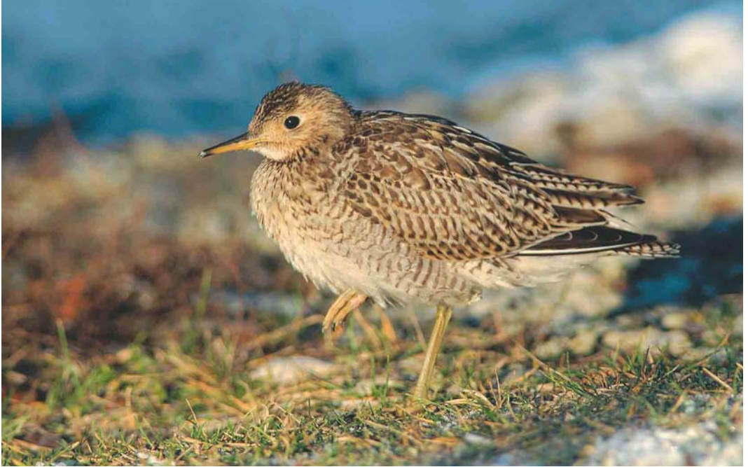
56 Upland Sandpiper / Bartrams Ruiters Bartramia longicauda , Kälder, Gotland, Sweden, 20 December 2004