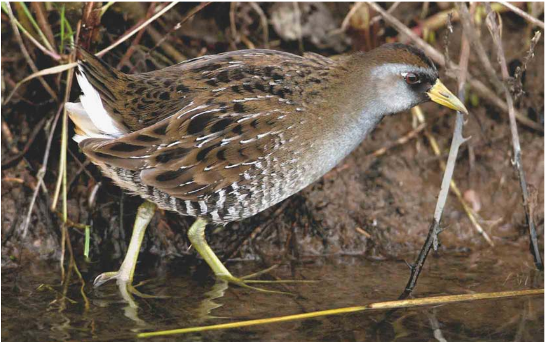
57 Sora / Soraral Porzana carolina , Attenborough, Nottinghamshire, England, December 2004