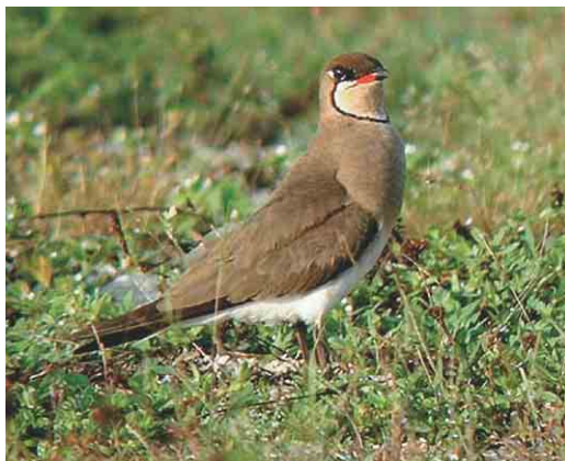
18 Oriental Pratincole / Oosterse Vorkstaartplevier Glareola maldivarum , adult-summer, Asia, probably Malaysia, 2001 (Laurence Poh). Typical bird in several aspects: warm dark brown forehead showing little contrast with black lore, deep buff throat-patch, quite dark, somewhat warm brown upperparts (although there is still a clear contrast between tertials and primaries), and tail falling short of primary tips. Less pronounced are width of black-and-white throat-surround and orangy-buff wash on lower breast.

maldivarum generally have all-red under greater secondary coverts, and both can rarely show some dark grey patches on some outer underwing-coverts, or have a few outer coverts entirely dark. Both species have invariably dark grey or blackish under primary coverts. Both species have wing-lining and lesser coverts mainly dark brown-grey (with some off-white admixed, c 10 mm wide). Both species have the same rufous-red colour.