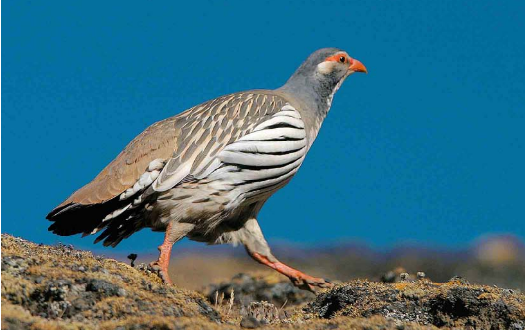
47-48 Tibetan Snowcock / Tibetaanse Berghoen Tetraogallus tibetanus , Gorak Shep, Nepal, altitude 5200 m, October 2003