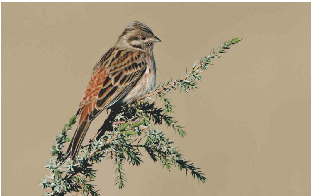
74 Pine Bunting / Witkopgors Emberiza leucocephalos , male, Macchia Lucchese, Toscana, Italy, November 2004 ( Daniele Occhiato )