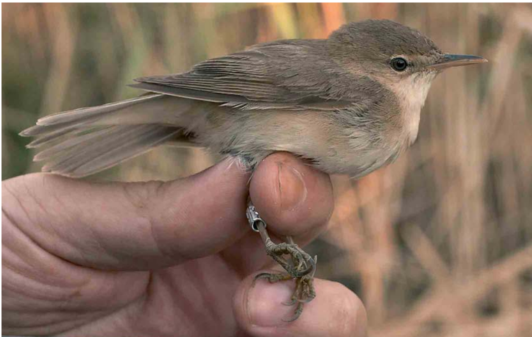
315 European Reed Warbler / Kleine Karekiet Acrocephalus scirpaceus , adult, Espoo, Finland, 13 August 2006 (Annika Forsten & Antero Lindholm). Same bird as in plate 313.