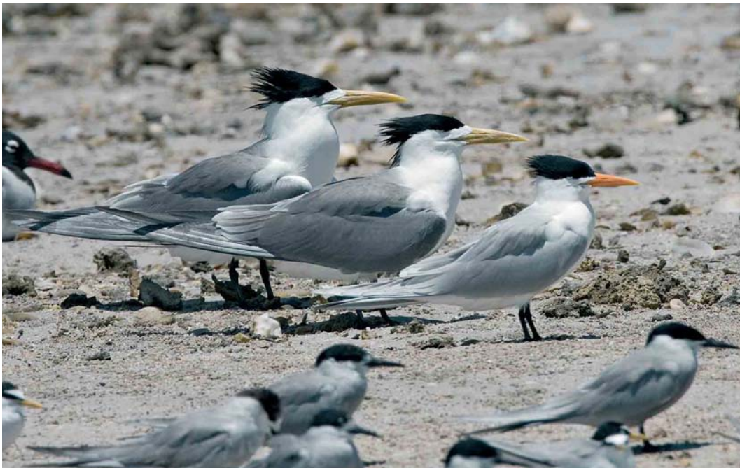
343 Greater Crested Terns / Grote Kuifsterns Sterna bergii , adult, with Lesser Crested Tern / Bengaalse Stern S. bengalensis , White-cheeked Terns / Arabische Sterns S. repressa , Little Terns / Dwergsterns Sternula albifrons and White-eyed Gull / Witoogmeeuw Larus leucophthalmus , El Gouna, Egypt, 14 May 2007 (Edwin Winkel)