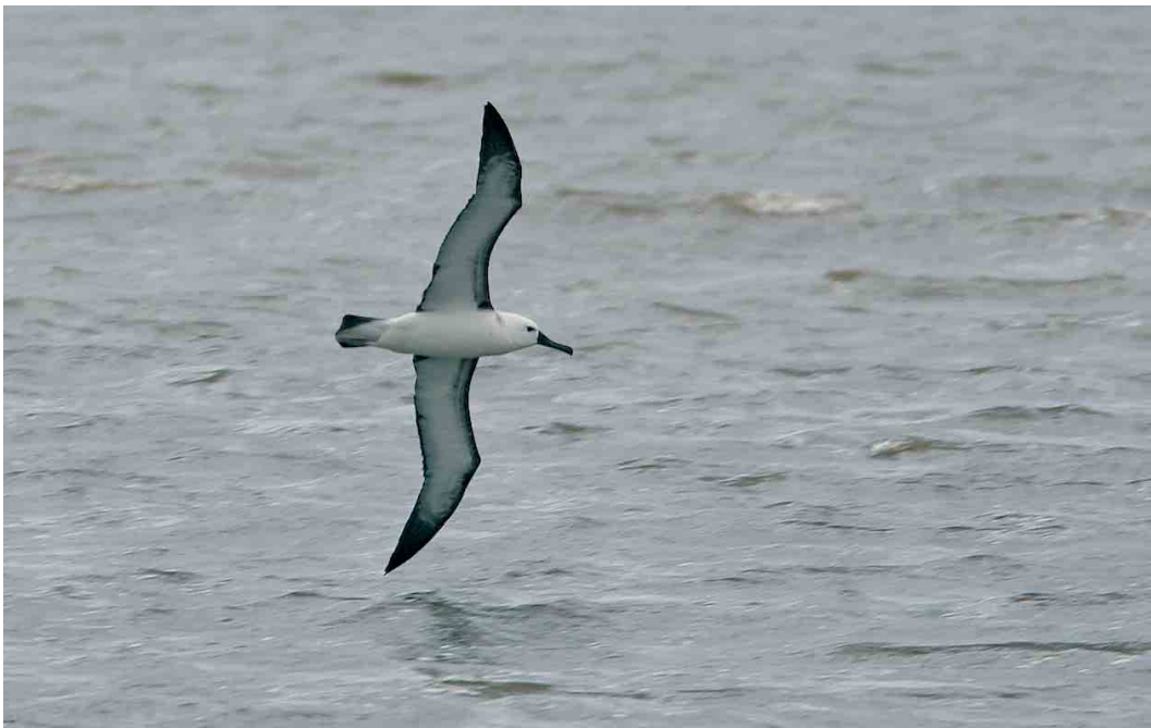
325 Atlantic Yellow-nosed Albatross / Atlantische Geelneusalbatros Thalassarche chlororhynchos , off Malmö, Skåne, Sweden, 8 July 2007 (Kristian Ståhl)