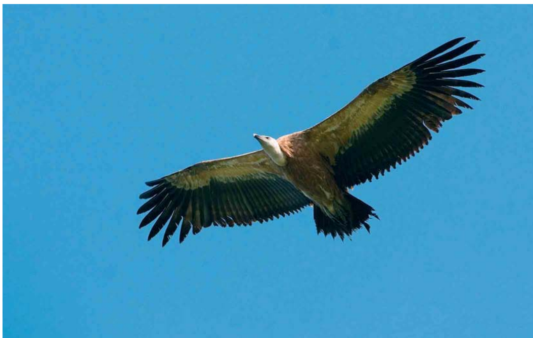
354 Vale Gier / Eurasian Griffon Vulture Gyps fulvus , Oss, Noord-Brabant, 19 juni 2007 (Jankees Schwiebbe)