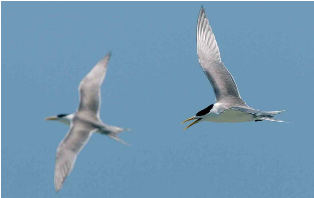
342 Greater Crested Terns / Grote Kuifsterns Sterna bergii , adult, El Gouna, Egypt, 14 May 2007