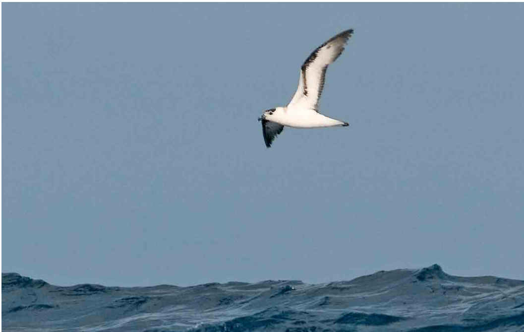
324 Black-capped Petrel / Zwartkapstormvogel Pterodroma hasitata , c 16 km south-east off Graciosa, Azores, 26 May 2007