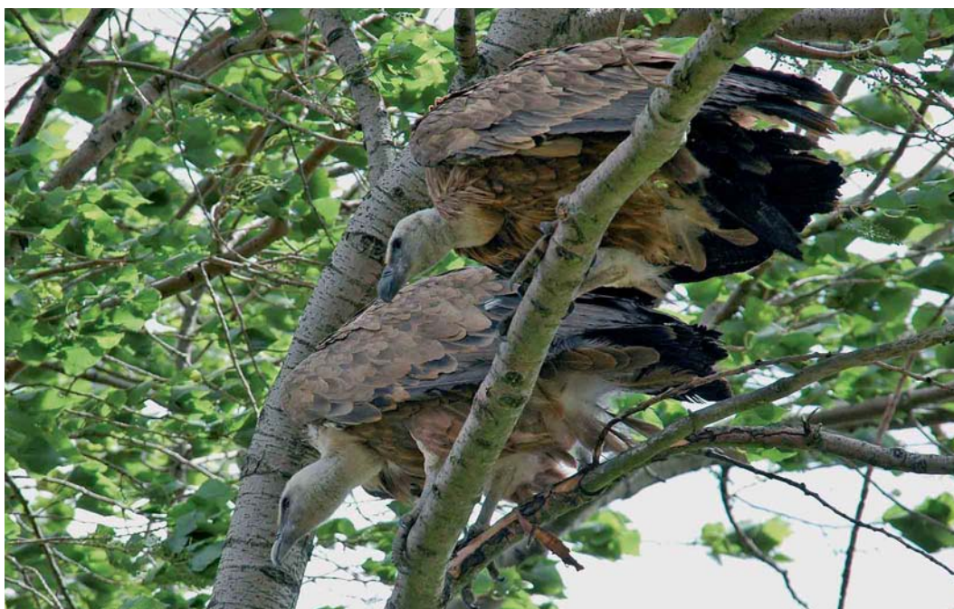
355 Vale Gieren / Eurasian Griffon Vultures Gyps fulvus , Driewegen, Zeeland, 26 juni 2007 (René M van Loo)