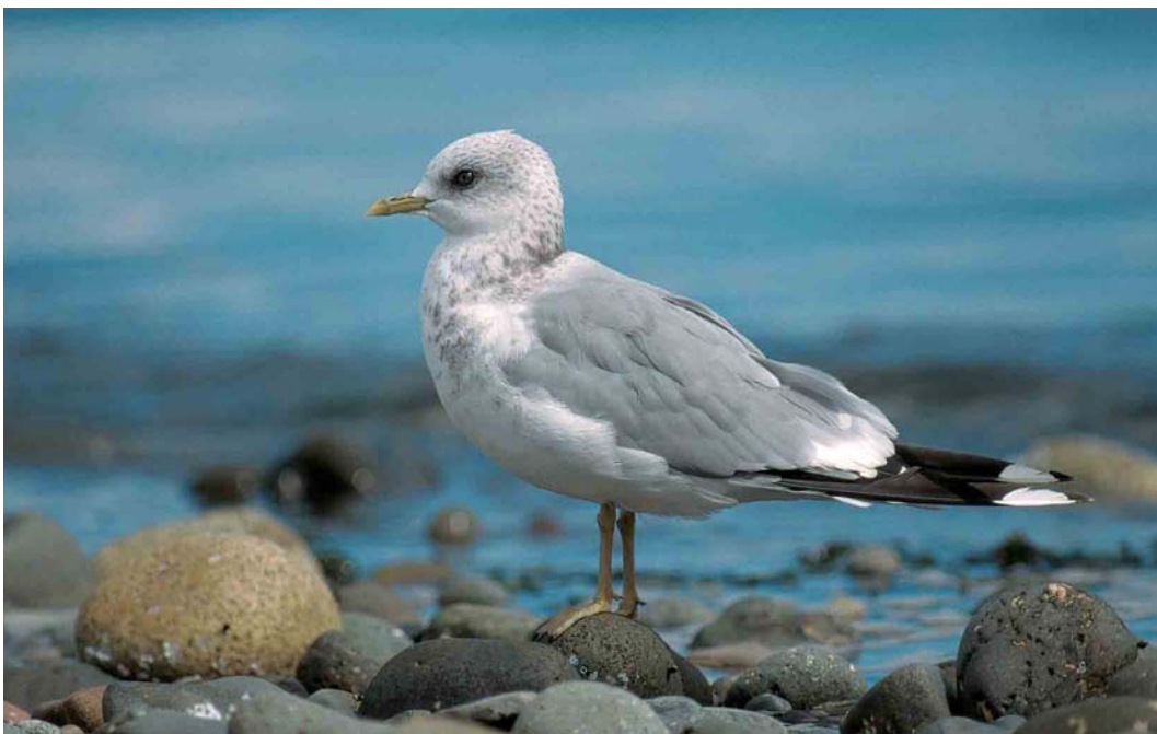
297 Short-billed Gull / Amerikaanse Stormmeeuw Larus canus brachyrhynchus , Vancouver Island, British Columbia, Canada, 12 September 1998 (René Pop)