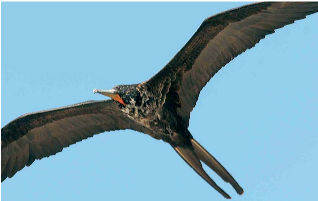
322 Magnificent Frigatebird / Amerikaanse Fregatvogel Fregata magnificens , immature, Pochotal, Costa Rica, 19 December 2006. Note characteristic pale and dark striped pattern of axillaries.