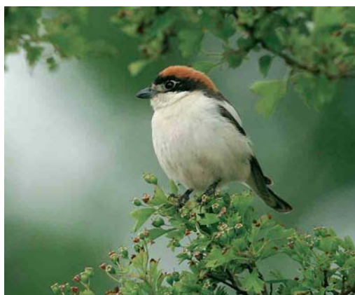
371 Bijeneters / European Bee-eaters Merops apiaster , Kollumerwaard, Friesland, 16 mei 2007 (Martijn Bot) 372 Roodstuitzwaluw / Red-rumped Swallow Cecropis daurica , Koarnwertersân, Friesland, 13 mei 2007 (Johnny van der Zwaag) 373 Roodkopklauwier / Woodchat Shrike Lanius senator , Colijnsplaat, Zeeland, 31 mei 2007 (Pim A Wolf) 374 Roodkopklauwier / Woodchat Shrike Lanius senator , Colijnsplaat, Zeeland, 31 mei 2007 (Niels de Schipper)

over de Maasvlakte, Zuid-Holland; en op 19 juni mogelijk in Meijndel, Zuid-Holland. Een Steppevorkstaartplevier Glareola nordmanni verbleef vanaf 21 juni tot 5 juli bij Exloo, Drenthe. Op Texel verbleven tot 5 mei maximaal 14 Morinelplevieren Charadrius morinellus . Daarna volgden er tot 20 mei nog 22 op andere plekken in het land en was er een laat exemplaar van 6 tot 9 juni in de Kennemerduinen, Noord-Holland. Amerikaanse Goudplevieren Pluvialis dominica werden opgemerkt op 26 mei bij De Slufter op Texel, op 26 en 27 mei in de Workumerwaard, Friesland, en op 15 juni in De Brekken. Verspreid over de periode werden 11 Gestreepte Strandlopers Calidris melanotos aangetroffen. Er werd eenzelfde aantal Breedbekstrandlopers Limicola falcinellus opgemerkt, vrijwel allemaal in mei en voornamelijk langs de Waddenkust. De laatste twee werden waargenomen op 1 juni in de Ezumakeeg. Op 27 juni liep een Blonde Ruiter Tryngites subruficollis op