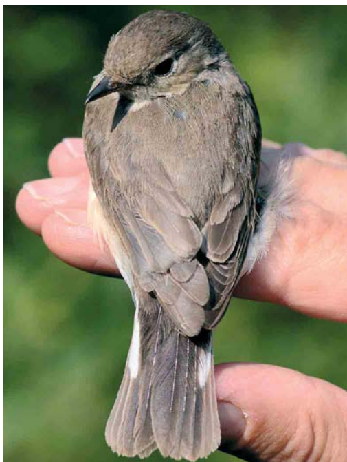
391 Kleine Vliegenvanger / Red-breasted Flycatcher Ficedula parva , tweede-kalenderjaar vrouwtje, Groene Glop, Schiermonnikoog, Friesland, 8 juni 2007

RED-BREASTED FLYCATCHER On 8 June 2007, a second calendar-year female Red-breasted Flycatcher Ficedula parva with a brood patch was trapped on Schiermonnikoog, Friesland, the Netherlands. This is a very strong indication that the bird was breeding or had attempted to breed on the island. In the same period, a singing adult male was found at a distance of 2.5 km. In 2006, another albeit weaker indication of the species' breeding on Schiermonnikoog was the presence of two first-year birds with remnants of the spotted juvenile body plumage trapped at the same site on 26 August and 10 September. However, an origin outside Schiermonnikoog of these two immature birds can not be excluded. Although possible or probable breeding of Red-breasted Flycatcher in the Netherlands has been reported several times in the past, there is still no confirmed and properly documented breeding record.