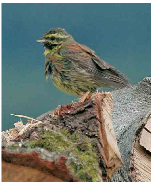
385 Buidelmees / Eurasian Penduline Tit Remiz pendulinus , Zeebrugge, West-Vlaanderen, 13 juni 2007 (Johan Buckens) 386 Veldrietzanger / Paddyfield Warbler Acrocephalus agricola , Heist, West-Vlaanderen, 12 juni 2007 (Johan Buckens) 387 Cirlgors / Cirl Bunting Emberiza cirlus , mannetje, Treignes, Mazée, Namur, 3 juni 2007 (Vincent Legrand) 388 Cirlgors / Cirl Bunting Emberiza cirlus , mannetje, Treignes, Mazée, Namur, 3 juni 2007 (Marc Ameels)

van een kleuring. In De Fonteintjes in Zeebrugge werd op 3 mei een langstreckende Lachstern Gelochelidon nilotica opgemerkt. Op 1 juni was een Reuzenster Hydroprogne caspia aanwezig in de Voorhaven van Zeebrugge en op 23 juni vloog er één over de Watersportbaan in Gent. In de Voorhaven van Zeebrugge werden vanaf 23 mei regelmatig Dougalls Sterns Sterna dougallii gezien, waarvan de meeste gekleuringd bleken, en in totaal waren het er minstens negen! Op 12 mei verschenen de eerste twee Witwangsters Chlido-