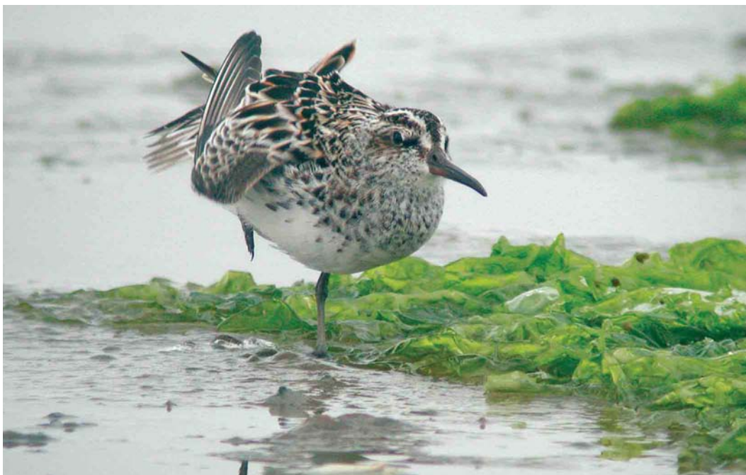
376 Breedbekstrandloper / Broad-billed Sandpiper Limicola falcinellus , Slikken van Flakkee, Zuid-Holland, 17 mei 2007