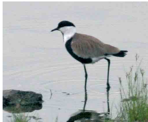
328 Black Scoter / Amerikaanse Zee-eend Melanitta americana , male, Jenny Brown's Point, Silverdale, Lancashire, England, 16 May 2007 329 Black-capped Petrel / Zwartkapstormvogel Pterodroma hasitata , c 16 km south-east off Graciosa, Azores, 26 May 2007 330 White-tailed Lapwing / Witstaartkievit Vanellus leucurus , Caerlaverock, Dumfries and Galloway, Scotland, 6 June 2007 331 Spur-winged Lapwing / Sporenkievit Vanellus spinosus , Mandra lake, Bulgaria, 23 May 2007

Germany was a second-year over Lebrade, Schleswig-Holstein, on 27 May (the previous one was at Kreis Viersen, Nordrhein-Westfalen, on 12 April). In 2006, 136 pairs of Lesser Kestrel Falco naumanni with 225 fledglings were counted in Crau, Bouches-du-Rhône, France, where only 30-60 pairs were present in the 1990s. The 12th for Sweden was a female in Västerbotten on 10 May. If accepted, a Saker Falcon F cherrug at Korppoo on 4 June will be the second for Finland. A calling but not sound-recorded Sora Porzana carolina at Salo, Halikonlahti, on 2 June will be the first for Finland, if accepted. The third Little Crane P parva for Shetland was at Burrafirth, Unst, from at least 29 May through June.