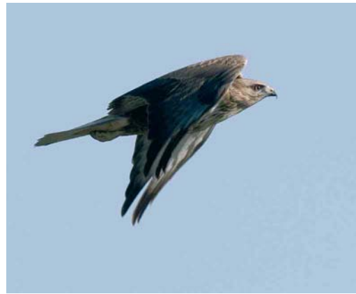
Mystery photograph VIII (January)

In Magnificent Frigatebird, immature and adult females and immature males are easily distinguished from Ascension Frigatebird and Lesser Frigatebird by the pattern on the axillaries. The latter two species show entirely white axillaries, sometimes referred to as 'spurs' (cf plate 321). These may appear as extensions of the white breast patches of young and female birds. Magnificent, however, only shows pale fringes to these feathers creating a characteristic pale and dark striped