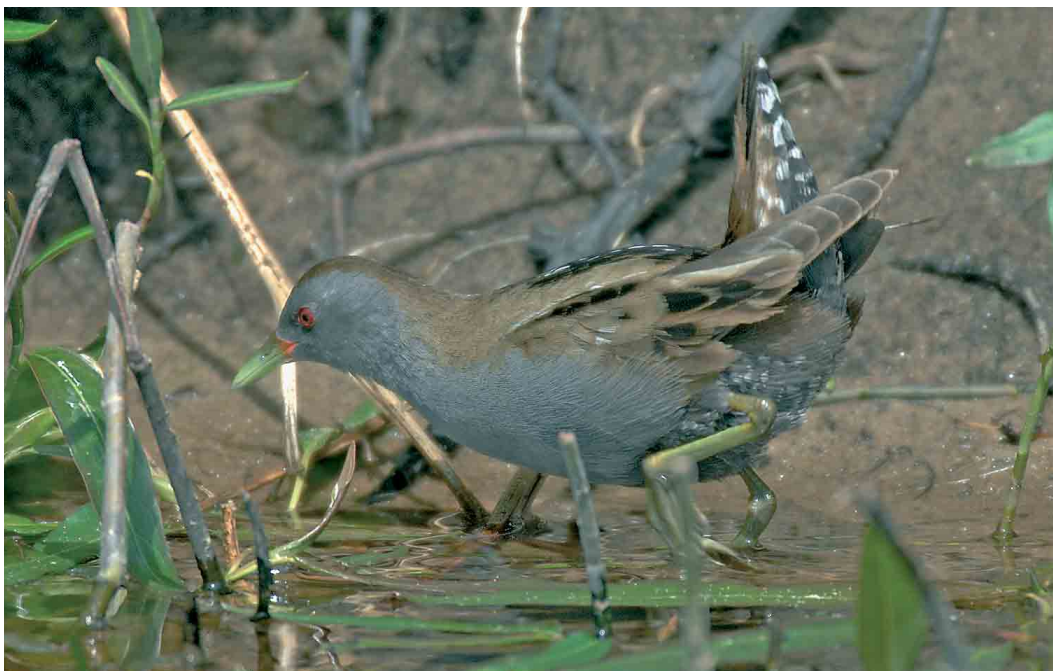
341 Little Crake / Klein Waterhoen Porzana parva , Burrafirth, Unst, Shetland, Scotland, 10 June 2007 (Tim Loseby)