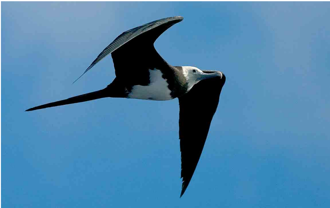
321 Ascension Frigatebird / Ascensionfregatvogel Fregata aquila , immature, Ascension Island, 7 April 2006. Note entirely white axillaries.