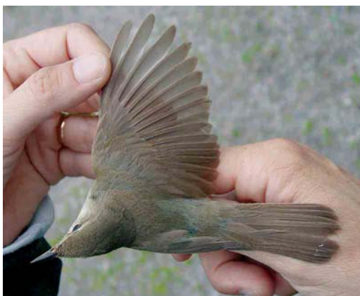
310 Blyth's Reed Warbler / Struikrietzanger Acrocephalus dumetorum , adult male, Espoo, Finland, 30 June 2004