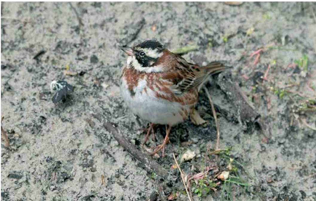
382 Bosgors / Rustic Bunting Emberiza rustica , mannetje, Rottumerplaat, Groningen, mei 2007 (Hans Roersma)