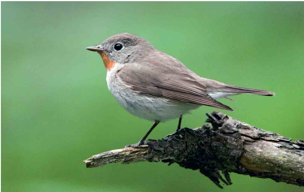
381 Kleine Vliegenvanger / Red-breasted Flycatcher Ficedula parva , mannetje, Tweede Dennenbos, Schiermonnikoog, Friesland, 26 mei 2007