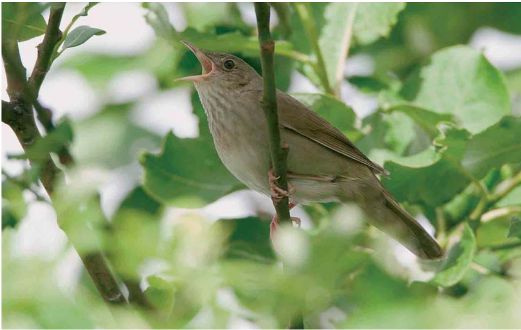
379 Kreekelzanger / River Warbler Locustella fluviatilis , Brunssum, Limburg, 19 mei 2007