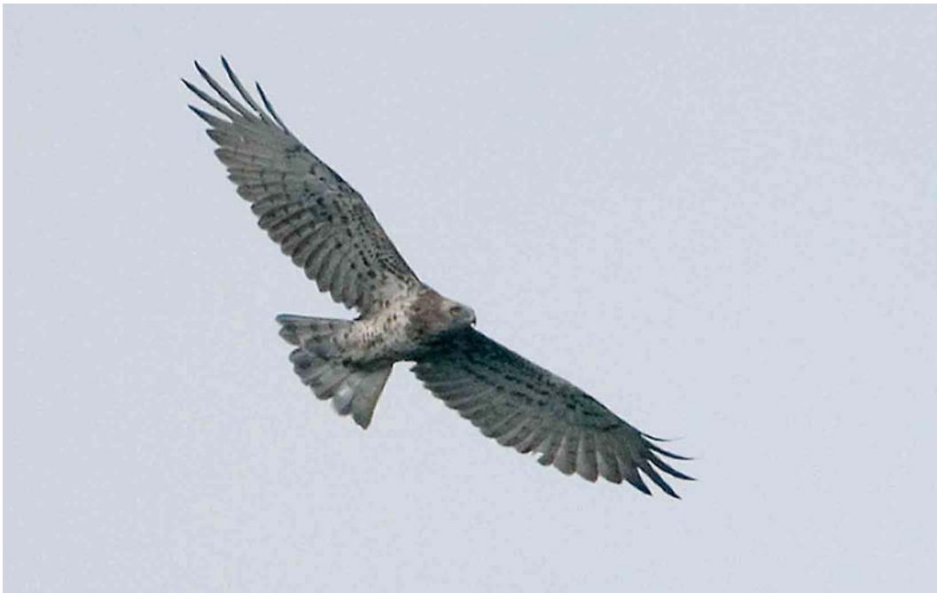
356 Slangenarend / Short-toed Eagle Circaetus gallicus , Fochteloërveen, Friesland, 13 juni 2007 (Roland Jansen)