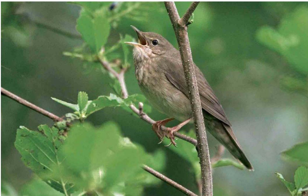
380 Kreekelzanger / River Warbler Locustella fluviatilis , Kollumerwaard, Lauwersmeer, Friesland, 15 mei 2007 (Jan Bosch)