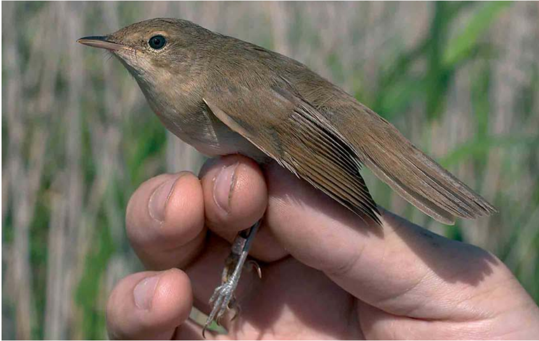
316 Blyth's Reed Warbler / Struikrietzanger Acrocephalus dumetorum , first-year, Espoo, Finland, 7 August 2004