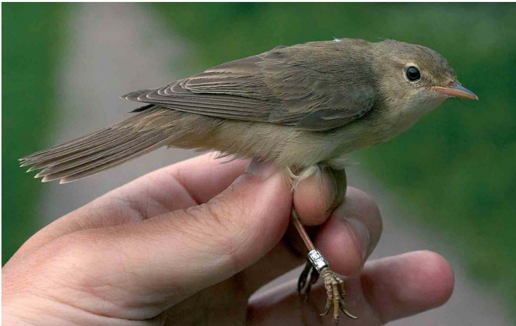
314 Marsh Warbler / Bosrietzanger Acrocephalus palustris , adult, Espoo, Finland, 7 June 2006