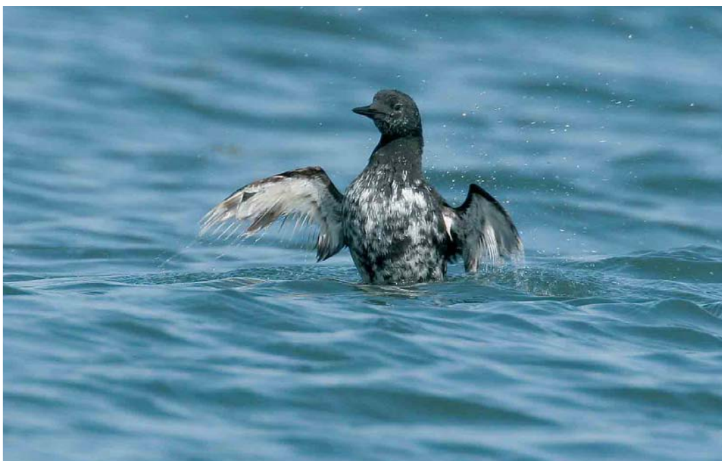
357 Zwarte Zeekoet / Black Guillemot Cepphus grylle , adult, De Val, Zierikzee, Zeeland, 19 mei 2007